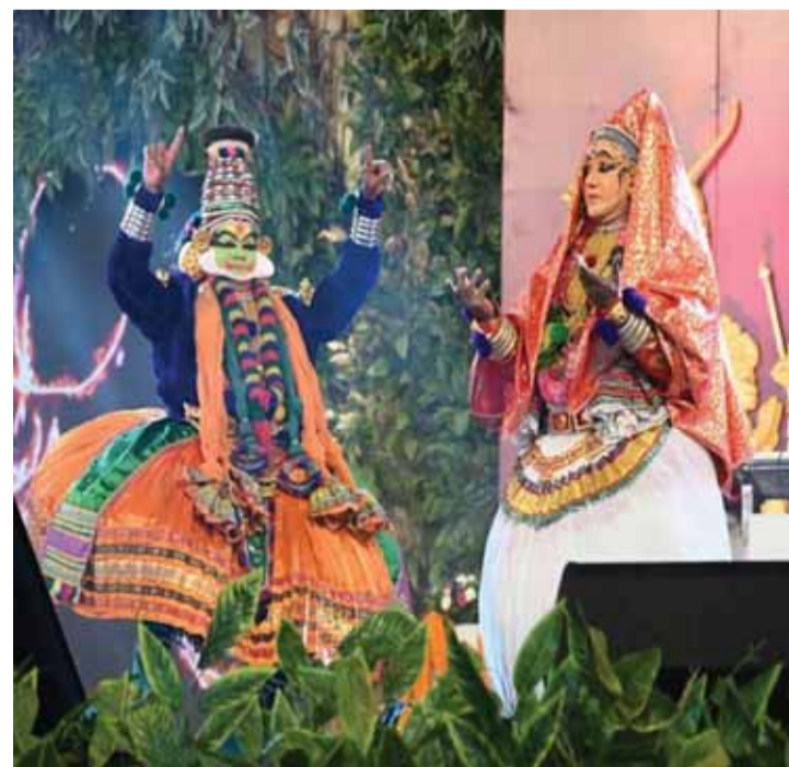
Glimpses from the concluding day on Saturday of the three-day Ramayan Festival at Ramleela ground in Chhattisgarh's Raigarh.