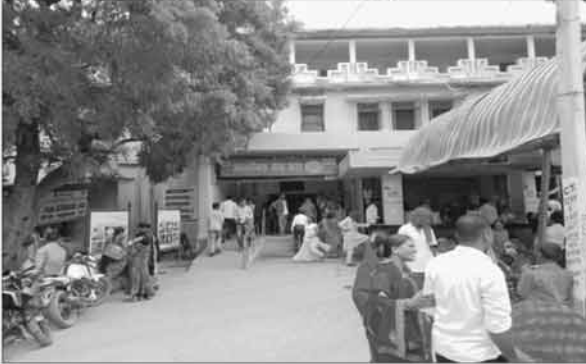
An entry to emergency service in the MMCH Daltonganj.