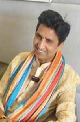
harmonious governance. He hailed the Chhattisgarh government's project Ram Van Gaman

He emphasized that Lord Ram embodies the paramount ideals of universal well-being, prosperity and