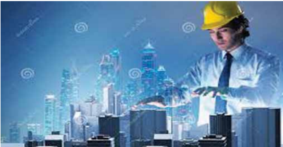
The officials said the internship in solid waste management was approved under the All India Council for Technical Education (AICTE). The urban bodies on suc-

The candidates having completed their Bachelor of Engineering or Bachelor of Technology or general qualification can apply online by June 16, an official communication said on Friday.