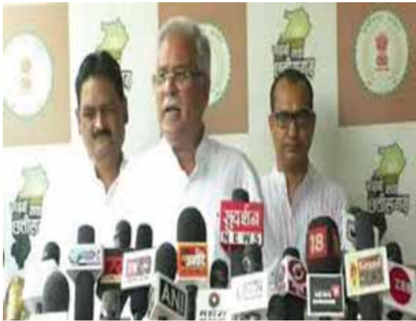
Emphasizing that a political leader had to be active consistently on social media, he said one had to

A perception should be formed only after studying the contribution of legendary leaders and learning the truth, he said.