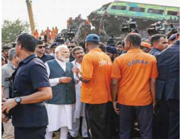
Prime Minister Narendra Modi interacts with rescuers as he takes stock of the situation at the site of the accident involving Coromandel Express, Bengaluru-Howrah Express and a goods train, in Balasore district on Saturday

"The government is deeply saddened by the incident. We will not spare anyone found guilty, and they will face strong consequences for this tragedy," he stated. He further assured that instructions have been issued to ensure a thorough and swift investigation into the mishap.