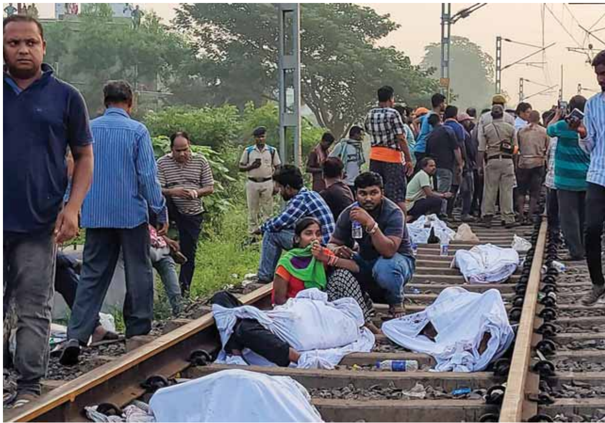
Passengers wait at the site where Coromandel Express, Bengaluru-Howrah Express and a goods train derailed, in Balasore district on Saturday