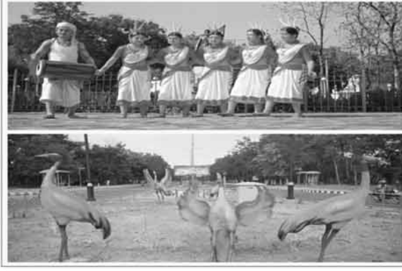
PNS : BOKARO

The sylvan industrial township of SAIL, Rourkela Steel Plant (RSP) is adorning a new look with artistic street art, murals and sculptures giving pleasant and memorable experience to the visitors as well as Rourkelites. They are well complemented with artistic illumination and fountains. All the important road intersections, public places and strategic junctions along the Ring Road have got artistic