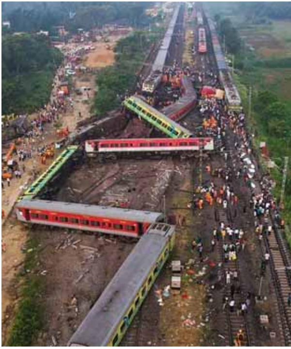
Rescue work underway after an accident involving Coromandel Express, Bengaluru-Howrah Express and a goods train, in Balasore district on Saturday

In a tweet from March last year, he mentioned the system's ability to automatically stop a locomotive before reaching another locomotive at a dis-