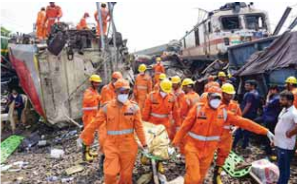
NDRF personnel carry out rescue work after an accident involving Coromandel Express, Bengaluru-Howrah Express and a goods train, in Balasore district on Saturday

"We have more than 300 rescuers divided into nine