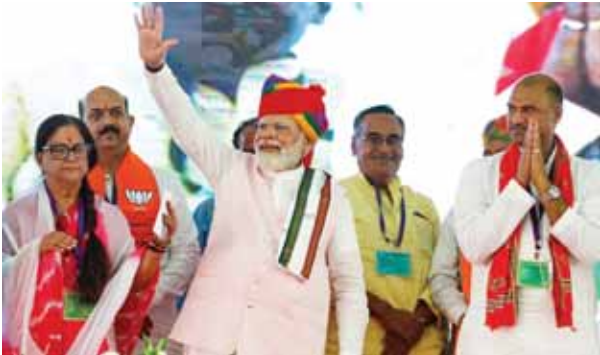
Prime Minister Narendra Modi waves at supporters during a public meeting in Ajmer on Wednesday. Former Rajasthan CM Vasundhara Raje is also seen

"The Opposition insulted the hard work of 60,000 labour-