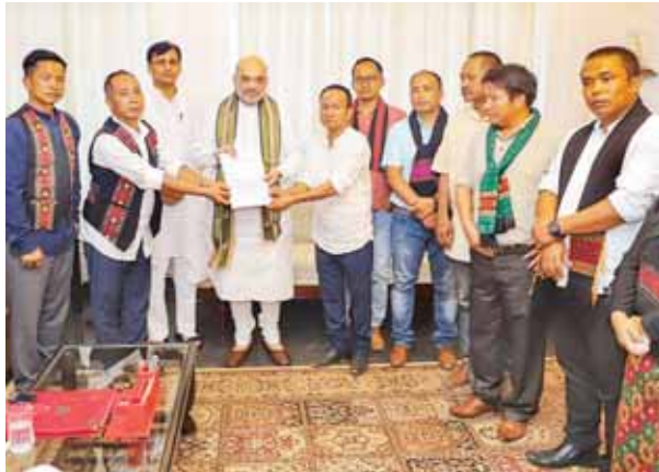
Union Home Minister Amit Shah in a meeting with a Kuki delegation, in Moreh, Manipur on Wednesday

The Centre is working on a three-pronged approach to bring the warring Meitei and Kuki communities into a narrow common ground for lasting peace in trouble-torn Manipur, sources said on Wednesday. These include dialogue with the affected people, rehabilitating those who had to leave their homes