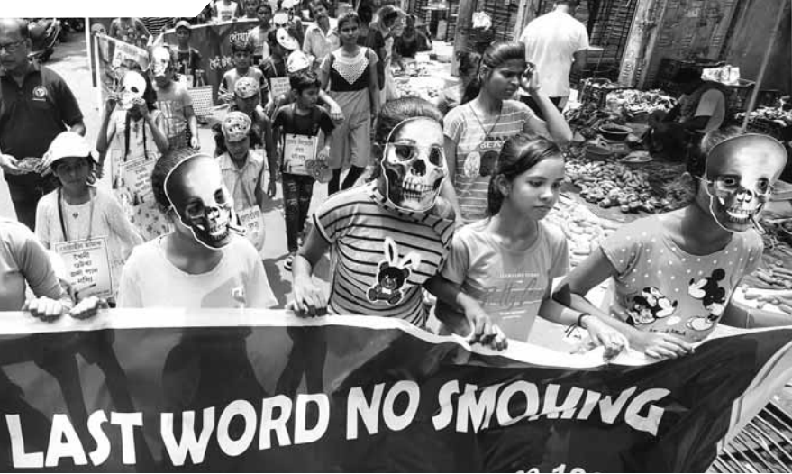
Volunteers raise awareness about the dangers of tobacco consumption on World No Tobacco Day, in Kolkata