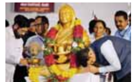
The Maharashtra CM and the Deputy CM pay tribute to Ahilyadevi Holkar on her birth anniversary, in Ahmednagar on Wednesday

AHMEDNAGAR. COLLEGE TO BE NAMED AFTER HOLKAR