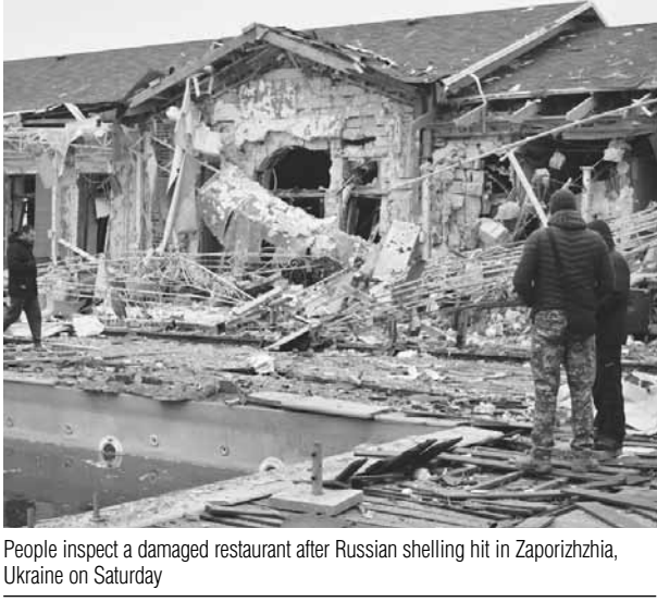
People inspect a damaged restaurant after Russian shelling hit in Zaporizhzhia, Ukraine on Saturday