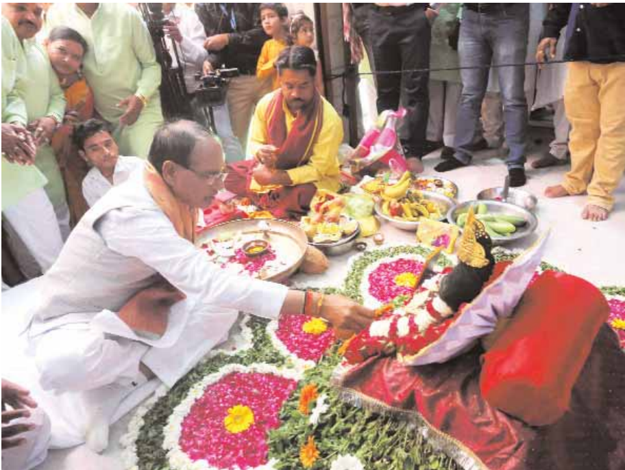
Madhya Pradesh Chief Minister Shivraj Singh Chouhan offers prayer on the occasion of Maa Karma Bai Jayanti at Sahu Samaj temple in Bhopal on Saturday.

Southeasterly winds are bringing moisture from the Bay of Bengal and the Arabian Sea. Due to the mixture of these two, there is effect of rain, hailstorm and strong storm in the state. The situation will remain like this till March 20.