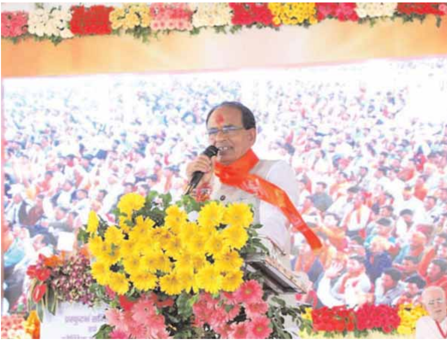
Chief Minister Shivraj Singh Chouhan was addressing the state-level Mahakumbh of the Prasfutan Samitis of Jan Abhiyan Parishad at Jamboree ground in Bhopal on Saturday.

erful India is being built under the leadership of Prime Minister Modi. The whole country stands with Prime Minister Modi. Neighboring countries also aspire to have a Prime Minister like Modi ji. In the era of Covid, the Prime Minister worked to increase the courage of the countrymen by helping them. Vaccines were manufactured in India. The Jan Abhiyan Parishad did a good job in the interest of the public during the Corona period. Chouhan said that Mukhya Mantri Ladli Bahna Yojana has been launched for the empowerment of sisters. The workers, members and office bearers of the Parishad have to co-operate in the implementation of the scheme. This scheme has been started after a lot of deliberations to increase the respect and honour of the sisters.