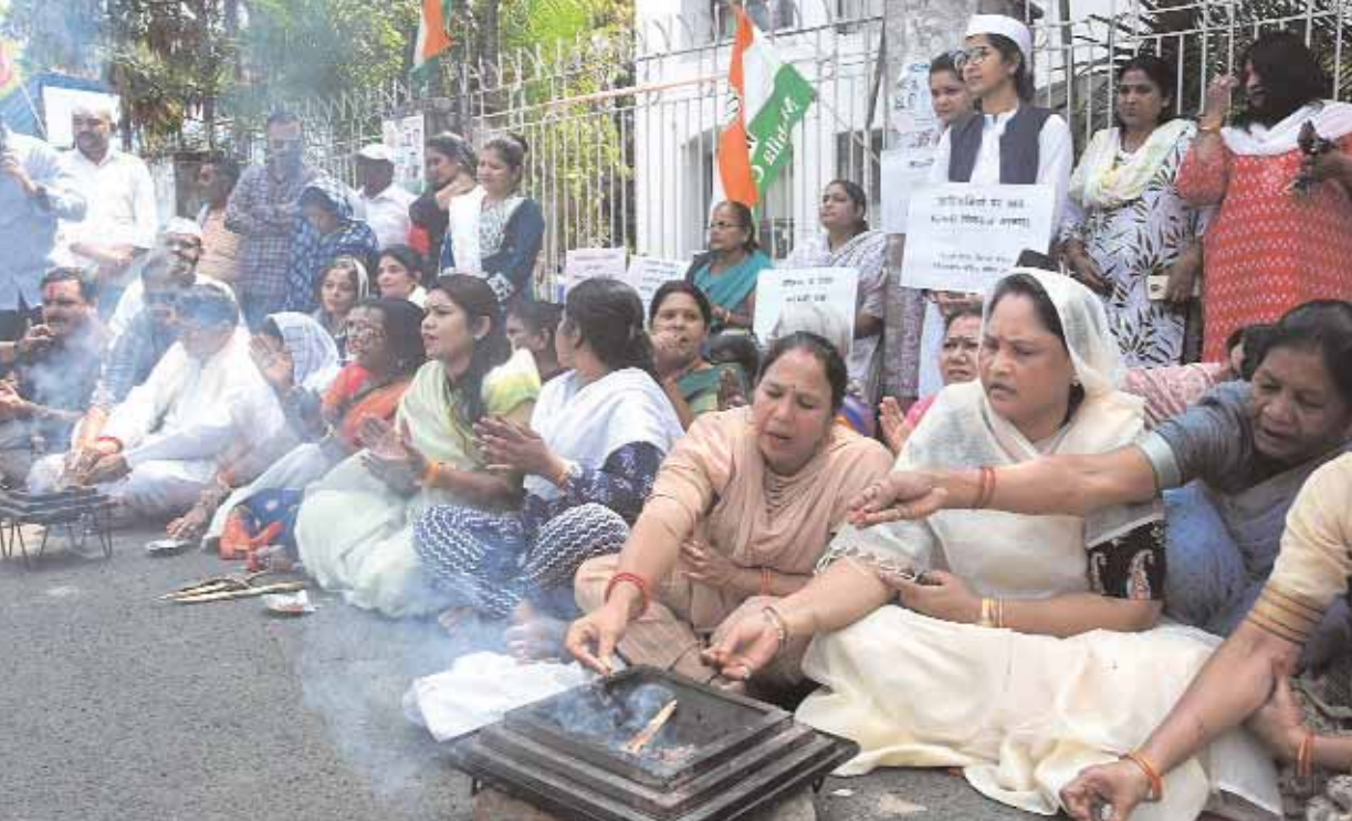
Mahila Congress workers perform a Yagna for the wisdom of Chief Minister Shivraj Singh Chouhan in the Tribal woman death incident, at PCC headquarters in Bhopal on Saturday.