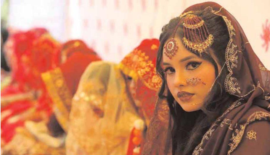
Muslim Community brides participate in a mass marriage ceremony under Mukhyamantri Kanyadan Yojna in Bhopal on Saturday. Around 172 couples tied nuptial knots in the mass marriage ceremony..