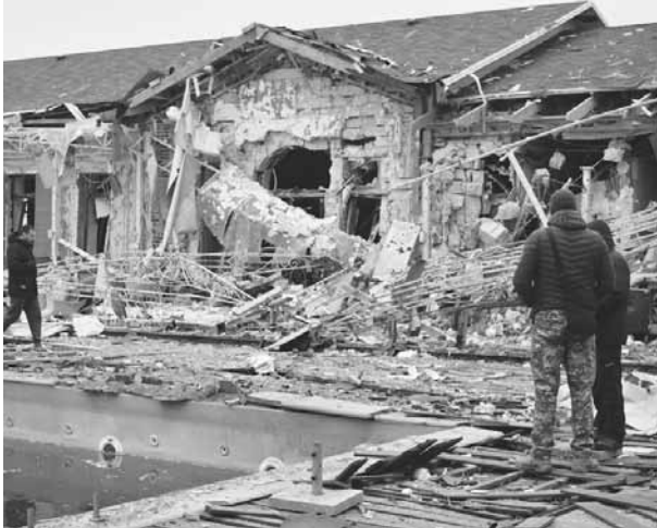
People inspect a damaged restaurant after Russian shelling hit in Zaporizhzhia, Ukraine on Saturday