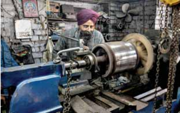
The packaging industry is growing at 15-17 per cent and the sector has the potential to create employment opportunities in the country, industry experts said in New Delhi

The event was organised by the Indian Institute of Packaging (IIP), an autonomous body under the Union Ministry of Commerce and Industry, a release said. The packaging business in the world is worth USD 79 billion