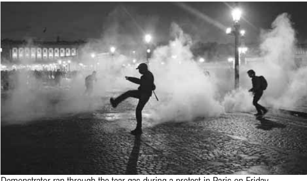
Demonstrator ran through the tear gas during a protest in Paris on Friday