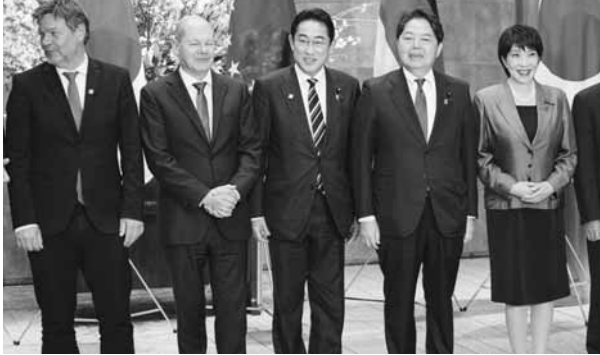
German Chancellor Olaf Scholz, second left, and Japan’s Prime Minister Fumio Kishida, centre, pose for a family pictures at prime minister’s official residence in Tokyo on Saturday