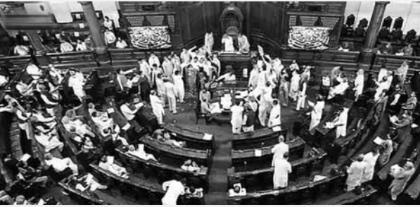
PIONEER NEWS SERVICE ■ NEW DELHI

Several opposition parties on Monday accused the government of stalling Parliament and finding ways to divert attention from the opposition demand for a Joint Parliamentary Committee (JPC) into the Adani issue.