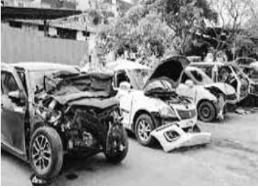
PIONEER NEWS SERVICE ■ NEW DELHI

While the West has seen steady fall in incidence of road traffic accidents, India continues to record higher injuries with nearly 1,50,000 deaths annually of which 25 per cent is contributed by two wheeler road mishaps, doctors flagged concerns on World Head Injuries Awareness Day on Monday.