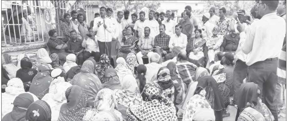
stir was put off.