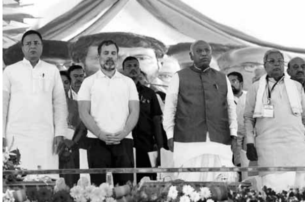
Congress president Mallikarjun Kharge with party leader Rahul Gandhi and others during the ‘Yuva Kranti Samavesha’, in Belagavi, on Monday

Addressing a public rally at Belagavi in northern Karnataka, Gandhi hit out at the BJP-led Central government, saying “this country belongs to everyone, does not belong to two to three selected, it is not Adani’s”. “Select people, who are BJP’s friends, are getting all the benefits. It is