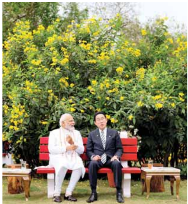
Prime Minister Narendra Modi and Japanese PM Fumio Kishida at Buddha Jayanti Park in New Delhi on Monday

The visit came amid the ongoing Ukraine conflict and its adverse impact on the global supply chains of energy and food. The visit also came in the backdrop of China’s growing assertiveness in the strategically-crucial