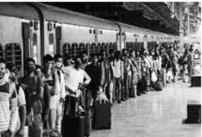
PIONEER NEWS SERVICE ■ NEW DELHI/PATNA

A day after TV screens installed at platform number 10 at Patna railway station played a porn clip, the Railways on Monday said it has cancelled the contract of the agency responsible for relaying advertisements on the screens.