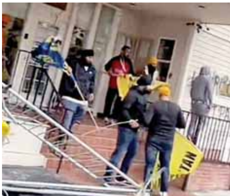
Pro-Khalistan supporters vandalise the Consulate General of India during a protest in San Francisco on the USA

High Court, a non-bailable warrant was also issued against the extremist on Monday.