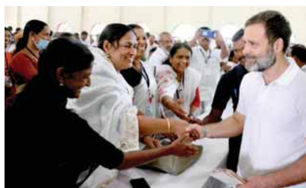
Congress leader Rahul Gandhi interacts with the elected UDF and LSGI members from Wayanad district at Kalpetta in Wayanad district on Tuesday

The Lok Sabha, however, managed to pass a ₹1.185-lakh