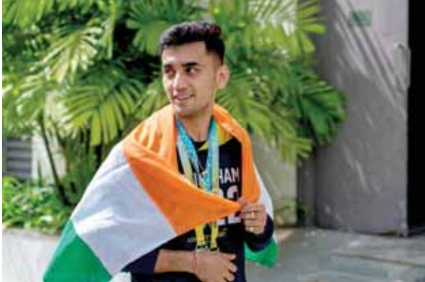
PTI ■ NEW DELHI

Commonwealth Games champion Lakshya Sen slipped six places to move out of the world top 20 in the latest men's singles rankings issued by BWF on Tuesday. Following his second round exit from the All England Championship, Sen slumped to the 25th spot. The 21-year-old, who had reached a career-best world no. 6 in November last year, hasn't been in the best of form, having made early exits from Malaysia Open, India Open and German Open. Last year, Sen had a rampaging run in the European circuit early in the season, winning the