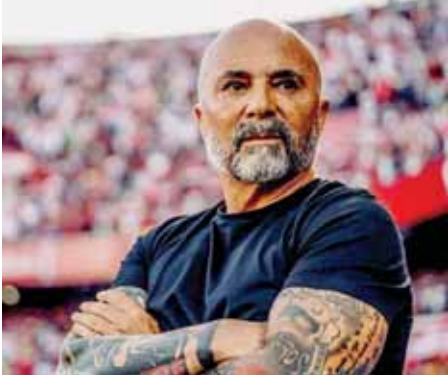
■ SEVILLE

Argentinian Jorge Sampaoli was sacked as coach of struggling Sevilla on Tuesday, with the club just off the relegation zone. "Sevilla FC have today relieved Jorge Sampaoli of his duties," the club said in a statement. "Following the defeat at Getafe, which leaves the side just above the relegation zone, the club have decided to part ways with the Argentine