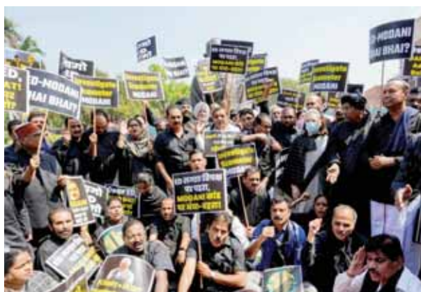
Opposition MPs, wearing black over the disqualification of Congress leader Rahul Gandhi from the Lok Sabha, protest over the Adani Group issue at Parliament House complex, in New Delhi on Monday

An editorial in party mouthpiece "Saamana" said