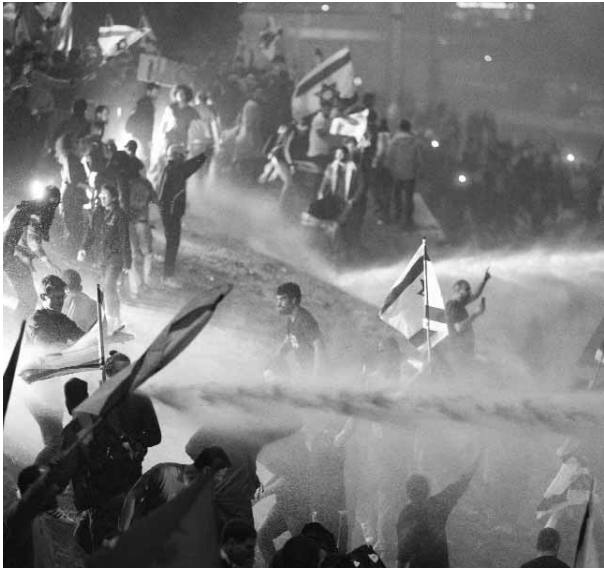
Israeli police use a water cannon to disperse demonstrators blocking a highway during a protest against plans by Prime Minister Benjamin Netanyahu’s government to overhaul the judicial system in Tel Aviv, Israel on Monday.

Prime Minister Netanyahu in his first public statement since widespread demonstra-