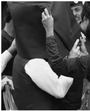
Security personnel with bulletproof shields escort Imran Khan as he arrives to appear in a court in Islamabad on Monday

arguments granted interim bail to the former premier. Intense clashes erupted outside the judicial complex on March 18 when Khan arrived from Lahore to attend a much-awaited hearing in the Toshakhana case.