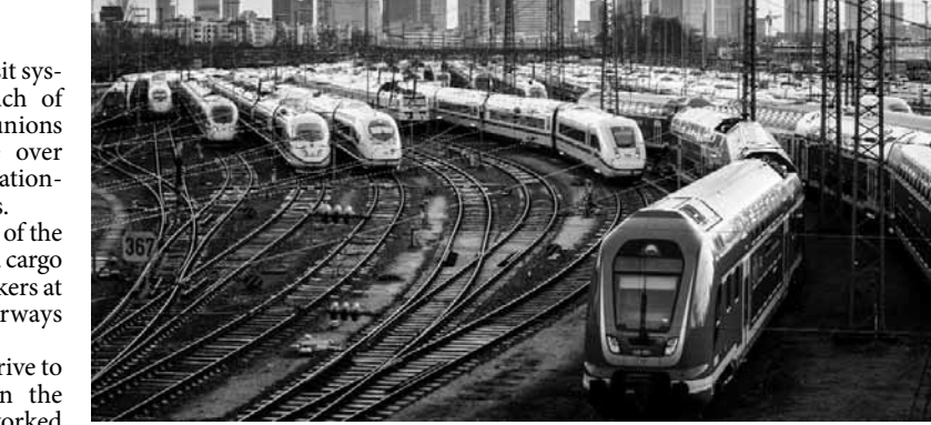
Trains parked near the central train station in Frankfurt, Germany, on Monday