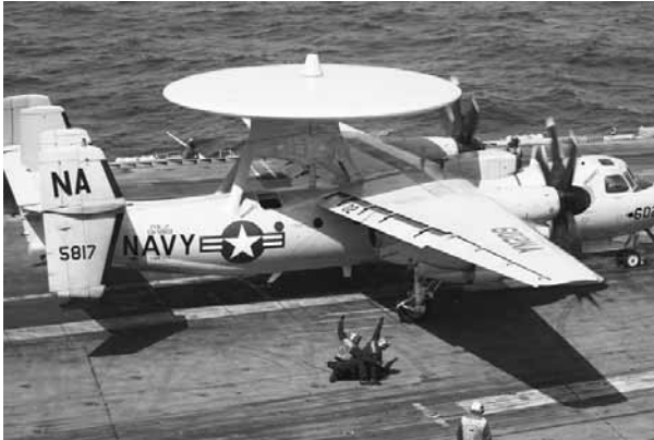
A US Navy aircraft Hawkeye and crew members are seen on the flight deck of the USS Nimitz off the coast of Busan, South Korea, on Monday