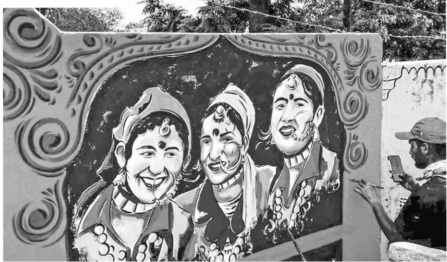
An artist makes paintings depicting the Uttarakhand culture as part of preparation ahead of the G-20 meeting