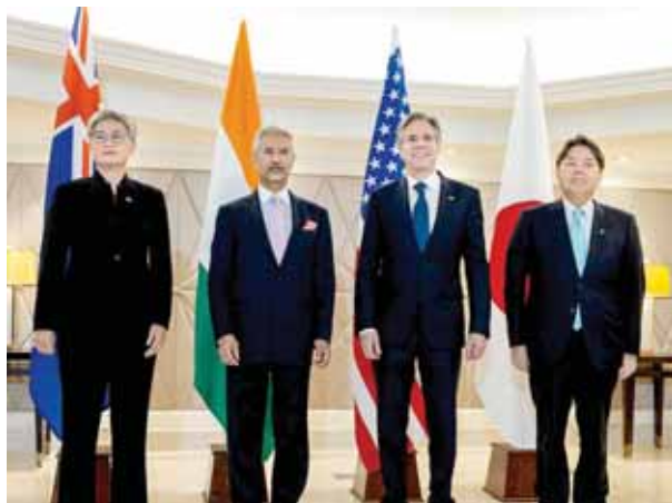
External Affairs Minister S Jaishankar with US Secretary of State Antony Blinken, Japan's Minister for Foreign Affairs Yoshimasa Hayashi and Australia's Foreign Minister Penny Wong before the Quad Foreign Ministers' Meeting, in New Delhi on Friday

They reiterated their condemnation of terrorist attacks, including 26/11 Mumbai