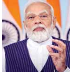
Prime Minister Narendra Modi addresses a post-budget webinar on 'Developing Tourism in Mission Mode', in New Delhi on Friday

He expressed delight at the appreciation shown towards this year's budget by the people of India, and said had it been an old world cul-