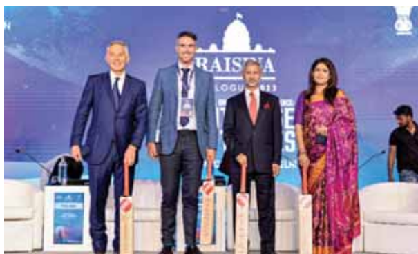
External Affairs Minister S Jaishankar with former British PM Tony Blair and former cricketer Kevin Pietersen at the Raisina Dialogue 2023 in New Delhi on Friday

Incidentally, he introduced switch hit to tackle bowlers. The ex-cricketer also called