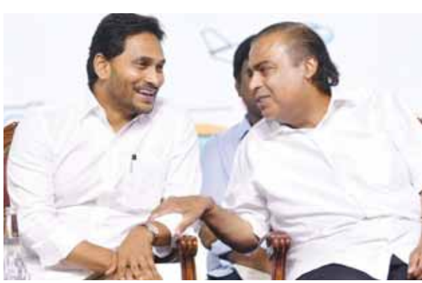
Andhra Pradesh Chief Minister YS Jagan Mohan Reddy with Reliance Industries Chairman Mukesh Ambani at the Global Investors Summit 2023, in Visakhapatnam on Friday