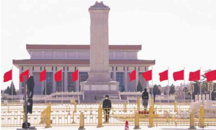
Security personnel guard Tiananmen Square ahead of the annual Congress in Beijing on Wednesday

The United States is "fabricating excuses to suppress Chinese companies," said a foreign ministry spokeswoman, Mao Ning. She called on Washington to "abandon ideological prejudice" and "stop