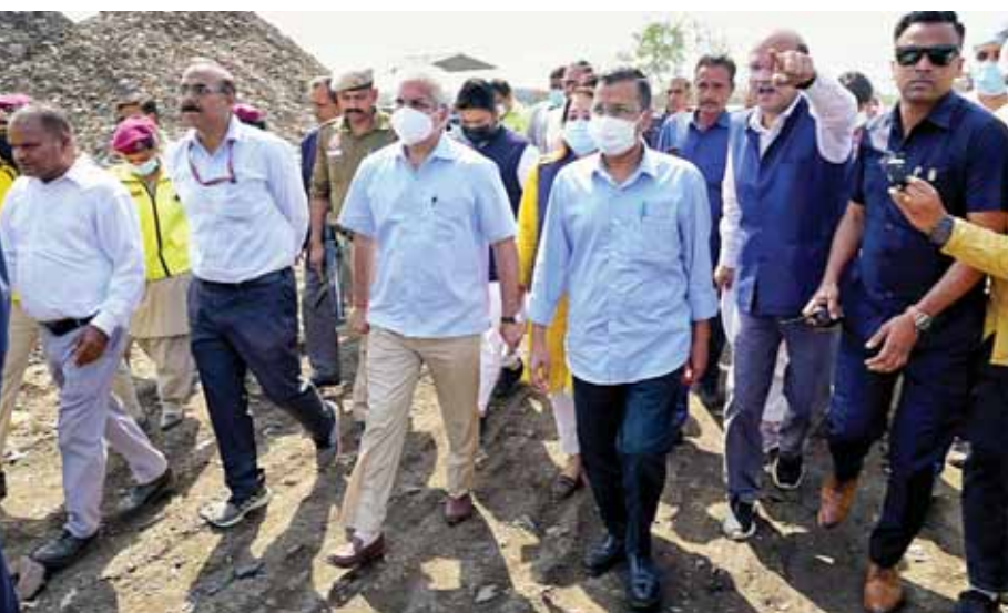
Delhi Chief Minister Arvind Kejriwal, along with officials, visits Okhla landfill site in New Delhi on Friday

Delhi Chief Minister Arvind Kejriwal on Friday visited the Okhla landfill site and said the target is to clear the city of all three mountains of garbage by December 2024. Kejriwal, during his visit to the site in south Delhi, was accompanied by his cabinet colleague Kailash Gahlot, Mayor Shelly Oberoi and Municipal Commissioner Gyanesh Bharti further said that the target is to clear the Okhla landfill site by May 2024, but we will try to clear it by December 2023. The monstrous Okhla landfill was commissioned in 1990s and it reached its saturation point several years ago. The Okhla landfill site contains about 40 lakh MT of legacy waste in it. In the last few years, about 20-25 lakh MT have been removed from it, but about 40 lakh MT still remains