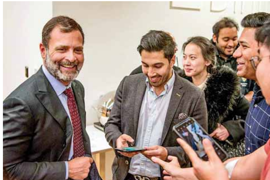
Congress leader Rahul Gandhi interacting with people at Cambridge in London

An array of BJP leaders on Friday launched a broadside against Rahul, alleging the Congress leader is "hallucinating" and makes such claims as he wants to create headlines wherever he goes. "We can