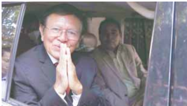
Kem Sokha greets from his car in front of his house in Phnom Penh, Cambodia on Friday

The popular CNRP was seen as an electoral threat to Hun Sen's Cambodian People's Party ahead of the 2018 general election. Kem Sokha's arrest