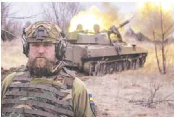
A self-propelled artillery vehicle fires on the frontline, Donetsk region, Ukraine, on Thursday

Western officials fear Russia could use simmering tensions in Kosovo to try to destabilize the Balkans and avert some attention from the invasion of Ukraine.