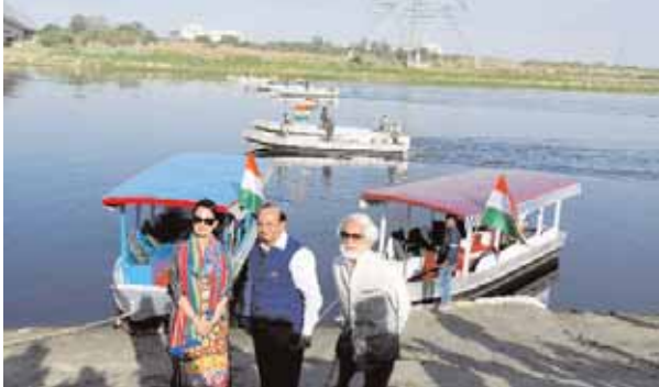
Lt Governor VK Saxena inspects and reviews the progress of cleaning operations on the Yamuna floodplains and interacts with the media at Qudsia Ghat in New Delhi on Monday

An artificial wetland system comprising Root Treatment Plants namely Canna Indica and Vetivar Grass has been created to clean the sewage water coming in