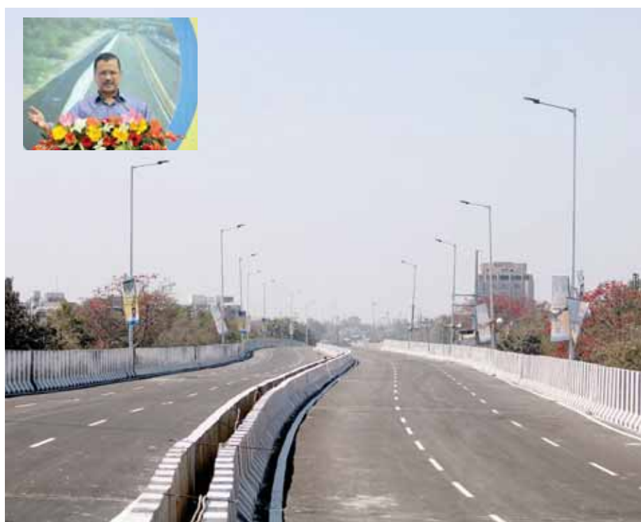
Residents heave a sigh of relief as Ashram Flyover extension opens: Opening of the flyover extension in South Delhi will not only ease traffic congestion in the area but will also help people reach markets and hospitals in less time. People will now be able to reach Delhi from Noida in 20 minutes, bringing AIIMS closer