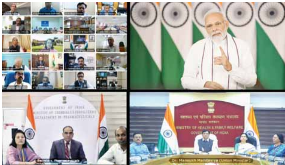
Prime Minister Narendra Modi addresses a post-Budget webinar on 'Health and Medical Research' on Monday

"Today the market size of the pharma sector is 4 lakh crore. It can be worth 10 lakh crore with proper coordination between the private sector and