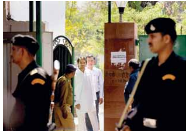
Bihar Minister and RJD MLA Tej Pratap at the residence of former Bihar Chief Minister Rabri Devi during a visit of CBI officials in connection with further probe in the land-for-jobs scam case, in Patna on Monday

The agency has already filed a charge-sheet in the case. The special court summoned the accused, including Prasad