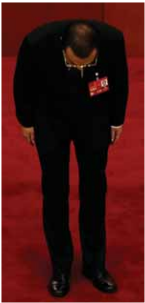
Chinese Premier Li Keqiang bows after delivering his state of the nation address at the opening session of China's National People's Congress (NPC) at the Great Hall of the People in Beijing, Sunday.