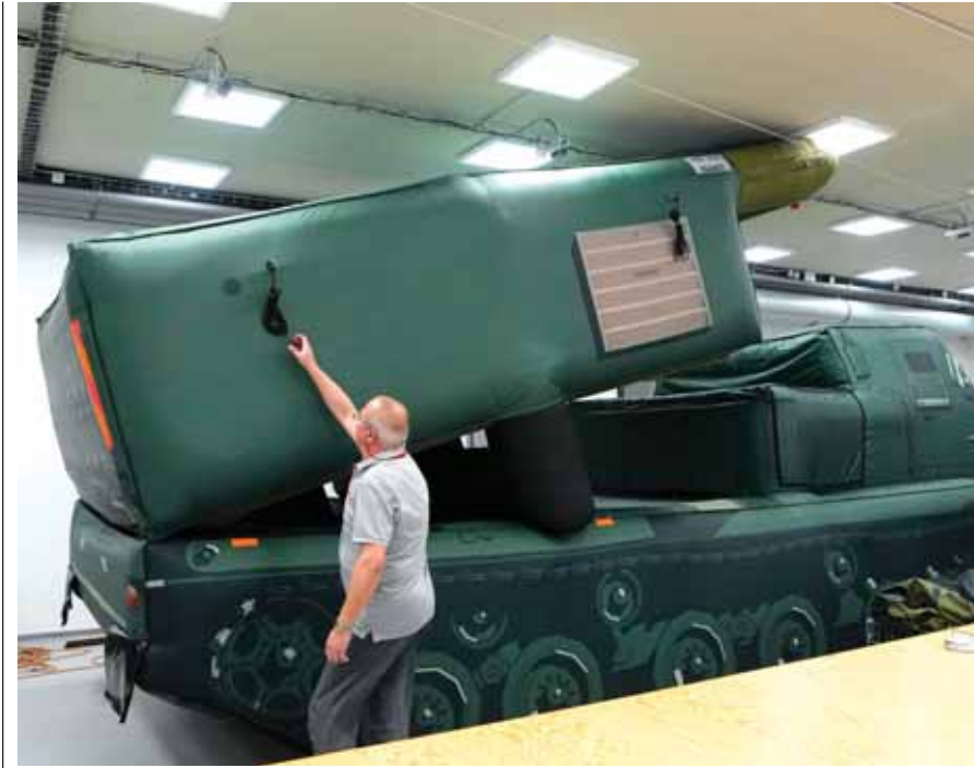
An inflatable decoy of High Mobility Artillery Rocket System (HIMARS) is presented to media in Decin, Czech Republic, on Monday. The war in Ukraine meant a boom for the weapons industry, for real arms but also their replicas. Czech company, Inflitech, has made a wide range of replicas of heavy arms, be it tanks, armoured vehicles, aircraft or artillery, including US-made HIMARS rocket system, the weapons that were among the billions of dollars in Western military aid that has helped Ukraine fight off the Russians since the Feb. 24 invasion.

The alliance has vowed to restore a parliamentary democracy in Turkey should they dislodge Erdogan, abolishing the presidential system that he introduced. Opponents say the system, which was narrowly approved in a 2017 referendum and was installed following elections in 2018, has amounted to "one-man rule" without checks and balances.