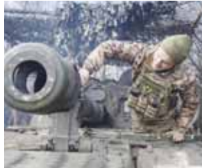
A Ukrainian paratrooper of the 80 Air Assault brigade prepares a self propelled howitzer 2s1 at the frontline near Bakhmut on Friday

However, the update added, it will be "highly challenging" for Wagner forces to push ahead, as Ukraine has destroyed key