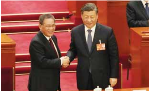
Newly elected Premier Li Qiang, center left, shakes hands with Chinese President Xi Jinping as former Premier Li Keqiang, at right, applauds during a session of China's National People's Congress (NPC) at the Great Hall of the People in Beijing on Saturday

Li Qiang in brief video clips shown on national television.