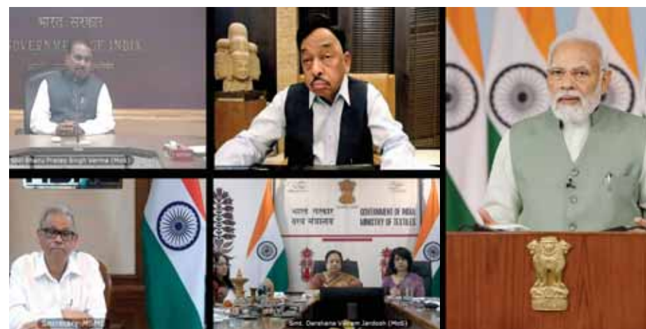
Prime Minister Narendra Modi addresses a post-budget webinar on 'PM Vishwakarma Kaushal Samman', on Saturday

Kaushal Yojana aimed at handholding artisans neglected even after Independence, says PM