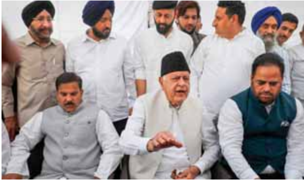
Jammu and Kashmir National Conference (JKNC) president Farooq Abdullah chairs an all-party meeting at his residence, in Jammu on Saturday

Referring to the statements of the Prime Minister and the Union Home Minister over