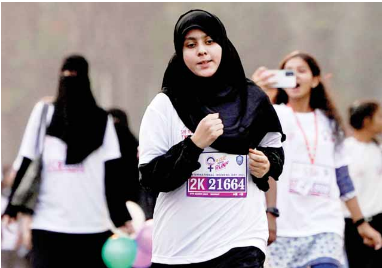
Students participate in marathon ahead of the International Women's Day in Hyderabad on March 6, 2023

Last but not least, although the majorities of women in