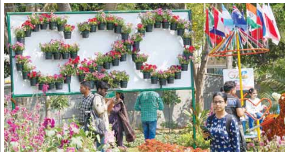
Visitors during the inauguration of the G20 Flower Festival at Central Park of Connaught Place, in New Delhi on Saturday