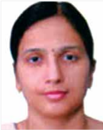
Professor, division of genetics, department of pediatrics, AIIMS, Delhi talks about how even though

CoEs have been set up, teething problems remain. For instance, "patients still don't know where to go...they always first come to OPD and from there, they are directed to go CoEs but there still exist gaps. For instance, patients still don't know where to go...they always first come to OPD and from there, they are directed to go for the nearest centre of excellence.