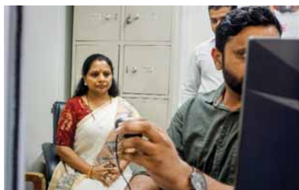
BRS MLC K Kavitha at the Enforcement Directorate office in connection with the Delhi excise policy case, in New Delhi on Saturday

He said the BJP will be left embarrassed if he made public the panchnama the ED signed after the raids. See P2