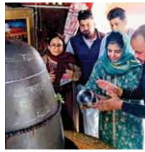
Peoples Democratic Party president Mehbooba Mufti offers prayers at Navagraha temple in Poonch district

"I do not want to break his heart by refusing to pour water (on the Shivaling). He asked for