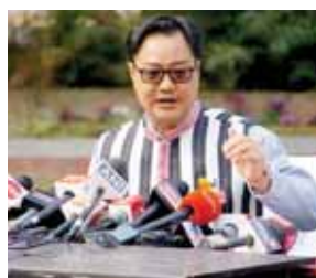
Union Minister Kiren Rijiju addresses a press conference at his residence in New Delhi on Thursday

Senior BJP leader Ravi Shankar Prasad said, "We will campaign across the country for an apology from Rahul Gandhi. It's his habit to speak baseless things. Not for once did he say today that he's denying his remarks made in the