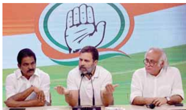
Congress leader Rahul Gandhi speaks during a press conference at AICC headquarters in New Delhi on Thursday

Rahul met Speaker Om Birla urging him to allow him to speak in the Lok Sabha. "I