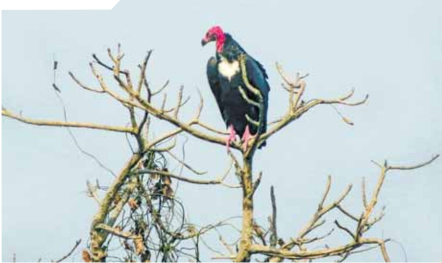
A red-headed vulture, also known as the Asian king vulture sighted in Dudhwa National Park