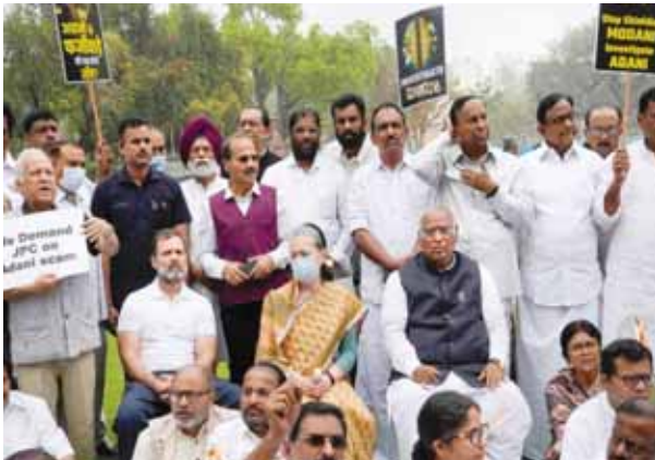
Leader of Opposition in Rajya Sabha Mallikarjun Kharge, former Congress president Sonia Gandhi, Rahul Gandhi and other Opposition MPs during a protest over the Adani issue at Parliament House complex in New Delhi on Friday

Proceedings on Sansad TV were mostly inaudible. While Parliament sources said it was the result of a “technical glitch”,