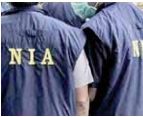
and proscribed terrorist organisations,” he said.

“The duo under an active conspiracy and Pakistan’s support had resurrected a platform reviving the narrative in support of the terrorist and separatist eco-system. They had been spreading anti-India narrative by exploiting digital platforms under a concealed and camouflaged setup, with the help of illicit funding received from hostile foreign agencies