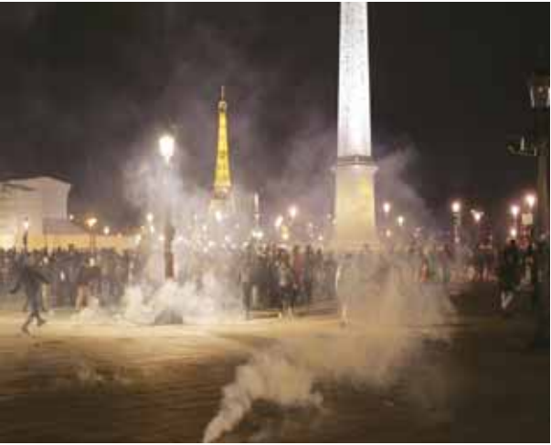
Protesters stand in a cloud of teargas after a demonstration in Paris.

which represents around 300 airlines comprising 83 per cent of global air traffic, said it has become "very challenging" for carriers to serve Pakistan as they struggle to repatriate their dues that are paid in dollars, the report said. Pakistan Civil Aviation Authority (PCAA) has said it was trying to pay the airlines on time and has been in contact with relevant authorities over the issue. In December 2022, the global aviation body said Pakistan has blocked USD 225 million it owed to international airlines, making it one of the top markets where airline funds were blocked from repatriation. The development comes at a time when Pakistan is staring at a balance of payment crisis, which is currently standing at an abysmal level of USD 4.3 billion. The ongoing crisis has also hit the aviation industry where airlines sell tickets in local currency, but repatriate dollars to pay for expenses such as fuel costs. The Financial Times, citing data from an aviation analytics company Cirium, reported that foreign airlines were reluctant to return to Pakistan, with fewer flights scheduled for March 2023 compared to 2019.