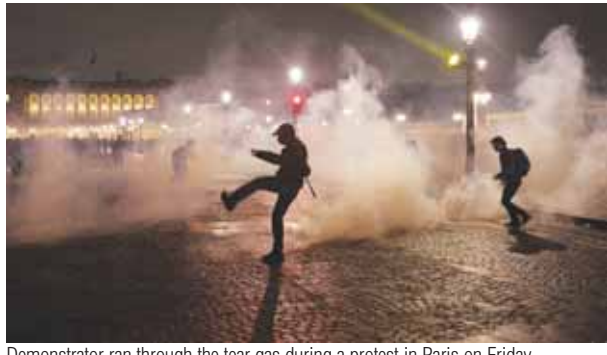
Demonstrator ran through the tear gas during a protest in Paris on Friday

At the elegant Place de Concorde, a festive protest by several thousand, with chants, dancing and a huge bonfire,