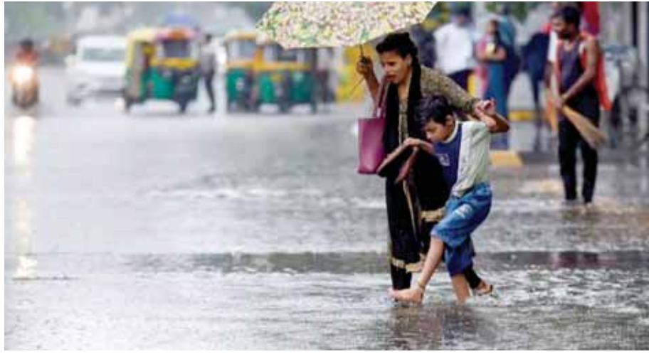
region and hailstorm in some areas. Another western disturbance will start affecting the region (from) Sunday... generally cloudy skies and on-and-off rain will continue over northwest India till March 20-21.