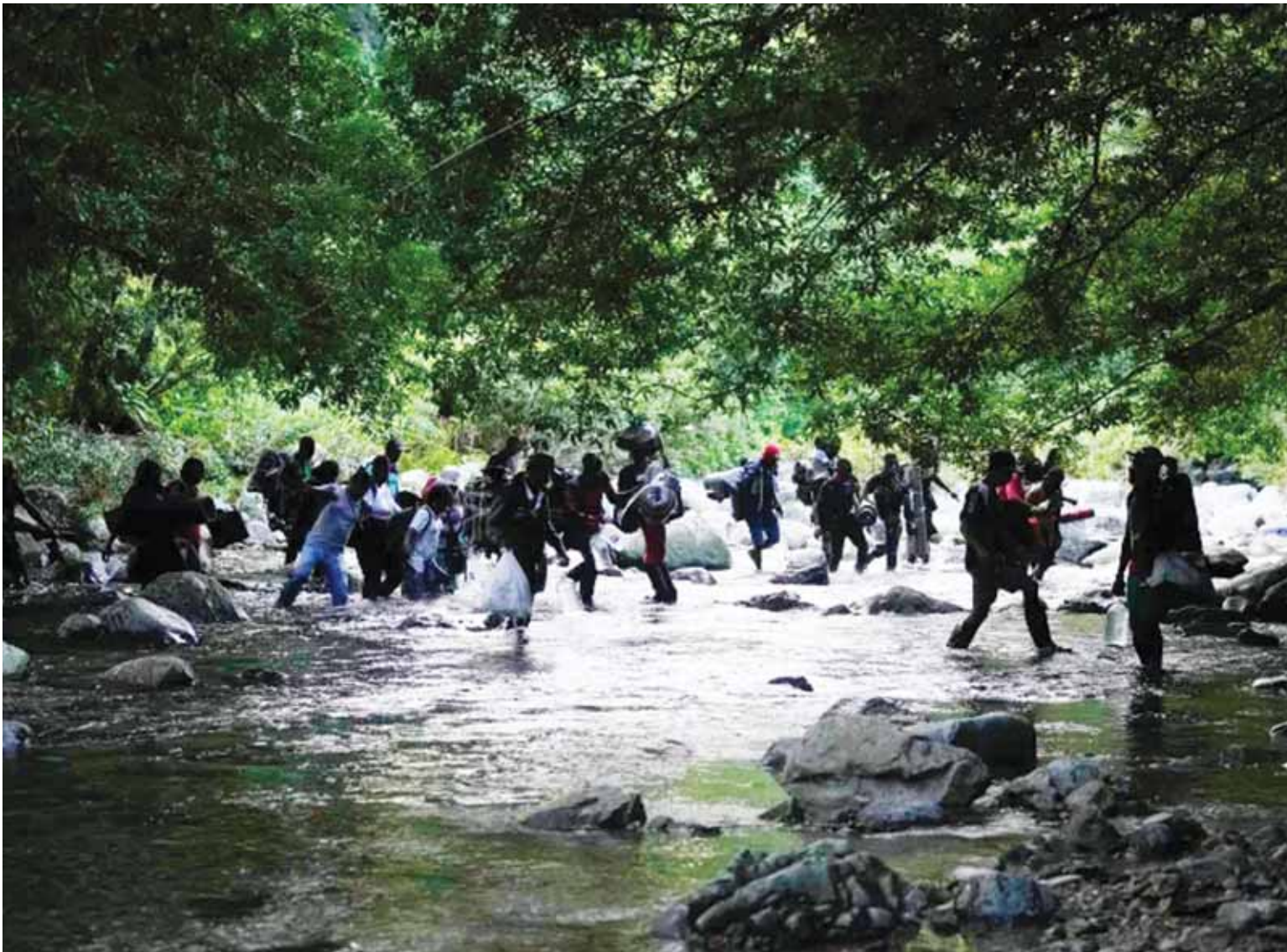
Emigrants cross a stream in Darien Gap to reach the US

Hence, the news of only a few who die in the track is coming to light. Second, this