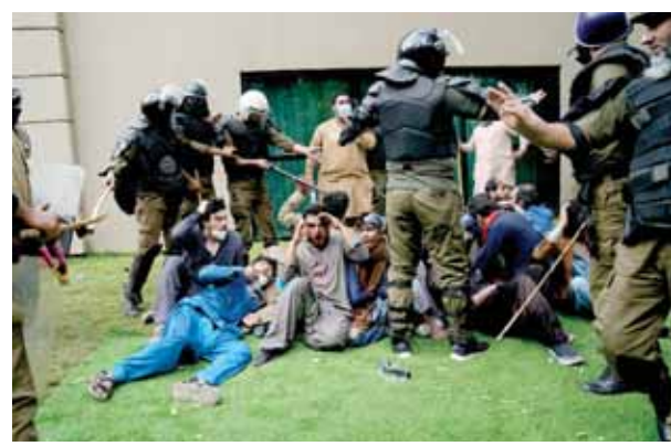
Police detain supporters of former Prime Minister Imran Khan during a search operation in the Khan's resident, in Lahore on Saturday