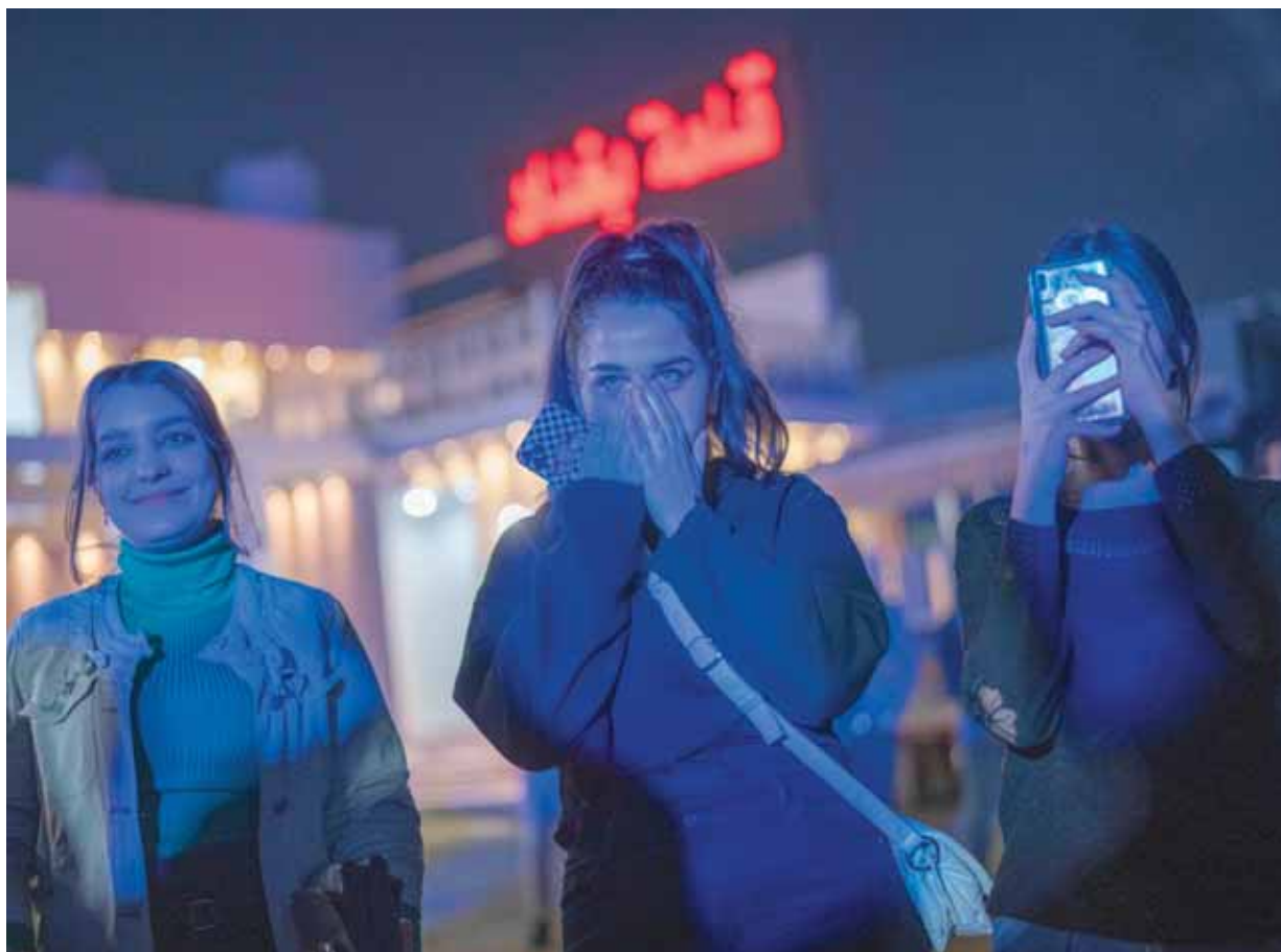
Youths gather along the Tigris River for a concert by rap artist OG Khalifa in Baghdad on February 25, 2023. One of the songs he performs mocks 'sheikhs', those who wield power in the new Iraq through wealth or political connections

In 2019-20, young people protested against corruption and lack of services. After 600 were killed by government forces and militias, parliament