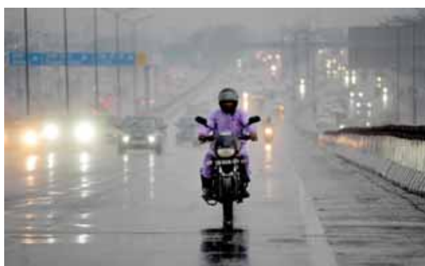
A man rides his bike on a road near Akshardham amid rainfall, in New Delhi, on Saturday

Hail may injure people and cattle in open places, strong