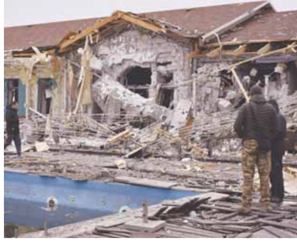
People inspect a damaged restaurant after Russian shelling hit in Zaporizhzhia, Ukraine on Saturday