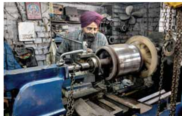
The packaging industry is growing at 15-17 per cent and the sector has the potential to create employment opportunities in the country, industry experts said in New Delhi

The event was organised by the Indian Institute of Packaging (IIP), an autonomous body under the Union Ministry of Commerce and Industry, a release said. The packaging business in the world is worth USD 79 billion