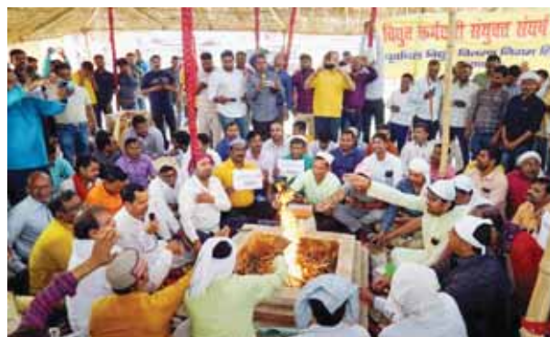
PNS ■ LUCKNOW