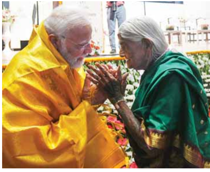
Prime Minister Narendra Modi being presented a shawl by an elderly farmer during the 'Global Millets Conference' in Pusa, in New Delhi, on Saturday (Report on Page 4)

His remarks come amid a political slugfest over Gandhi's