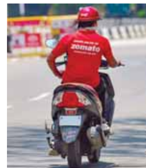
The critical being the delivery boys-girls who serve as the 'last-mile' link between the food outlets and the hungry customer.

Once the App accepts the order, a series of precision processes are triggered right from inside the kitchens to the delivery boys/girls who pick it up, and finally ring your doorbell - all within 30-60 minutes - for that joyous, drooling smile...! Simple as it may sound, the delivery business is actually bizarre and complex, involving a lot of human elements,