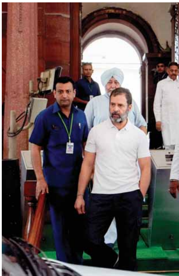
Congress leader Rahul Gandhi leaves Parliament House complex in New Delhi on Friday

Secretariat in a notification said following his conviction by the court of Chief Judicial Magistrate, Surat, Rahul, Member of the Lok Sabha representing the Wayanad constituency of Kerala stands disqualified from the membership of the House from the date of his conviction i.e. March 23, 2023. The Congress said it will fight the matter politically and legally. Hitting out at the Government, the Congress said it is "a black day for Indian democracy" and alleged that the action was driven by "political vendetta". Hours before the notification was issued, Rahul attended the Lok Sabha proceedings in the morning session. Before the proceedings commenced, he also participated in a meeting of party MPs in Parliament complex. Rahul said he is fighting for the voice of India and is ready to pay any price, hours after he was disqualified from the Lok Sabha. Later, Rahul tweeted, "I am fighting for the voice of