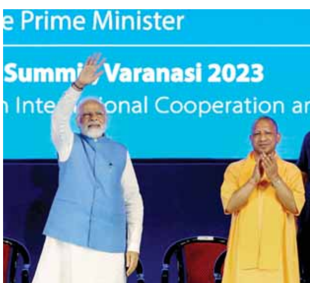
Prime Minister Narendra Modi at the 'One World TB Summit' at Rudraksh Convention Centre, in Varanasi, on Friday. Uttar Pradesh Chief Minister Yogi Adityanath is also seen

ing a public meeting after laying the foundation stone of nine projects and inaugurating 19 development projects. The ropeway will covering the distance between Varanasi Cantt Railway station and Kashi Vishwanath Dham in a few minutes. The ropeway system will have five stations and facilitate the ease of movement for tourists, pilgrims and residents. The Prime Minister praised the the Yogi Adityanath Government for turning Uttar Pradesh from hopelessness towards a state of hope and aspiration "Uttar Pradesh is rising from hopelessness and moving towards hope and aspirations. Where security and