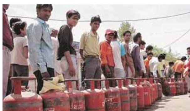
national prices of LPG due to various geopolitical reasons and it is important to shield PMUY beneficiaries from high LPG prices.

As of March 1, 2023, there were 9.59 crore PMUY beneficiaries. Further, the minister said the total expenditure will be ₹6,100 crore for the financial year 2022-23 and ₹7,680 crore for 2023-24. The subsidy is credited directly to the bank accounts of the eligible beneficiaries. Thakur said there has been a sharp increase in inter-