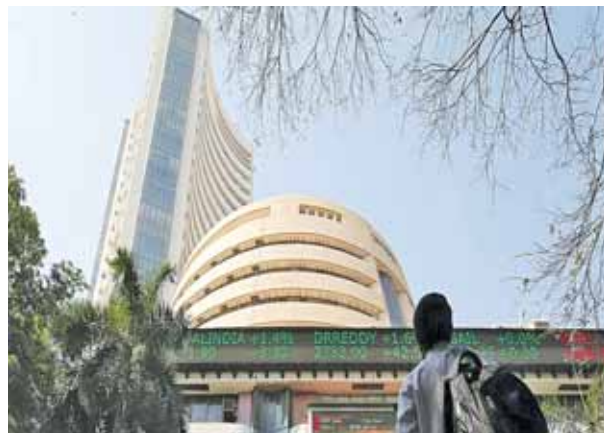
Tech, SBI, Larsen & Toubro and Mahindra & Mahindra, Axis Bank and Titan.

Bajaj Finserv was the biggest loser among the Sensex constituents, sliding 3.81 per cent, followed by Bajaj Finance, Tata Steel, Reliance Industries, HCL