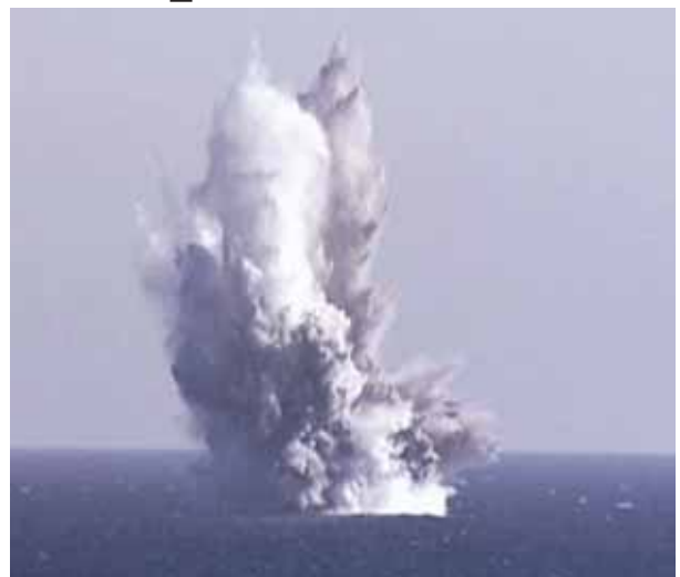
This photo provided by the North Korean government, shows what it says is an underwater blast of test warhead loaded to an unmanned underwater nuclear attack craft "Haeil" during an exercise around Hongwon Bay in waters off North Korea's eastern coast Thursday, AP/PTI

KCNA said the North's latest tests were aimed at alerting the United States and South Korea of a brewing "nuclear crisis" as they continue with their "intentional, persistent and provocative war drills." It said