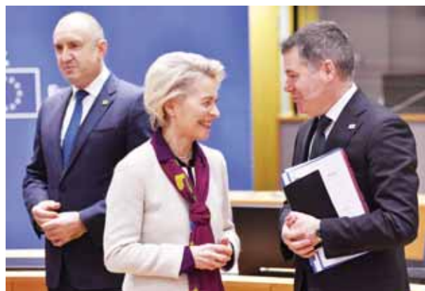
European Commission President Ursula von der Leyen, center, speaks with President of the Eurogroup Paschal Donohoe during a round table meeting at an EU summit in Brussels on Friday.

European Union leaders gathered Friday to gauge the risk of a banking crisis developing from recent global financial turbulence and hitting the economy even harder than the energy crunch tied to Russia's war in Ukraine. The deliberations by EU government heads in Brussels follow US regulators shutting down two US banks, including Silicon Valley Bank, and a Swiss-orchestrated takeover of troubled lender Credit Suisse by rival UBS. The emergency actions on both sides of the Atlantic revived memories of the 2008 global financial meltdown and the ensuing EU sovereign debt crisis, which almost broke apart the euro currency now shared by 20 European countries. "For the moment, we see no reason to be worried," Belgian Prime Minister Alexander De Croo told reporters on his way to the EU meeting. "But we monitor it really closely, almost on a daily basis, because no one knows what can happen." The European economy has been