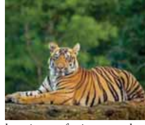
Last picture of a tiger was taken in the eastern highlands of Cambodia in 2007. The country is now committed to have the tigers, which is included in the IUCN Red List of Endangered Species, back to its forests.

He said hence it is too early to talk about the numbers of big cats proposed to be shifted to Cambodia. No tiger has been spotted in Cambodian forests for the last 15 years. The