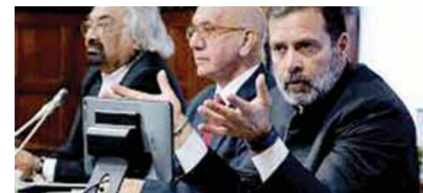
PIONEER NEWS SERVICE ■ NEW DELHI/UNITED NATIONS

A verdict sentencing Congress leader Rahul Gandhi to jail for two years echoed in the United Nations (UN) and it said the international body was aware of it.