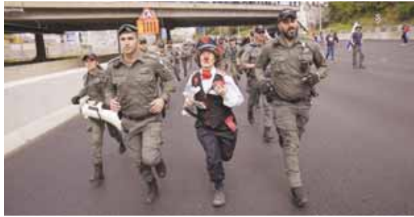
An Israeli activist dressed as a clown runs with border police as Israelis protest against plans by Netanyahu in Tel Aviv, Israel on Thursday.

Jerusalem (AP): Israel's attorney general on Friday warned Prime Minister Benjamin Netanyahu that he has violated the Supreme Court's conflict of interest ruling, which barred him from direct involvement in his government's divisive plans for a judicial overhaul. Netanyahu's far-right government has barreled ahead with plans to weaken the Supreme Court and grant politicians less judicial oversight in their policymaking despite massive protests from across Israeli society — including an uproar among business leaders, top legal officials and military reservists. On Thursday, just hours after his coalition passed a law that would protect the Israeli leader from being