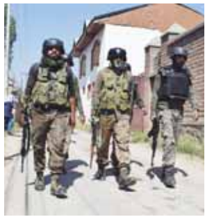
Area has been brought under the ambit of the AFSPA through the fresh notification.

The home ministry said the central government in exercise of the powers conferred by Section 3 of the AFSPA 1958 (28 of 1958) had declared the Tirap, Changlang and Longding districts in Arunachal Pradesh and the areas falling within the jurisdiction of Namsai, Mahadevpur and Chowkham police stations in Namsai district of Arunachal Pradesh, bordering the state of Assam as 'disturbed area' under Section 3 of the Armed Forces (Special Powers) Act, 1958 for a period of six months with effect from April 1, 2023, unless withdrawn earlier," one of the notifications said.