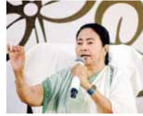
West Bengal Chief Minister Mamata Banerjee speaks during a meeting, in Kolkata, on Friday

While Bengal Opposition parties—save the BJP—would not exhibit much of enthusiasm over Banerjee's statement saying she was more concerned about the rising popularity of "Under PM Modi's New India, Opposition leaders have become the prime target of BJP," Banerjee who is also the president of Trinamool Congress wrote in her Twitter post. Condemning the kind of treatment meted out to the Congress leader she said