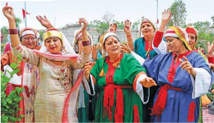
Women in traditional dresses celebrate Zangri as part of three-day Navreh (Kashmiri New Year) festival