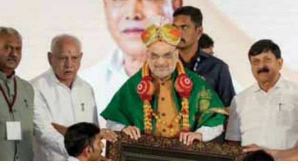
Union Home Minister Amit Shah during the foundation laying ceremony of Sahakar Samridhhi Southa and the inauguration of various development works of the Department of Cooperation (Karnataka), in Bengaluru, on Friday

"Congress party is degenerating across the country, the Congress people don't have any state with them that can fill Congress' central treasury, they want an ATM.... They want Karnataka to become Congress' ATM, and corrupt Congress' eyes are now set on Karnataka," Shah said. Addressing a beneficiaries' meet organised by Karnataka Cooperative department and other departments, he asked people whether they will form a BJP government under Prime Minister Narendra Modi's leadership in Karnataka or a Congress government with Rahul Gandhi at helm. "Wherever Congress has formed government, their history is corruption, humiliation of Dalits, OBCs and Adivasis, and strengthening anti-national forces," he alleged. Bommai, veteran BJP leader B S