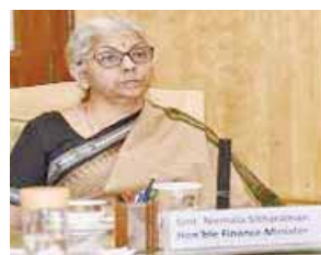
Finance Minister Nirmala Sitharaman

Samba (Jammu): A person was killed and four others were injured in a blast that took place in a scrap factory in Jammu & Kashmir’s Samba district on Saturday, official sources said. The factory was located in the Baribrahmana area, they said. Those injured have been hospitalised.