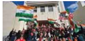
India's unity against Khalistan movement.

Regretting the violence, many Indian-American community members attended the support march outside its consulate in San Francisco for