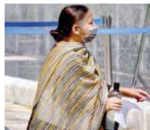
RJD leader Misa Bharti arrives at the ED office for questioning in connection with the land-for-jobs case, in New Delhi on Saturday

During the two hours meeting with MDs and CEOs of PSBs, an open discussion was held on the global scenario amid the failure of the Silicon Valley Bank (SVB) and Signature Bank (SB), along with the issues leading to the