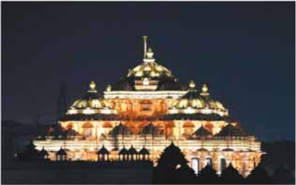
A combination of pictures shows the Akshardham Temple during Earth Hour and before observing the Earth Hour in New Delhi on Saturday