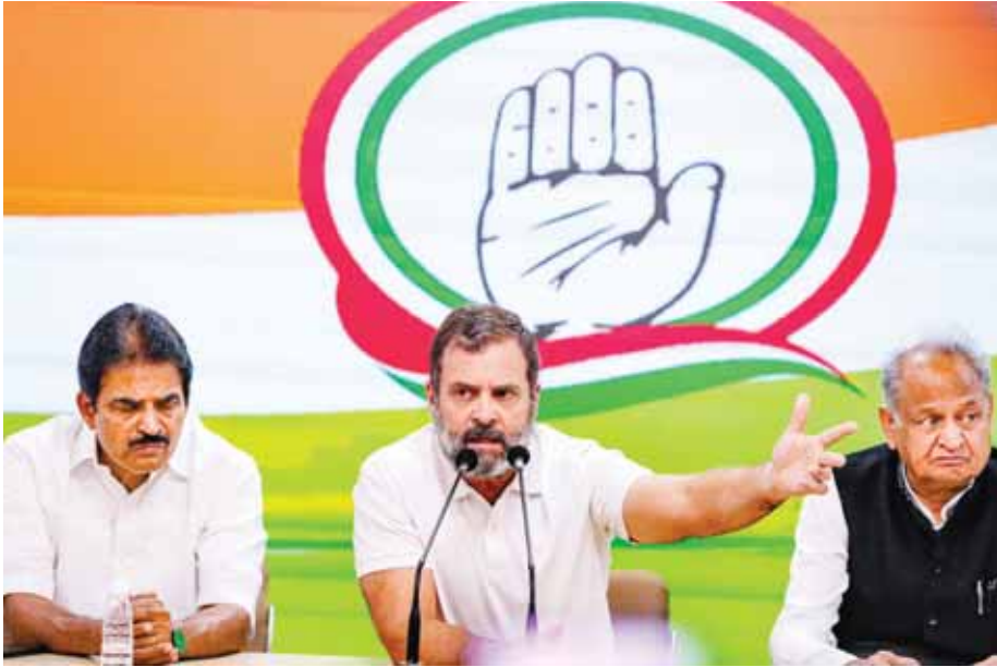
Congress leader Rahul Gandhi addresses a press conference at the AICC headquarters in New Delhi on Saturday

“I am here defending the democratic voice of the Indian people, I will continue to do that. I am not scared of these threats, of these disqualifications, allegations, prison sentences. I am not scared of them. These people don’t