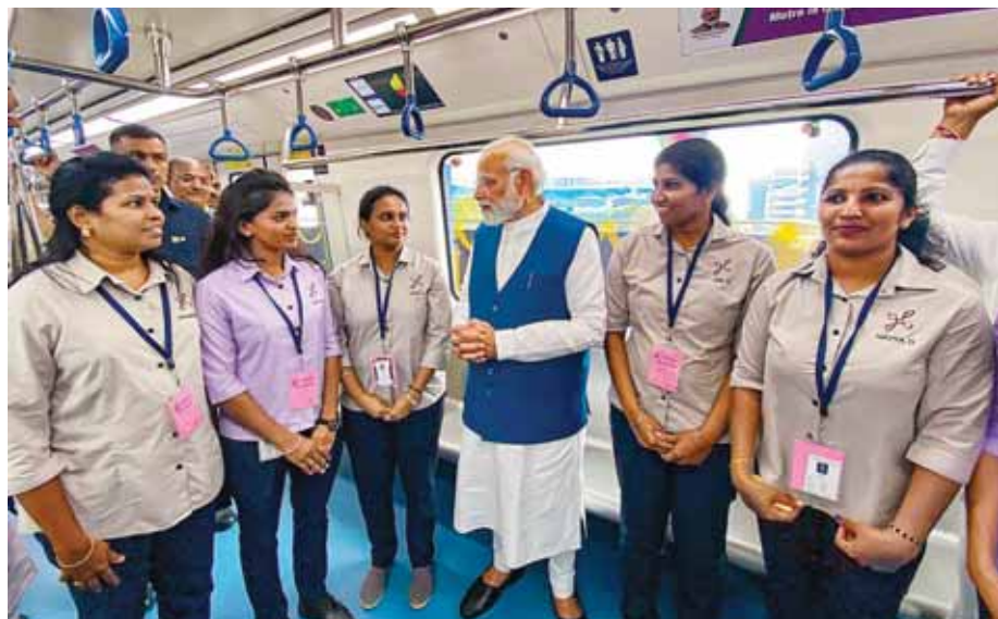
Prime Minister Narendra Modi takes metro ride in Bengaluru on Saturday

Slamming the BJP over the questioning of the two RJD leaders, Congress general secretary Priyanka Gandhi Vadra alleged the ruling party wants to finish off the