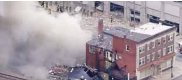
Smoke rises from an explosion at the RM Palmer Co. plant in West Reading

The rural towns of Silver City and Rolling Fork reported destruction as the tornado swept northeast at 70 mph (113 kph) without weakening, racing towards Alabama through towns including Winona and Amory into the night.