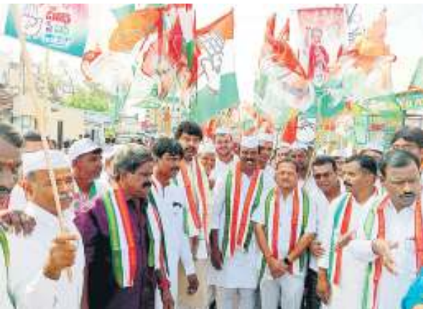
Mahabubnagar District Congress Committee leaders on Hath-se-Hath Jodo yatra in Mahabubnagar town on Saturday