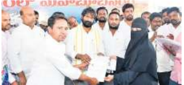
Minister for Excise V Srinivas Goud distributing CMRF cheques to beneficiaries

super speciality hospital which is under construction at the site of the old collectorate at a whopping cost of Rs 500 crore offers modern treatment facilities like cancer screening and heart transplantation. The