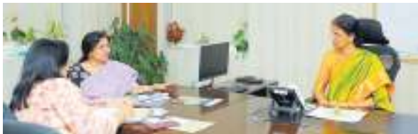
Minister for Education Sabitha Indra Reddy reviewing arrangements of SSC examinations with officials in Hyderabad on Saturday

The Minister stated that 4,94,600 have registered for examinations across the State and 2,652 examination centres have been set up. She said that