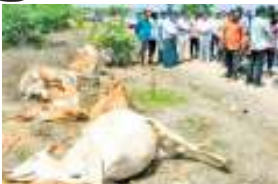
Carcasses of cows died in a road accident in Nalgonda district on Tuesday

The bus was on its way to Hyderabad from Chennai when it crashed into a herd of