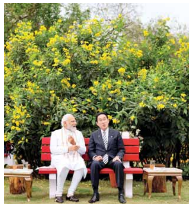
Prime Minister Narendra Modi and Japanese PM Fumio Kishida at Buddha Jayanti Park in New Delhi on Monday

The visit came amid the ongoing Ukraine conflict and its adverse impact on the global supply chains of energy and food. The visit also came in the backdrop of China's growing assertiveness in the strategically-crucial Indo-