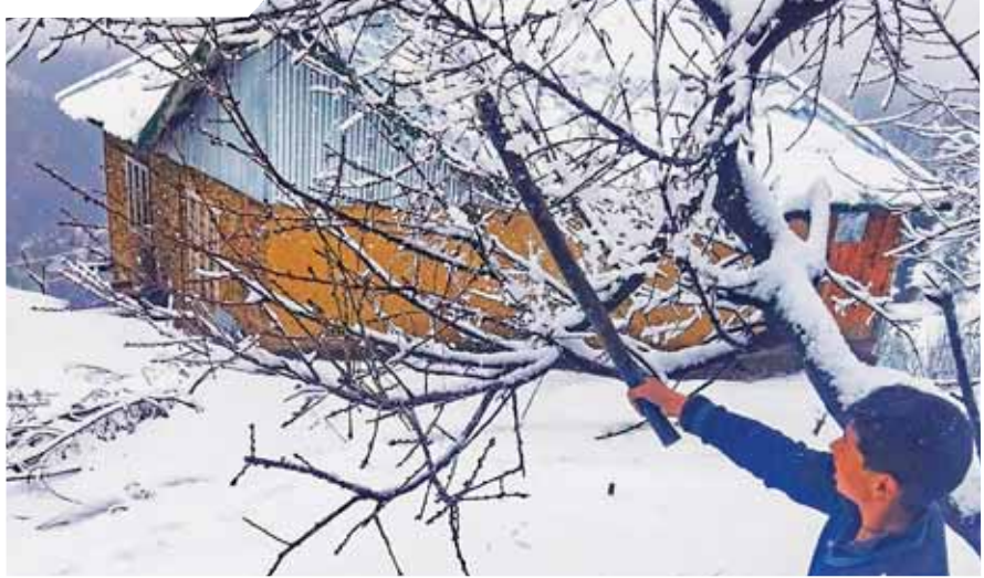
A boy plays with snow on a tree in Doda district of Jammu and Kashmir