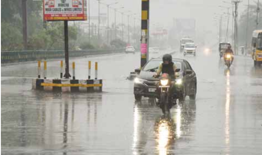
Commuters braving a strong spell of showers in Lucknow on Monday

CISH generally does not recommend the use of fungicides during fruit development stages but under the present and predicted weather situa-