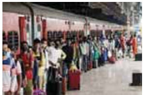
PIONEER NEWS SERVICE ■ NEW DELHI/PATNA

A day after TV screens installed at platform number 10 at Patna railway station played a porn clip, the Railways on Monday said it has cancelled the contract of the agency responsible for relaying advertisements on the screens.