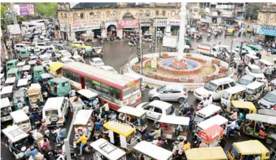
Commuters stuck in a massive traffic jam at Kaiserbagh crossing in Lucknow on

with the thrashing of a TTE in Archana Express on March 14 while citing a few incidents of showdown between the TTEs and cops. The DGP said the state government provided traveling allowances to cops going for government work and it was the responsibility of the cops to behave in a dignified way. “The policemen should not act in a way which dented the image of police,” he concluded.