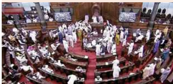
PIONEER NEWS SERVICE ■ NEW DELHI

Several opposition parties on Monday accused the government of stalling Parliament and finding ways to divert attention from the opposition demand for a Joint Parliamentary Committee probe (JPC) into the Adani issue.