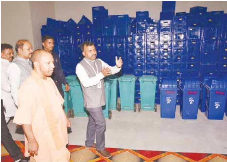
CM Yogi Adityanath inspecting Integrated Pack House in Varanasi recently. (File Photo)

The pack house is built in 4,461 square feet at a cost of Rs 15.78 crore. Just a few days ago, the CM inspected this Integrated Pack House. The consignment of vegetables and fruits of Purvanchal will now be directly exported to foreign countries from the pack house of Varanasi. Perishable food products will be prepared according to international standards. The Integrated Pack House for food and vegetable