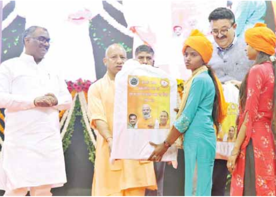
Chief Minister Yogi Adityanath giving away sports kits at a function on Monday