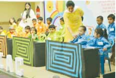
'Brainiac, the Quiz' activity was organised at the SPSEC school premises for play group students

Quiz enhances general knowledge and thinking power and provides an interactive platform for children. It gives them opportunities to excel beyond academics and helps them to imbibe the practice of innovative learning. To encourage and enlighten curious minds,