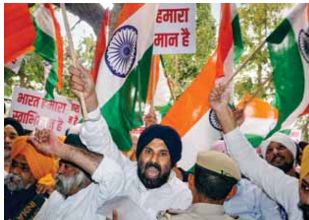
People from Sikh Community protest against vandalisation by Khalistani supporters at Indian High Commission in London, in New Delhi on Monday

"There was no report of any injury, however windows were broken at the High Commission building," the Metropolitan Police statement said. British Labour MP Tanmanjeet Singh Dhesi's tweet, expressing concern over the ongoing action to arrest Amritpal Singh and arrest of some alleged Khalistani elements, has received condemnation. Dhesi, an MP from Slough, tweeted, "Very worrying reports coming from #India, of the imposition of an internet blackout in the #Punjab state, with mass arrests and restrictions on gatherings. Praying that the tense situation is soon resolved and that human rights of all are