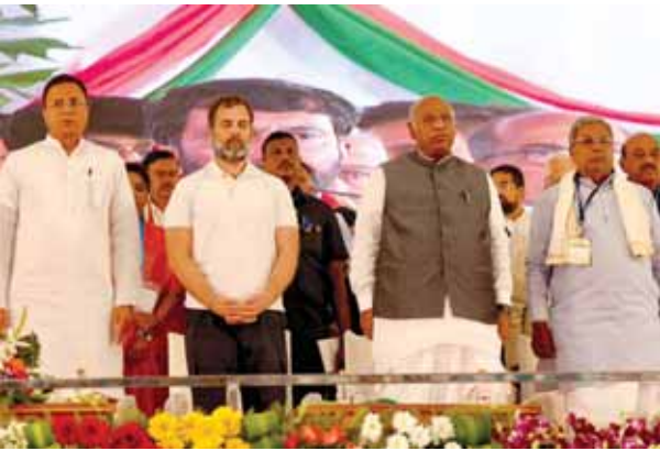
Congress president Mallikarjun Kharge with party leader Rahul Gandhi and others during the ‘Yuva Kranti Samavesh’, in Belagavi, on Monday

Addressing a public rally at Belagavi in northern Karnataka, Gandhi hit out at the BJP-led Central government, saying “this country belongs to everyone, does not belong to two to three selected, it is not Adani’s”. “Select people, who are BJP’s friends, are getting all the benefits. It is