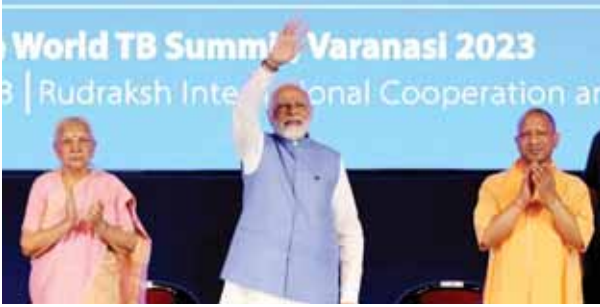
global model for ending TB..." he said.

Under 'TB Mukta Panchayat Abhiyan' members of the local bodies are sensitised and trained about the disease, with them aiding the government's implementation of the programme and achieving TB free status while the nation-wide rollout of a 3-month preventive treatment for those at risk of developing TB aims to reduce the course of treatment from the previous six months and replace the daily pills with a once-a-week medicine regimen.