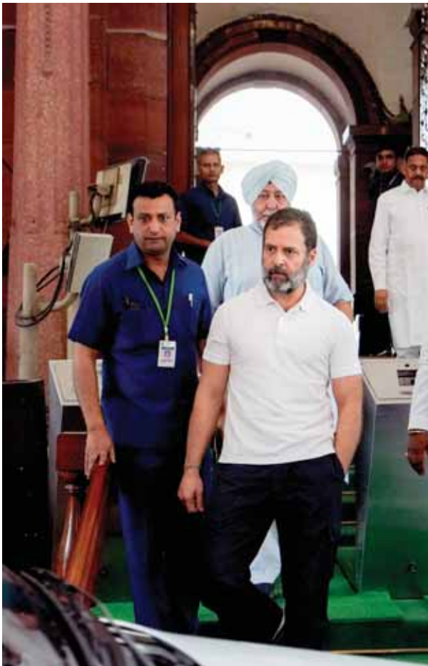
Congress leader Rahul Gandhi leaves Parliament House complex in New Delhi on Friday

Later, Rahul tweeted, "I am fighting for the voice of