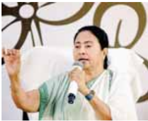
West Bengal Chief Minister Mamata Banerjee speaks during a meeting, in Kolkata, on Friday

While Bengal Opposition parties—save the BJP—would not exhibit much of enthusiasm over Banerjee’s statement saying she was more concerned about the rising popularity of “Under PM Modi’s New India, Opposition leaders have become the prime target of BJP”, Banerjee who is also the president of Trinamool Congress wrote in her Twitter post. Condemning the kind of treatment meted out to the Congress leader she said