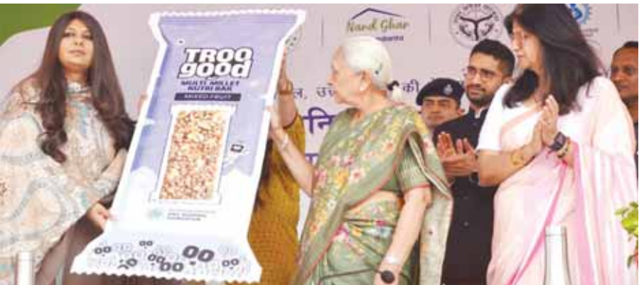
Governor Anandiben Patel launching a nutritional programme in Varanasi on Thursday.