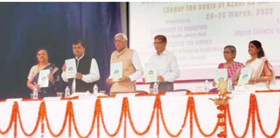
Guests releasing souvenir of the national seminar being organised by Education Department of VCW.