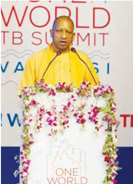
CM Yogi Adityanath addressing the One World TB Summit at Rudraksh, Varanasi on Friday.