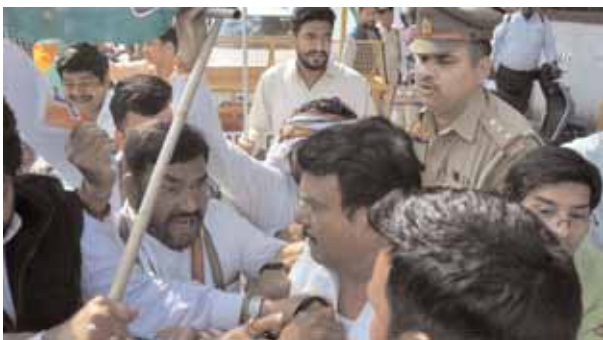
UP Congress leaders and workers protesting in Lucknow on Friday against disqualification of former party president Rahul Gandhi from Parliament