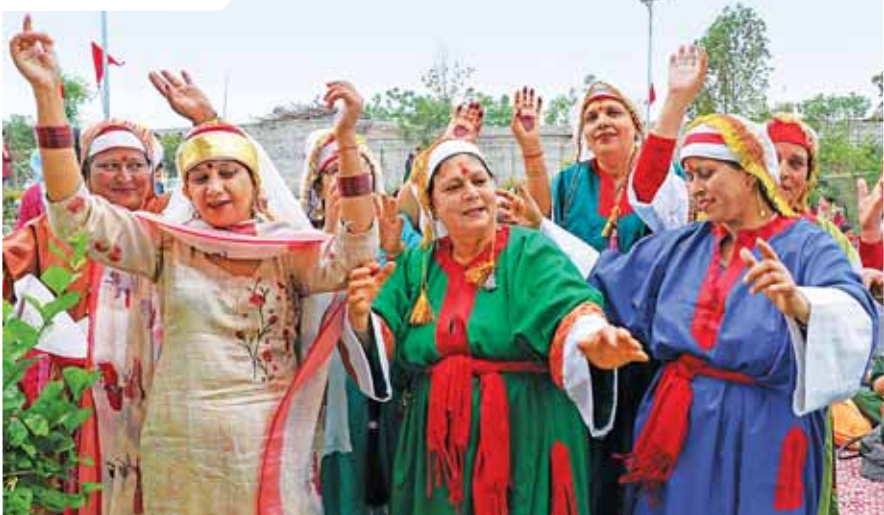
Women in traditional dresses celebrate Zangtri as part of three-day Navreh (Kashmiri New Year) festival