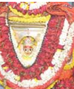
Devotees offered prayers at Chandraghanta Devi on the third day of Vasantik Navratri in Varanasi on Friday.

Hundreds of devotees thronged Saubhagya Gauri temple at Satyanarayan temple near Gyanvapi mosque on the third day of Vasantik Navratri here on Friday. Besides, a rush of devotees was also seen at Chandraghanta Devi temple in Chowk. Besides, a rush of devotees was seen at Durga Mandir (Durgakund) as usual. As per tradition, the rush should be at Saubhagya Gauri temple but