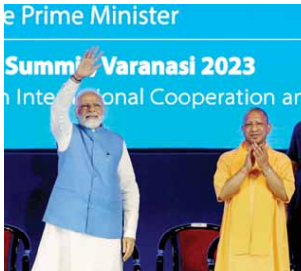
Prime Minister Narendra Modi at the 'One World TB Summit' at Rudraksh Convention Centre, in Varanasi, on Friday. Uttar Pradesh Chief Minister Yogi Adityanath is also seen

'UP rising from hopelessness and moving towards hope, aspirations'