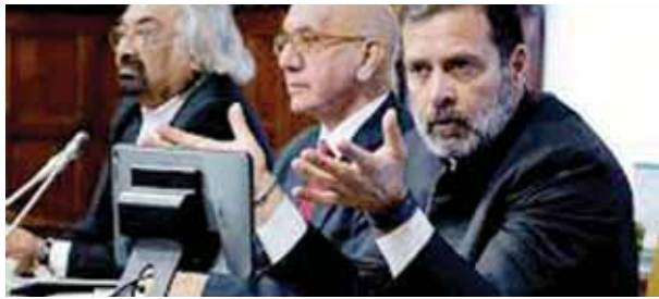
PIONEER NEWS SERVICE ■ NEW DELHI/UNITED NATIONS

A verdict sentencing Congress leader Rahul Gandhi to jail for two years echoed in the United Nations (UN) and it said the international body was aware of it.