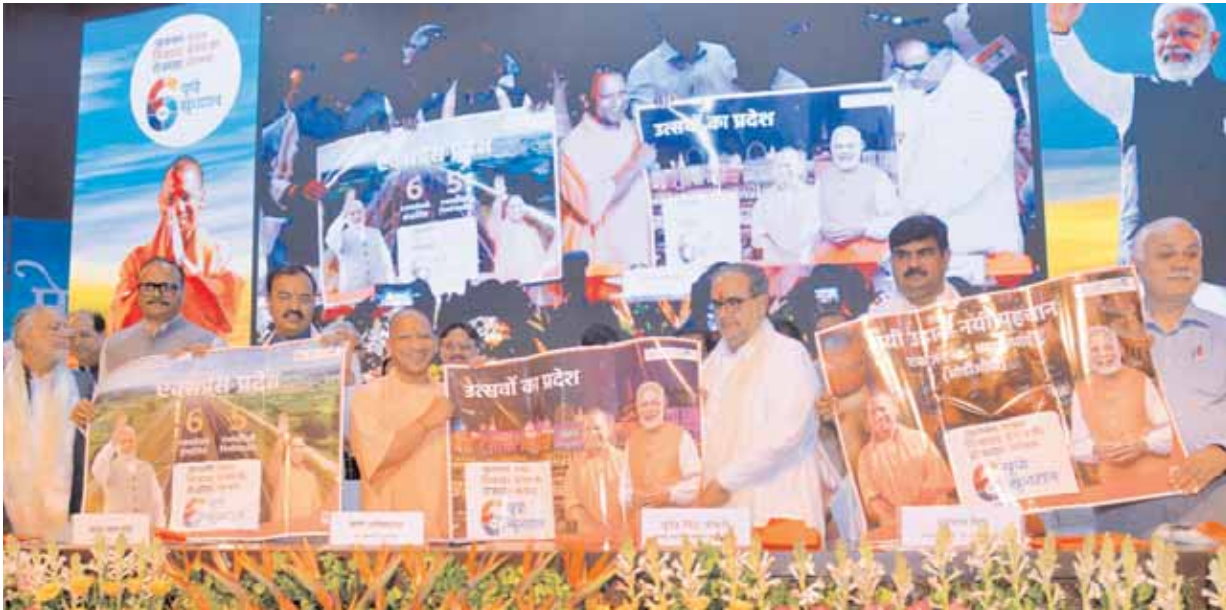
Chief minister Yogi Adityanath unveils a poster in Lucknow on Saturday

The chief minister said that out of six years, the government worked while fighting against the COVID-19 pandemic for three years. “UP, which was known as a BIMARU state that cannot develop, today is in the race for number one position in implementation of all the flagship schemes of the prime minister. The infrastructure of UP is