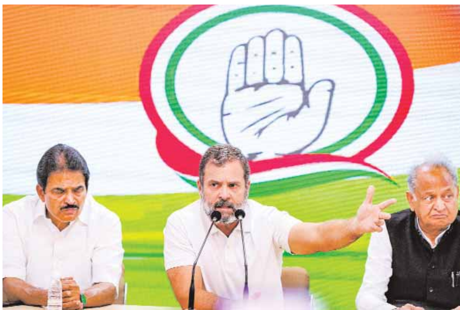
Congress leader Rahul Gandhi addresses a press conference at the AICC headquarters in New Delhi on Saturday

“I am here defending the democratic voice of the Indian people, I will continue to do that. I am not scared of these