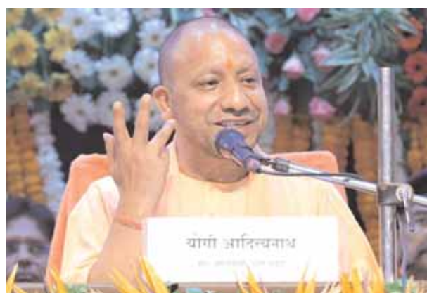
Chief Minister Yogi Adityanath addressing media persons on completing six years in office in Lucknow on Saturday

“UP has the most extensive metro service in the country.