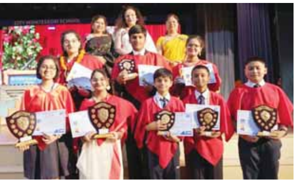
Meritorious students honoured at the Divine Education Conference of CMS, Kanpur Road campus, on Saturday