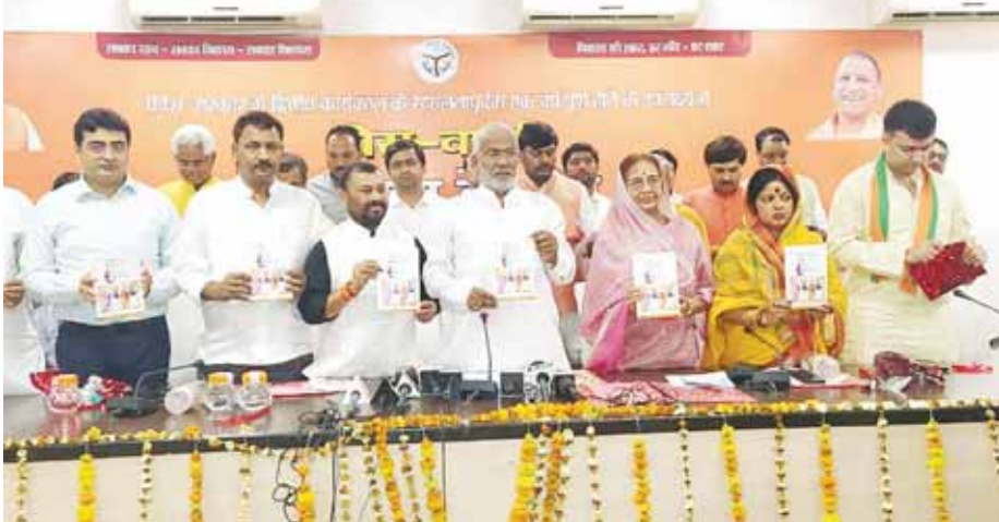
Uttar Pradesh Cabinet Minister Swatantra Dev Singh releasing a book of completion on six years of Yogi government in Prayagraj

Swatantra Dev Singh said that in the previous governments, people did not want to leave their houses as soon as it was evening. There was an atmosphere of fear. Women were also not safe. Today, ever since the BJP government has