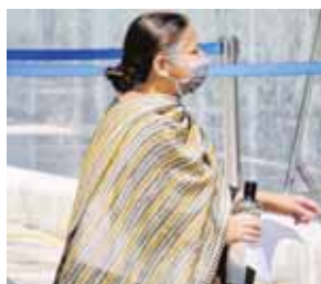
RJD leader Misa Bharti arrives at the ED office for questioning in connection with the land-for-jobs case, in New Delhi on Saturday