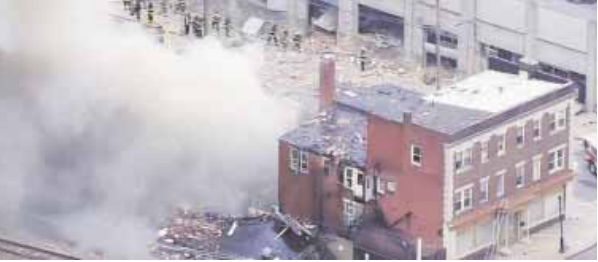
Smoke rises from an explosion at the RM Palmer Co. plant in West Reading

WEST READING: An explosion at a chocolate factory in Pennsylvania on Friday killed five people and left six people missing, authorities said.