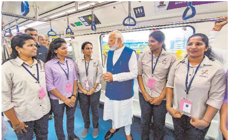
Prime Minister Narendra Modi takes metro ride in Bengaluru on Saturday