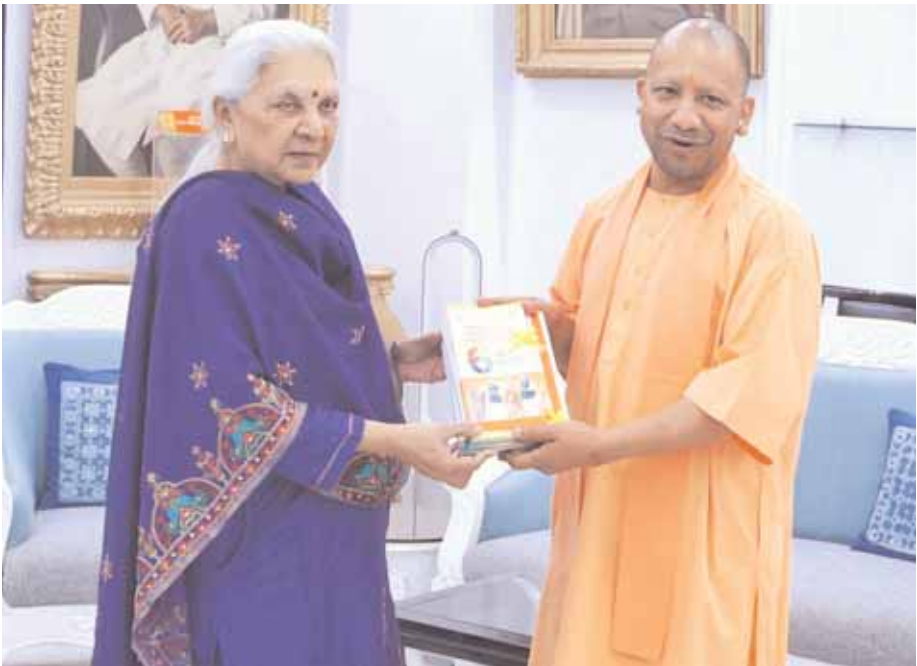
Chief Minister Yogi Adityanath paid a courtesy call to Governor Anandiben Patel at Raj Bhawan on Saturday

He said that 269 houses under the CM housing schemes have been completed and 14,562 houses in rural areas completed under Prime Minister Awas Scheme. "Irrigation facilities have been provided through 163 canals and 19,535 residences completed under the urban housing scheme," he added.