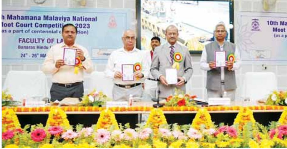
SC judge Justice Rajesh Bindal at a function in BHU, Varanasi on Sunday.

Justice Bindal highlighted the glory of BHU and said that the motto of the Law School, BHU ‘Dharmo Vishwasya Jagatah Pratistha’ is a very encouraging one. He pointed out that nowadays society is moving towards the right oriented society whereas the motto of the Law School is reflecting the duty. Where there is duty oriented society, there