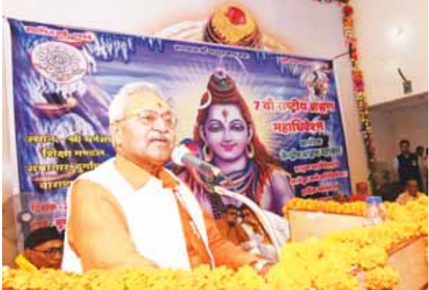
Rajya Sabha MP Laxmikant Bajpai addressing Kendriya Brahmin Mahasabha conference in Varanasi on Sunday.

“Traditionally, it is believed that the Vedas are impersonal and eternal, but rather the manifestation of eternal truth whose validity is eternal. Vedas are considered to be Shruti. In ancient times, a person of