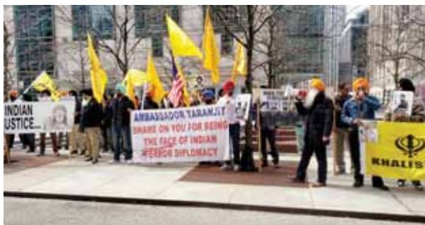
Khalistan supporters protest outside Indian Embassy in Washington

Indian scribe assaulted by Khalistani protesters in US