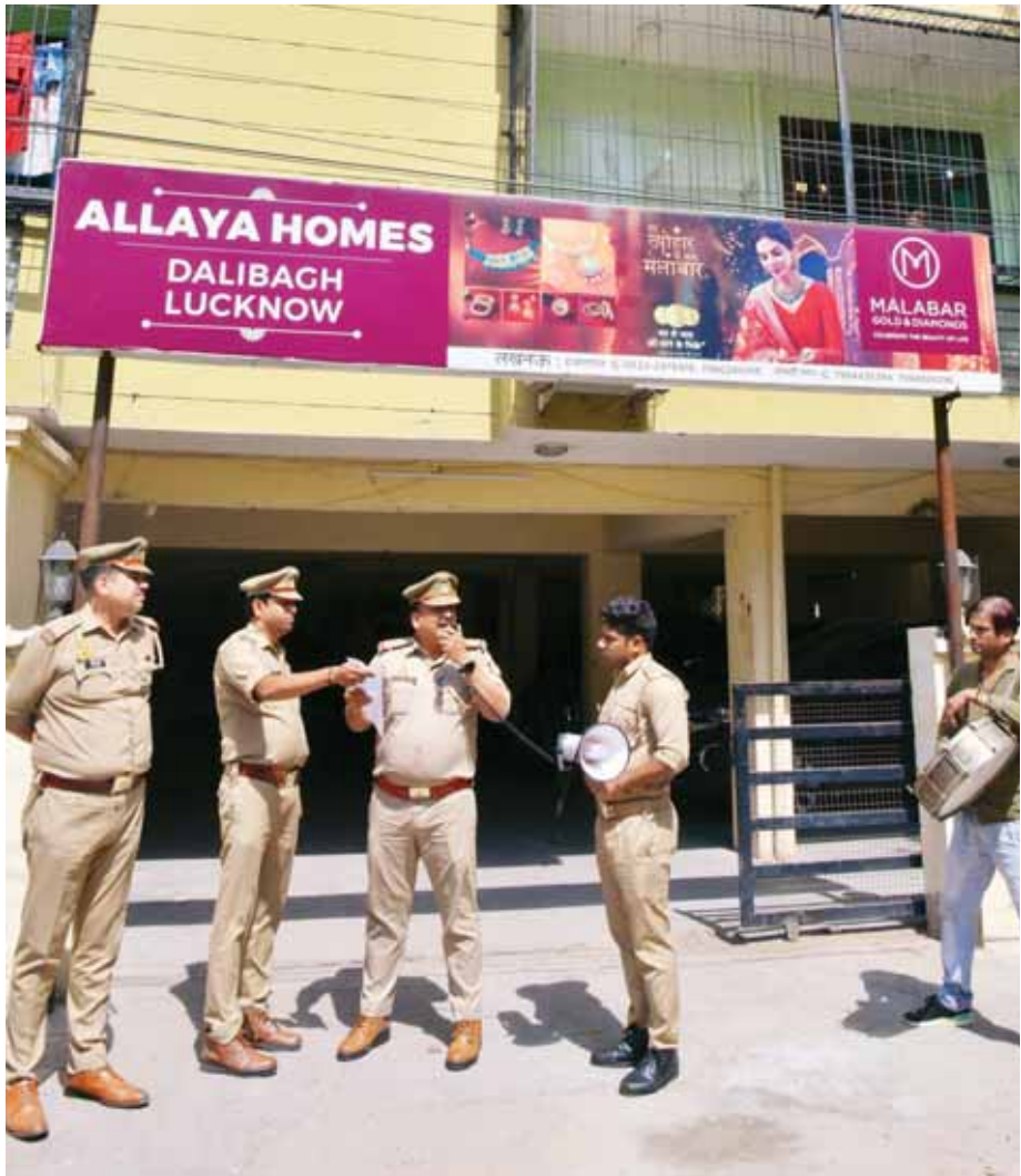
The anti-encroachment squad of Lucknow Development Authority sealed the Allaya Apartment building in Dalibagh due to violation of the blueprint. The 7-storeyed semi-finished housing complex was sealed by the LDA squad, accompanied by armed police.