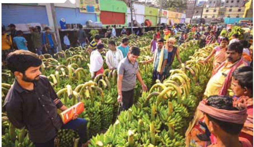
People buy bananas for 'Chaiti Chhath' festival, in Patna.