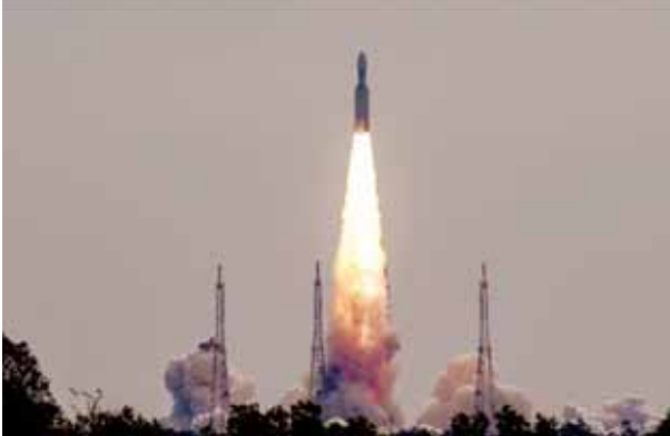
ISRO's LVM3 carrying 36 satellites lifts off from the Satish Dhawan Space Station, in Sriharikota, on Sunday. The 36 satellites were part of the agreement with NewSpace India Ltd, the commercial arm of ISRO and Network Access Associates Ltd, United Kingdom

The first batch of 36 satellites of OneWeb Group company were launched on October 23, 2022 by ISRO. OneWeb is a global communication network powered from space, enabling connectivity