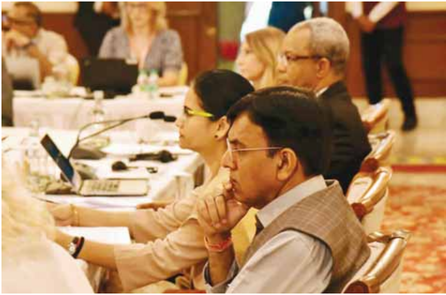
Union Health Minister Dr Mansukh Mandaviya addressing Stop TB Partnership Board meeting in Varanasi on Saturday.

The Union Health Minister emphasised that effort is on not only to rebound from Covid but also bring innovative strategies like the Pradhan Mantri TB Mukti Bharat Abhiyaan