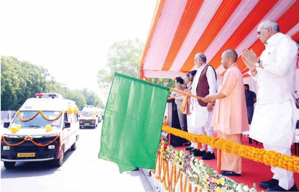
Chief Minister Yogi Adityanath flagging off 520 mobile veterinary units in Lucknow on Sunday

He went on to say that his government is running three types of schemes for cattle protection. "Under the first