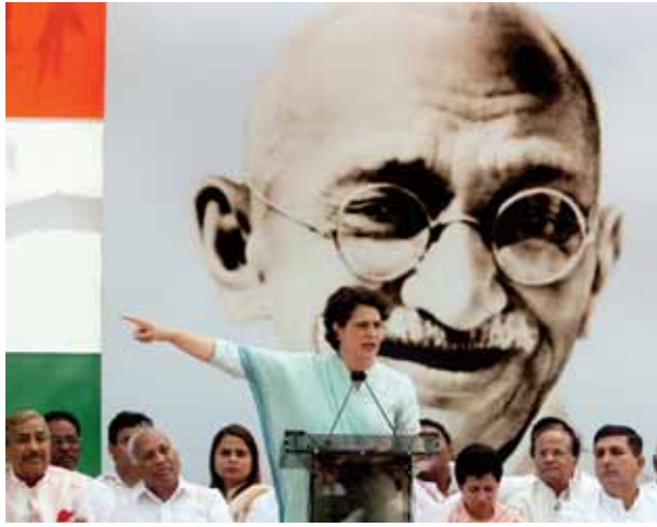
Congress leader Priyanka Gandhi speaks during the party's 'Satyagraha' against disqualification of Congress leader Rahul Gandhi from the Lok Sabha, at Rajghat in New Delhi on Sunday

The police in Gujarat detained several party functionaries for holding the stir.