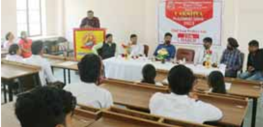
Placement drive Lakshya organised at BECDC, Mandhana.