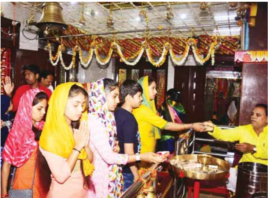
Devotees throng a temple in Shastri Nagar on the occasion of Navratri on Sunday