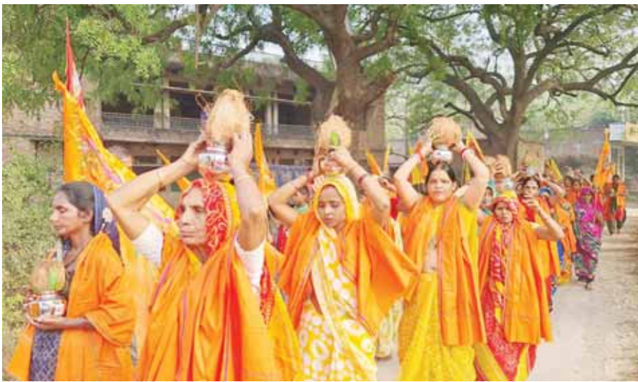
Women taking out Ram Dhvaj Yatra on the occasion of Ram Navami in Varanasi on Thursday.

Besides, the festival was celebrated with great pomp at Shri Ram Janaki temple and