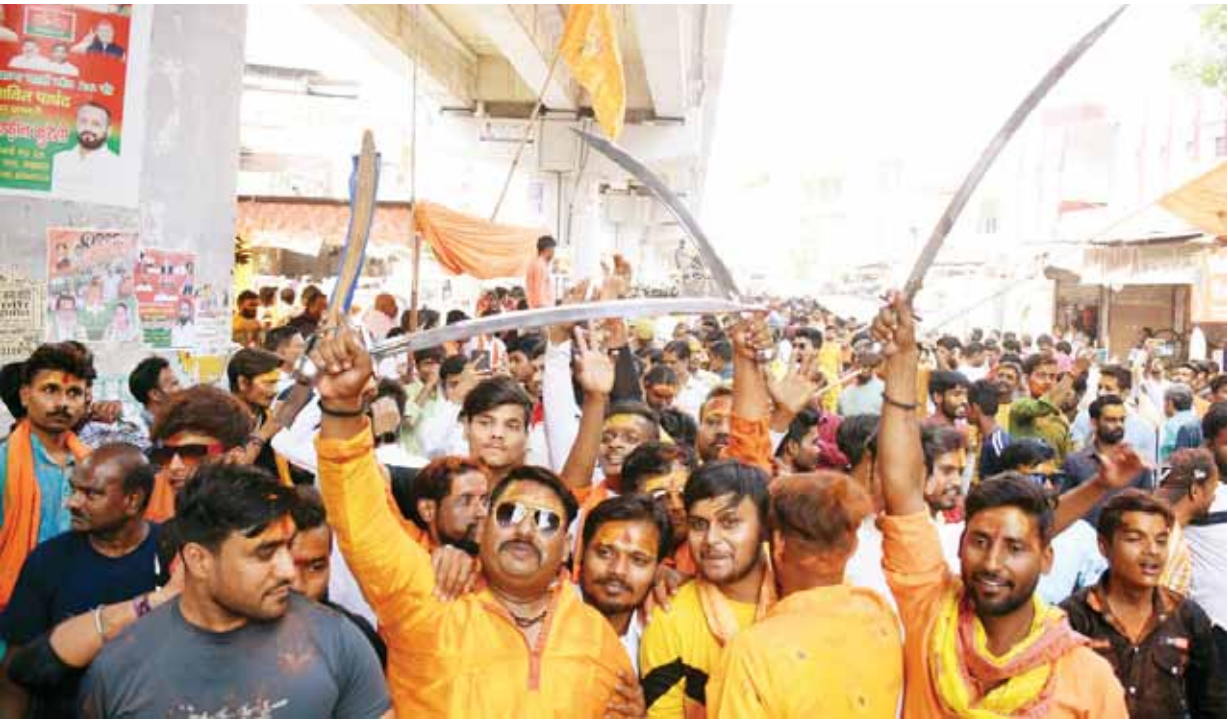
Devotees taking part in a procession taken out from Ashrafabad area in old city on Thursday

The procession passed through Lekhraj Market, Faizabad Road, Maruti Puram,