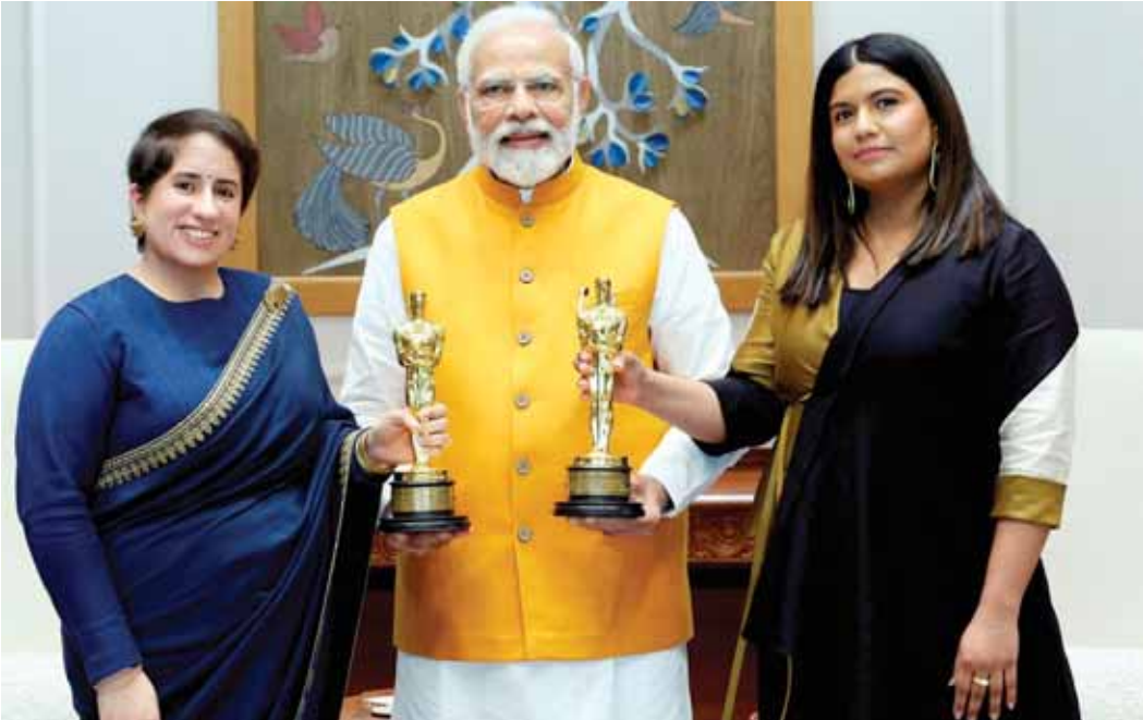
Prime Minister Modi with Oscar 2023 winning short documentary film 'The Elephant Whisperers' producer Guneet Monga and director Kartiki Gonsalves, in New Delhi, on Thursday.

'The Elephant Whisperers' created history at the 95th Academy Awards by becoming the maiden Indian production to win in the Documentary Short Subject category.