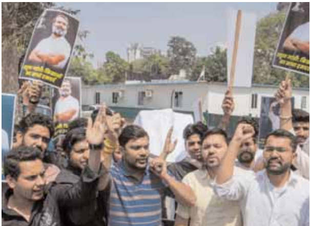
NSUI members during a Loktantra Bachao protest at Raisina Road, in New Delhi, on Thursday against the disqualification of Rahul Gandhi from the Sabha.

This statement by Germany sparked a political slugfest in the