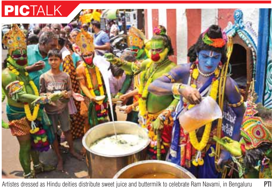
Artistes dressed as Hindu deities distribute sweet juice and buttermilk to celebrate Ram Navami, in Bengaluru

On the subject of hate speeches, Solicitor General Tushar Mehta also made an important remark: such speeches are also made against Hindus. On the face of it, this might appear whataboutery, but this is factually accurate. Two wrongs don't make a right, so statements against Muslims or Christians are not justifiable because similar ones are also made against Hindus. Mehta informed the court that in Tamil Nadu, "a spokesperson of DMK" said "whatever Periyar says should have been done... if you want equality, you must butcher all Brahmins." Against such a backdrop, as the Supreme Court said, some mechanism has to be developed, but it would be better that this mechanism is informal rather than formal. There are already a zillion laws; what is needed is a code of behaviour that political parties, rather than the Indian State, should evolve together. Something like the model code of conduct that governs the behaviour of parties and candidates before elections. It is not legally enforceable, yet it is widely adhered to. We should not forget that behavioural patterns are difficult to change with laws, rules, and fiat; when people themselves realise that something should be avoided, they avoid that. After all, politicians do observe the code of conduct. Therefore, the best way out would be a consensus among politicians and parties that decency in political discourse would be nice.