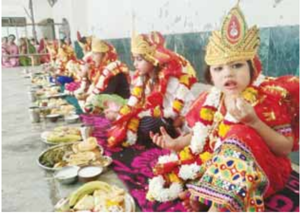
Kanya Puja ritual being held at Kinaram Ashram in Varanasi on Thursday.

Besides, hundreds of devotees thronged Mahalaxmi Gauri at Laxmi Kund on the last and auspicious occasion of Navami (ninth day) of Vasantik Navratri. A good number of