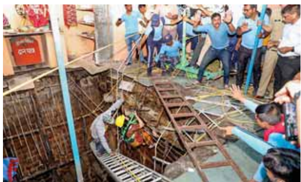
Rescue operation underway after the roof of a 'bawdi' (well) collapsed at Beleshwar Mahadev Jhulelal, in Indore, on Thursday. At least 8 people got killed and several others are feared trapped, according to officials

Ram Navami celebrations at Ra temple in Madhya Pradesh's Indore took a tragic turn when the roof of a 'bawdi' (well) collapsed during a havan (a fire ritual), killing 14 people. The toll is expected to go up during the night as the 30-35 devotees who fell into the well, many are still to be fished out and are missing.