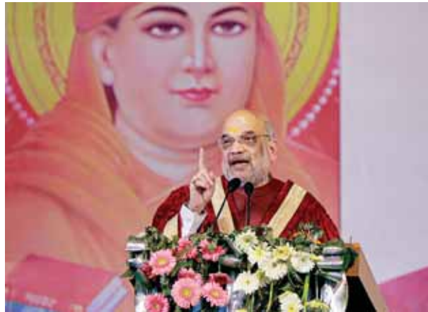
Union Home Minister Amit Shah speaks at the 113th convocation of the Gurukula Kangri University, in Haridwar, on Thursday

Shah praised the NEP brought by the Narendra Modi-led central government saying it represents the combined visions of Maharshi Dayanand Saraswati, Swami