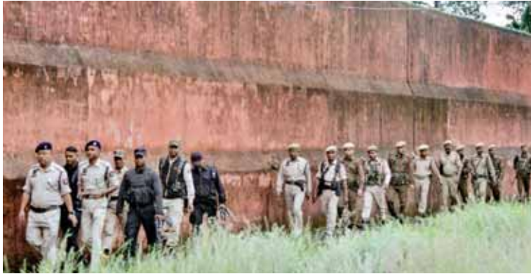
Tight security arrangements at Dibrugarh Central Jail where close aides of 'Waris Punjab De' founder Amritpal Singh are lodged, in Dibrugarh on Tuesday

According to the affidavit submitted by police in the