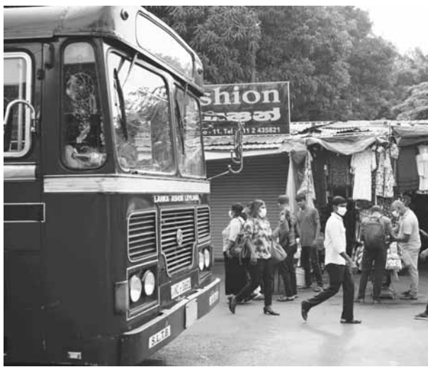
People arrive for their daily work in the central market area in Colombo, Sri Lanka, Tuesday.

The economy is facing significant challenges stemming from pre-existing vulnerabilities and policy missteps in the lead-up to the crisis, further aggravated by a series of external shocks, the IMF said. The EFF-supported programme aims to