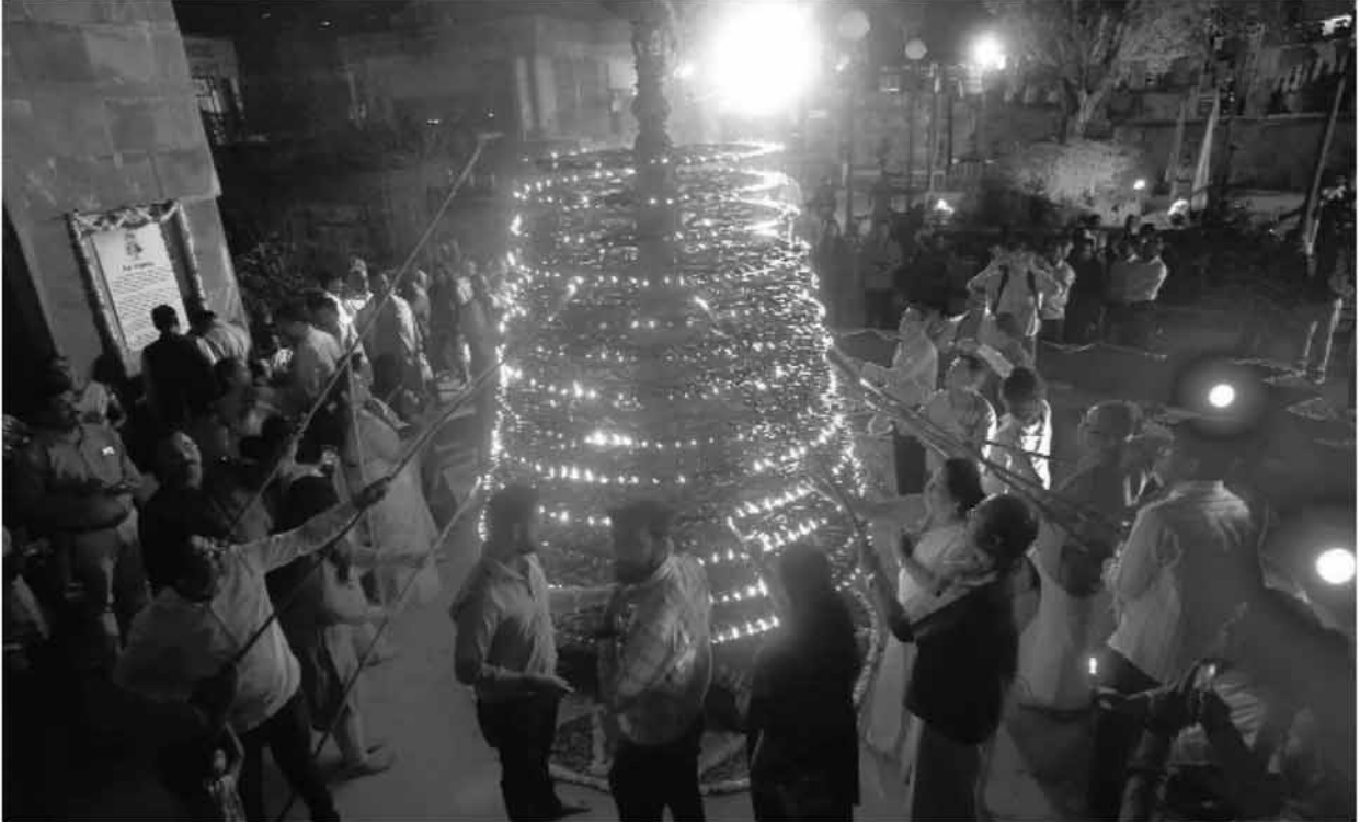
People light a huge lamp containing 1001 wicks (AI Vilikku, the traditional style of Kerala) to mark the 47th foundation day of Indira Gandhi Rashtriya Manav Sangrahalaya (IGRMS) in Bhopal on Tuesday.