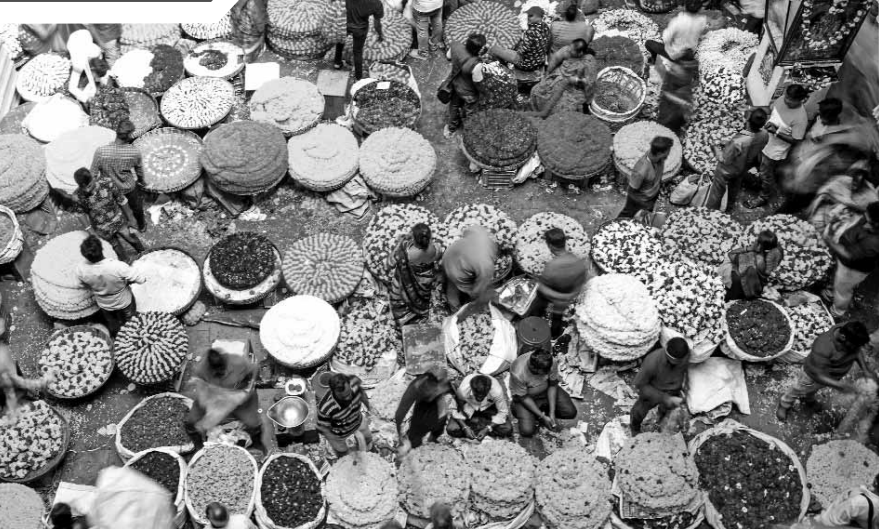
People buy flowers on the eve of Ugadi festival, at a wholesale market in Bengaluru