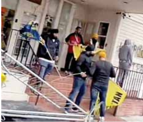
Pro-Khalistan supporters vandalise the Consulate General of India during a protest in San Francisco on the USA

High Court, a non-bailable warrant was also issued against the extremist on Monday.