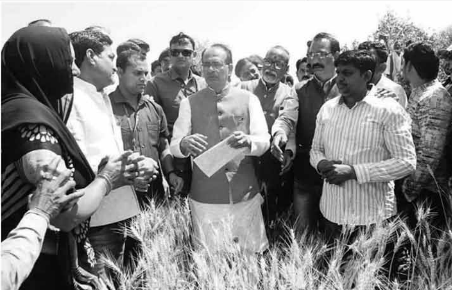
Chief Minister Shivraj Singh Chouhan inspects the wheat crops of the farmers damaged due to unseasonal rain and hailstorm in Patwari Khedi, Gulabganj Tehsil, Vidisha district Madhya Pradesh on Tuesday.