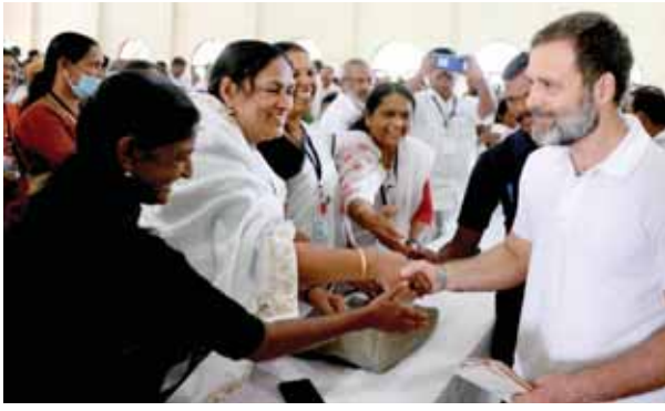
Congress leader Rahul Gandhi interacts with the elected UDF and LSGI members from Wayanad district at Kalpetta in Wayanad district on Tuesday

managed to pass a ₹1.185-lakh crore Budget for 2023-24 for the Union Territory of Jammu & Kashmir through the ruckus.