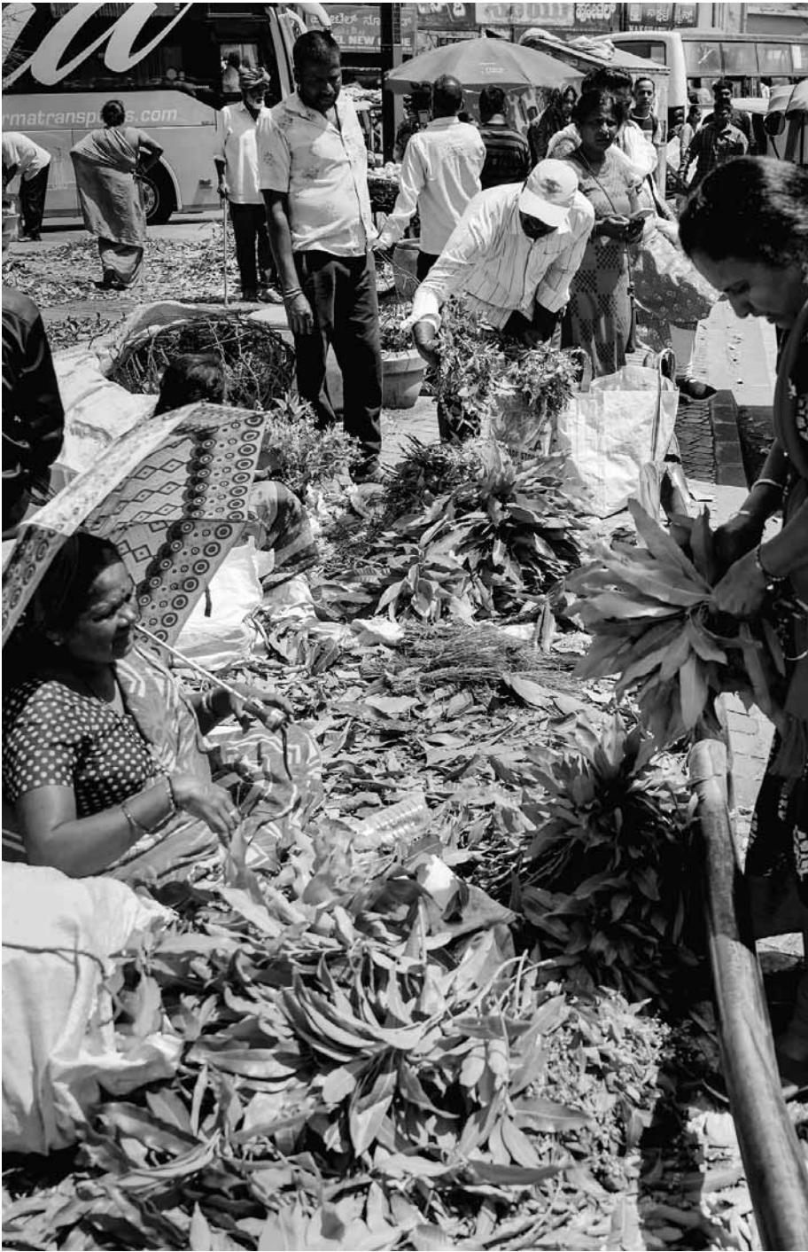
People buy leaves and flowers on the eve of Ugadi festival, at a wholesale market in Bengaluru on Tuesday.

Instructions may be issued not to sanction Casual Leave or other kind of leave to employees if applied for, during the period of the proposed protest/strike and ensure that the willing employees are allowed hindrance free entry into the office premises, the order said.