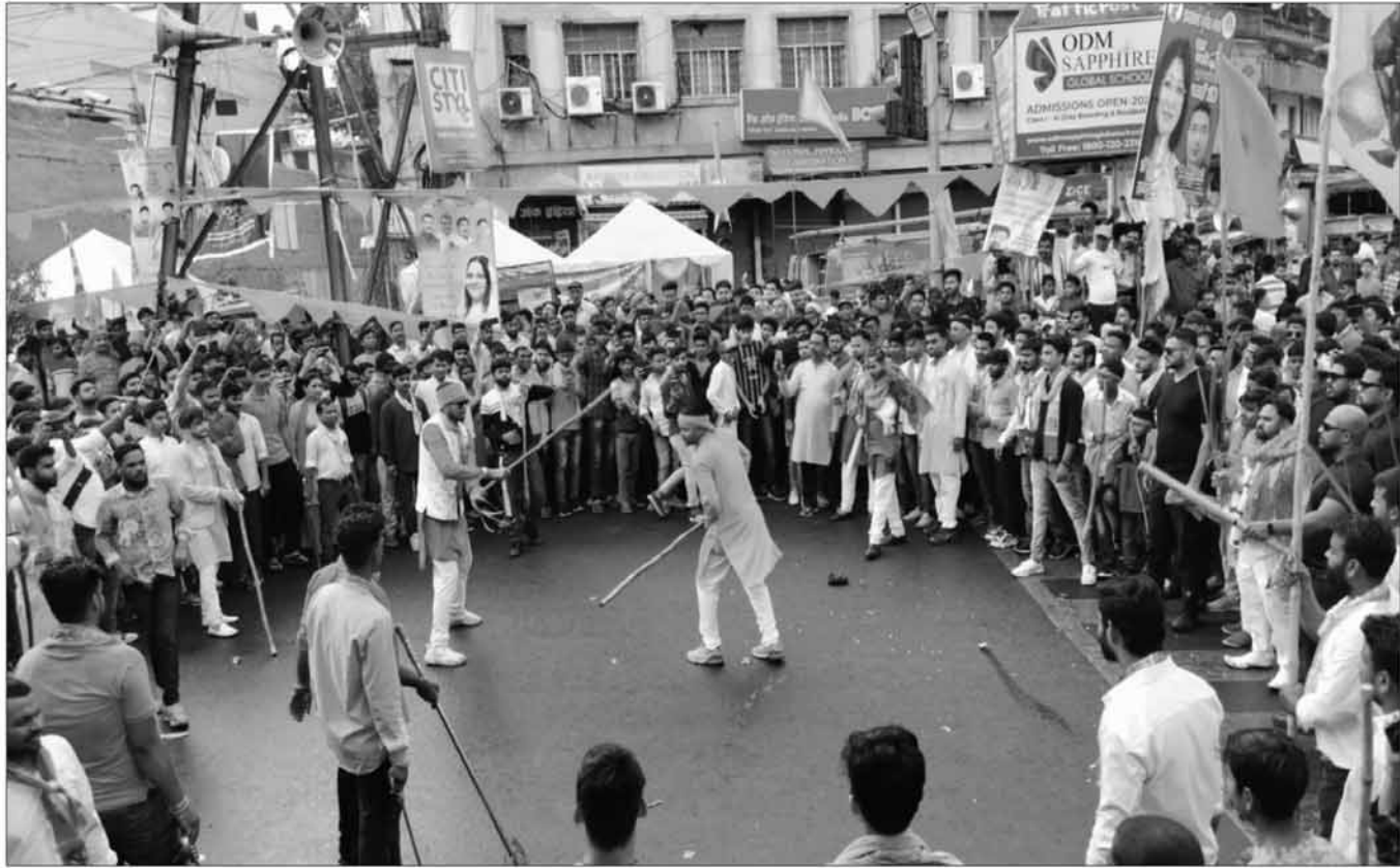
Devotees showcase arms skills as they celebrate Ramnavmi procession in Ranchi on Thursday.

This tiger came from Chhatisgarh on March 17. It had so far attacked 3 people, two of them males. The biggest consolation is that all three people attacked by the tiger are alive and recovering.