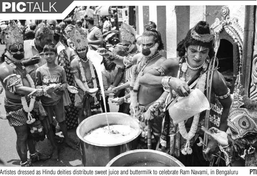
Artistes dressed as Hindu deities distribute sweet juice and buttermilk to celebrate Ram Navami, in Bengaluru

On the subject of hate speeches, Solicitor General Tushar Mehta also made an important remark: such speeches are also made against Hindus. On the face of it, this might appear whataboutery, but this is factually accurate. Two wrongs don't make a right, so statements against Muslims or Christians are not justifiable because similar ones are also made against Hindus. Mehta informed the court that in Tamil Nadu, "a spokesperson of DMK" said "whatever Periyar says should have been done... if you want equality, you must butcher all Brahmins." Against such a backdrop, as the Supreme Court said, some mechanism has to be developed, but it would be better that this mechanism is informal rather than formal. There are already a zillion laws; what is needed is a code of behaviour that political parties, rather than the Indian State, should evolve together. Something like the model code of conduct that governs the behaviour of parties and candidates before elections. It is not legally enforceable, yet it is widely adhered to. We should not forget that behavioural patterns are difficult to change with laws, rules, and fiat; when people themselves realise that something should be avoided, they avoid that. After all, politicians do observe the code of conduct. Therefore, the best way out would be a consensus among politicians and parties that decency in political discourse would be nice.