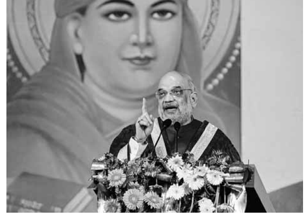
Union Home Minister Amit Shah speaks at the 113th convocation of the Gurukula Kangri University, in Haridwar, on Thursday

Union Home Minister Amit Shah on Thursday hailed the central government's New Education Policy for its emphasis on learning in mother tongue and universal education based on the teachings of Indian visionaries such as Mahatma Gandhi and Dayanand Saraswati. Addressing the 113th convocation of the Gurukula Kangri here, Shah credited the university (deemed to be) for the revival of vedic education in India and combining it with modern education. Shah paid tributes to the university's founder Swami Shradhdhanand and saying he set India's education system free from the stranglehold of the British and revived the country's vedic education system, all the while emphasising on culture and modern education. Shah praised the NEP brought by the Narendra Modi-led central government saying it represents the combined visions of Maharshi Dayanand Saraswati, Swami