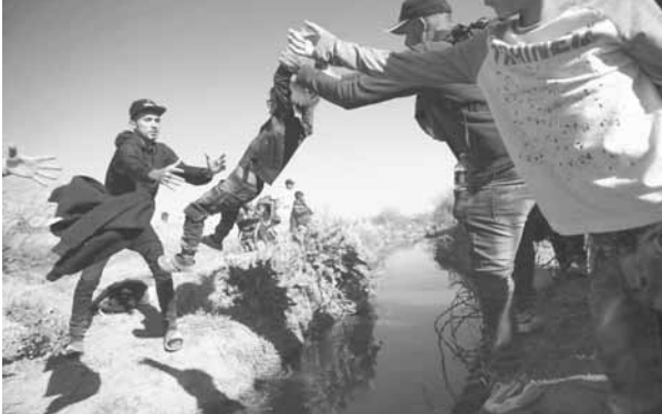
Migrants cross the Rio Grande river into the United States from Ciudad Juarez, Mexico on Wednesday.

Five of those under investigation for possible misconduct are private security guards, two