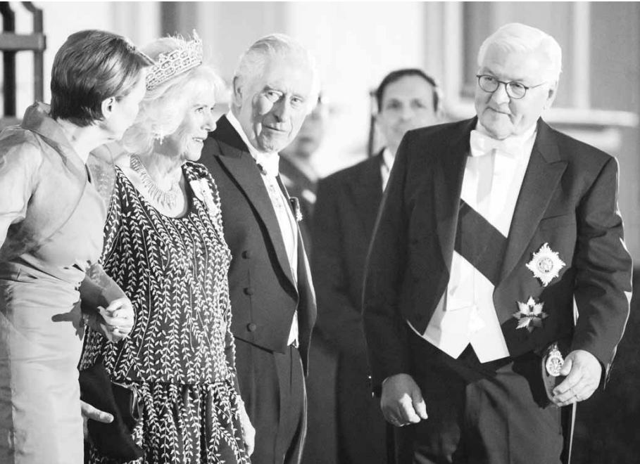
Britain’s King Charles III and Camilla, Queen Consort are welcomed by German President Frank-Walter Steinmeier and his wife Elke Buedenbender in front of Bellevue Palace for a state banquet in Berlin, Germany

All those charged this week have been bailed to appear at the Melbourne Magistrates’ Court on August 8. Further investigation is underway and police are making enquiries to identify and apprehend any further alleged offenders from the day, the statement added. India has asked the Australian government to curb the anti-India activities of the Khalistani separatists and frequent attacks on the Hindu temples in the country. Narendra Modi raised concerns over the recent attacks on temples in Australia as well as pro-Khalistan activities there with his Australian counterpart Anthony Albanese during their meeting in New Delhi this month.