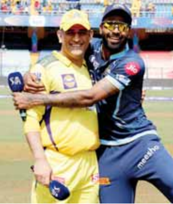
AHMEDABAD

Hardik Pandya's youthful leadership template will meet its match in Mahendra Singh Dhoni's time-tested improvisations as defending champions Gujarat Titans clash with eternal title contenders Chennai Super Kings in the Indian Premier League opener here on Friday.