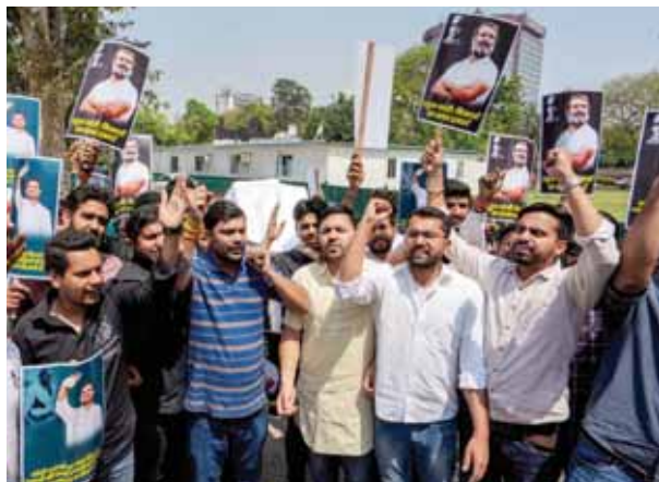
NSUI members during a Loktantra Bachao protest at Raisina Road, in New Delhi, on Thursday against the disqualification of Rahul Gandhi from the Sabha.

This statement by Germany sparked a political slugfest in the