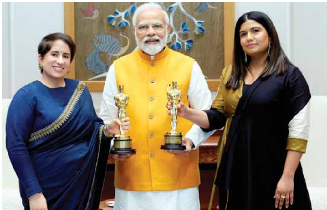
Prime Minister Modi with Oscar 2023 winning short documentary film 'The Elephant Whisperers' producer Guneeet Monga and director Kartiki Gonsalves, in New Delhi, on Thursday.

"The Elephant Whisperers" created history at the 95th Academy Awards by becoming the maiden Indian production to win in the Documentary Short Subject category.