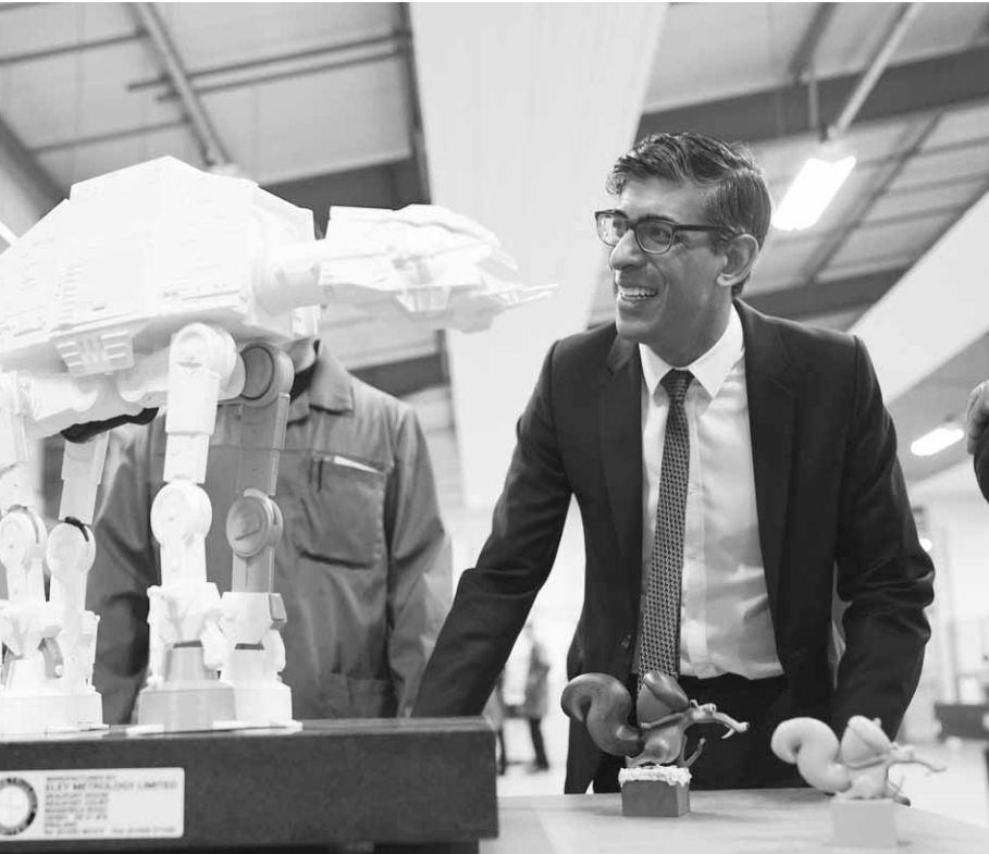
Britain's Prime Minister Rishi Sunak is shown a 3-D printed model of an All Terrain Armoured Transport Walker from Star Wars, made by apprentices, during a visit to the UK Atomic Energy Authority, Culham Science Centre, for a discussion on energy security and net zero, in Abingdon, Englandsdon Thursday.

The fight against terrorism is a necessity for all free countries, he added, and in particular for two countries like India and Israel. Shared values, concerns, pain and immense potential in the strategic partnership continue to strengthen Indo-Israeli ties, Ohana said.