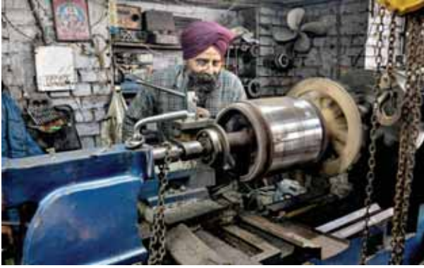
The packaging industry is growing at 15-17 per cent and the sector has the potential to create employment opportunities in the country, industry experts said in New Delhi

The event was organised by the Indian Institute of Packaging (IIP), an autonomous body under the Union Ministry of Commerce and Industry, a release said. The packaging business in the world is worth USD 79 billion