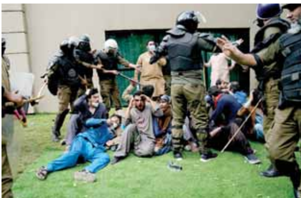
Police detain supporters of former Prime Minister Imran Khan during a search operation in the Khan's resident, in Lahore on Saturday

In March, till now 15 samples of the XBB 1.16 variant have been found, the INSACOG said.