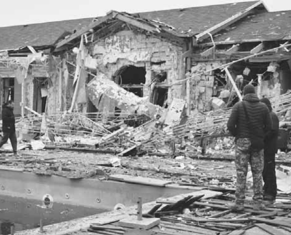
People inspect a damaged restaurant after Russian shelling hit in Zaporizhzhia, Ukraine on Saturday