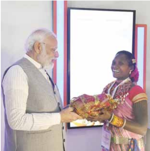
Prime Minister Narendra Modi receives a gift from an exhibitor while visiting an exhibition during the 'Global Millets (Shree Anna) Conference' in Pusa, in New Delhi on Saturday (Report on Page 4)

His remarks come amid a political slugfest over Gandhi's