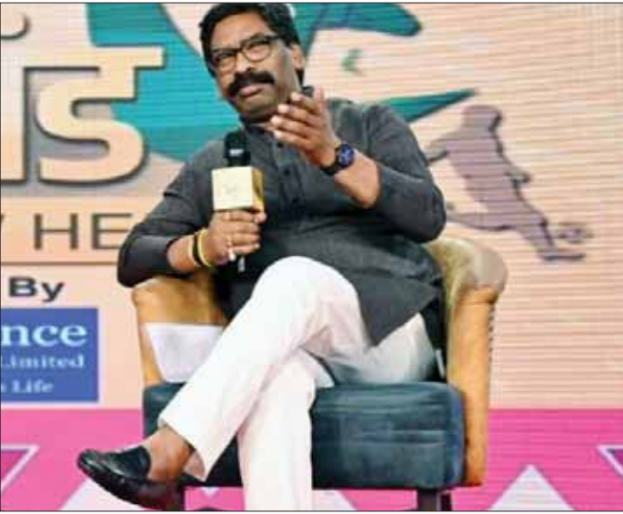
Chief Minister Hemant Soren speaks during Jharkhand Samvad programme in Ranchi on Saturday.