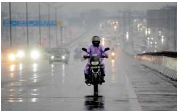
A man rides his bike on a road near Akshardham amid rainfall, in New Delhi, on Saturday

Hail may injure people and cattle in open places, strong