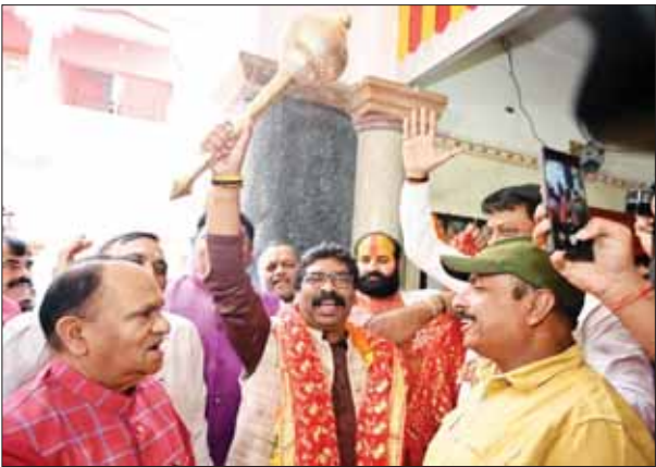
Chief Minister Hemant Soren lifts a mace during laying foundation stone for the beautification and reconstruction work of the Tapovan temple in Ranchi on Tuesday.

Rs 14 crore 67 lakh will be spent on the beautifica-