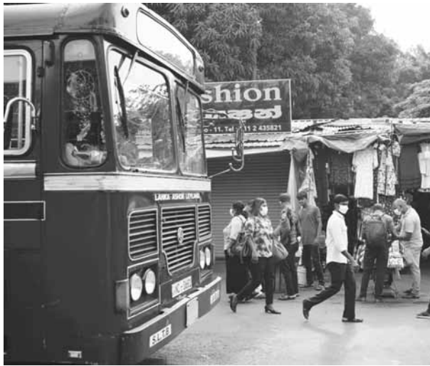
People arrive for their daily work in the central market area in Colombo, Sri Lanka, Tuesday.

The IMF has approved a USD 3 billion bailout programme to help debt-ridden Sri Lanka overcome its economic crisis and catalyse financial support from other development partners, a move welcomed by Colombo on Tuesday as a “historic milestone” in the critical period. International Monetary Fund’s Executive Board approved on Monday a 48-month extended arrangement under its Extended Fund Facility (EFF) with an amount of SDR 2.286 billion (about USD 3 billion), according to a statement. Special Drawing Rights (SDR) are supplementary foreign exchange reserve assets defined and maintained by the International Monetary Fund (IMF). Sri Lanka has been hit hard by a catastrophic economic and humanitarian crisis. The economy is facing significant challenges stemming from pre-existing vulnerabilities and policy missteps in the lead-up to the crisis, further aggravated by a series of external shocks, the IMF said. The EFF-supported programme aims to