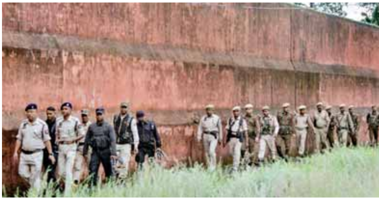
Tight security arrangements at Dibrugarh Central Jail where close aides of 'Waris Punjab De' founder Amritpal Singh are lodged, in Dibrugarh on Tuesday

According to the affidavit submitted by police in the