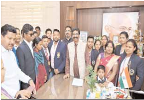
Divyang players meet Chief Minister Hemant Soren at the Assembly during the ongoing Budget Session of the State Assembly in Ranchi on Tuesday.

road going from overbridge to Nivaranpur will also be widened. An alternate route