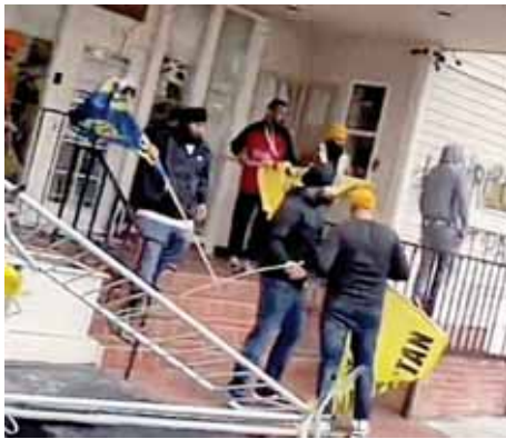
Pro-Khalistan supporters vandalise the Consulate General of India during a protest in San Francisco on the USA

High Court, a non-bailable warrant was also issued against the extremist on Monday.