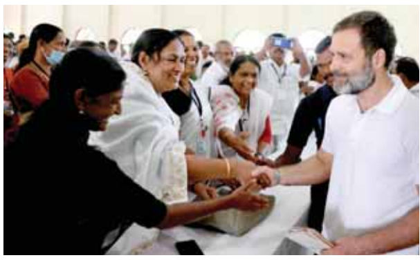
Congress leader Rahul Gandhi interacts with the elected UDF and LSGI members from Wayanad district at Kalpetta in Wayanad district on Tuesday

The Lok Sabha, however, managed to pass a ₹1.185-lakh