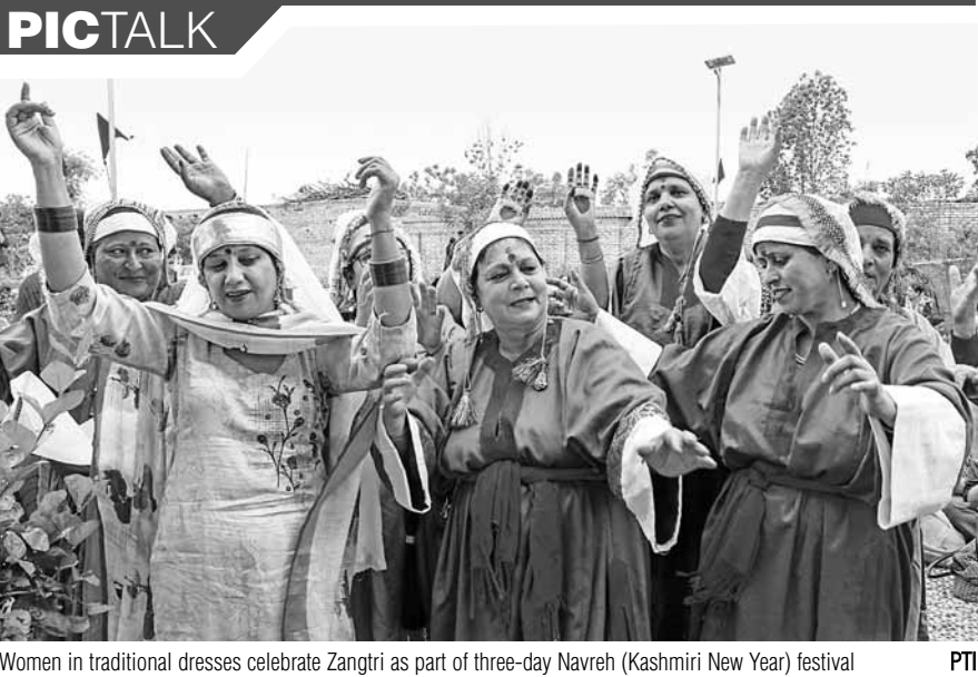
Women in traditional dresses celebrate Zangtri as part of three-day Navreh (Kashmiri New Year) festival

"It is the statutory duty of the Commission to eliminate practices having adverse effect on competition, promote and sustain competition, protect the interests of consumers and ensure freedom of trade carried on by other participants, in markets in India as provided in the Preamble as well as Section 18 of the Act," says the CCI website. The commission is also mandated to give its opinion on competition issues to government or statutory authority and to undertake competition advocacy for creating awareness of competition law, it adds. Against this backdrop, the very idea of the Ministry of Commerce & Industry setting up a body for the same purpose is duplication of work. Besides, it also militates against the principle Prime Minister Narendra Modi has stated more than once: the government has no business to be in business. It is in pursuance of this principle that the Government has been privatising public sector undertakings. But, by launching ONDC, the Ministry of Commerce & Industry will be ensuring government interference in the economy — something that is not in tune with the Modi Government reformist agenda. On the face of it, ONDC's new forays may seem impressive but in reality these don't appear to be consistent with the newly emerging policy framework. Instead of zealously promoting ONDC, the Ministry of Commerce & Industry should focus on boosting manufacturing.