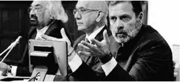
PIONEER NEWS SERVICE ■ NEW DELHI/UNITED NATIONS

A verdict sentencing Congress leader Rahul Gandhi to jail for two years echoed in the United Nations (UN) and it said the international body was aware of it.