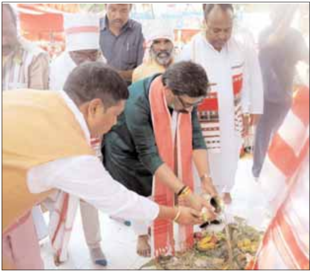
Chief Minister Hemant Soren performs rituals during Sarhul festival in Ranchi on Friday.

On this occasion, the CM said that the government has decided to provide well-equipped and necessary facilities to the hostels. The renovation work of the hostels has also started. In this episode, an action plan has been chalked out to give a new dimension to the tribal hostel. Separate multi-storey hostels for boys and girls will be built here, where there will be complete arrangements for living of 500 boys and 500 girls studying. He announced plans to renovate the Science and Arts Block of Ranchi Women's College.