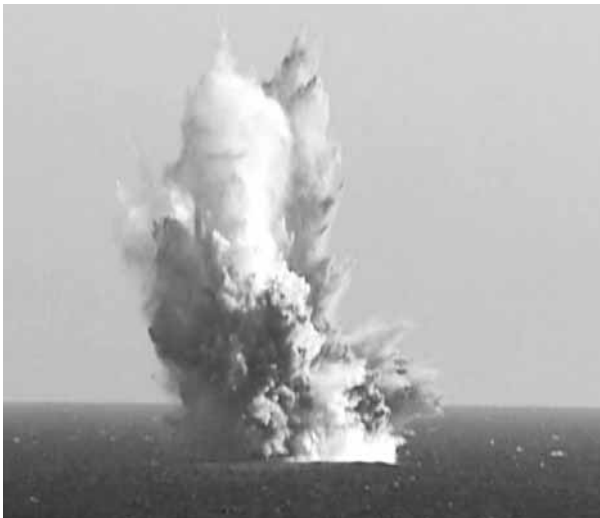
This photo provided by the North Korean government, shows what it says is an underwater blast of test warhead loaded to an unmanned underwater nuclear attack craft "Haeil" during an exercise around Hongwon Bay in waters off North Korea's eastern coast Thursday, AP/PTI

AP ■ SEOUL North Korea claimed on Friday to have tested a nuclear-capable underwater drone designed to generate a gigantic "radioactive tsunami" that would destroy naval strike groups and ports. Analysts were skeptical that the device presents a major new threat, but the test underlines the North's commitment to raising nuclear threats. The test this week came as the United States reportedly planned to deploy aircraft carrier strike groups and other advanced assets to waters off the Korean Peninsula. Military tensions are at a high point as the pace of both North Korean weapons tests and US-South Korea joint military exercises has accelerated in the past year in a cycle of tit-for-tat responses.