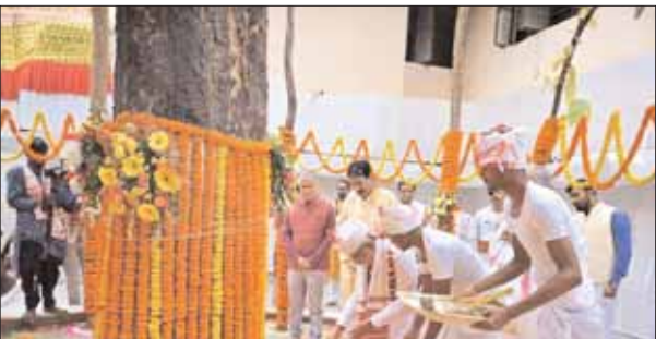
Governor CP Radhakrishnan performs rituals during "Sarhul Puja Mahotsav" at Tribal and Regional Languages, Ranchi University in Ranchi on Friday.