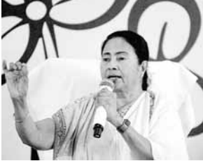
West Bengal Chief Minister Mamata Banerjee speaks during a meeting, in Kolkata, on Friday

While Bengal Opposition parties—save the BJP—would not exhibit much of enthusiasm over Banerjee’s statement saying she was more concerned about the rising popularity of “Under PM Modi’s New India, Opposition leaders have become the prime target of BJP” Banerjee who is also the president of Trinamool Congress wrote in her Twitter post. Condemning the kind of treatment meted out to the Congress leader she said