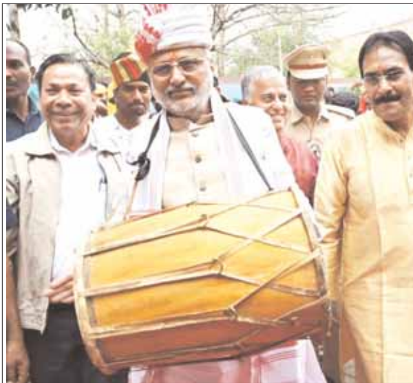
Governor CP Radhakrishnan beat a traditional Dhol during "Sarhul Puja Mahotsav" at Tribal and Regional Languages, Ranchi University in Ranchi on Friday.

The Governor said that in today's modern era where the whole world is worried about global warming, the importance of such festivals increases even more. This festival inspires humans for the protection and promotion of nature. Highlighting the importance of trees, he said that "It is impossible to imagine life without trees, if there is a tree then there is life". Water level has increased significantly and rainfall has also increased. He said that Jharkhand state would be invited to benefit from the