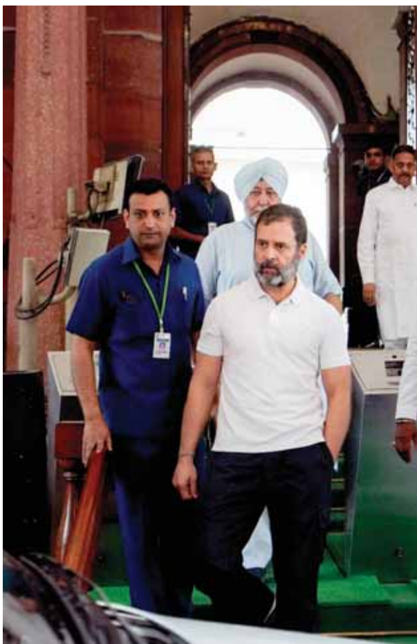
Congress leader Rahul Gandhi leaves Parliament House complex in New Delhi on Friday

Later, Rahul tweeted, "I am fighting for the voice of