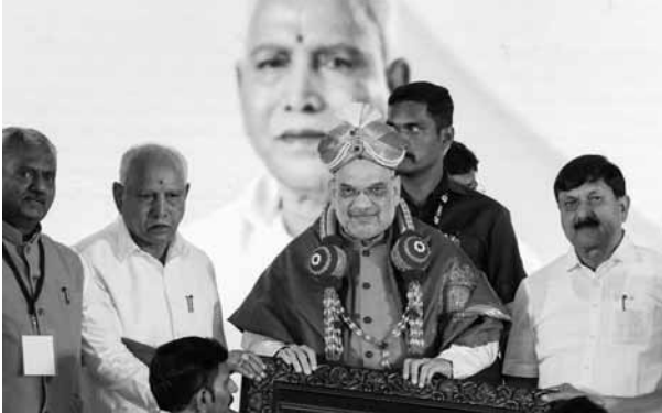
Union Home Minister Amit Shah during the foundation laying ceremony of Sahakar Samridhhi Soudha and the inauguration of various development works of the Department of Cooperation (Karnataka), in Bengaluru, on Friday

“Congress party is degenerating across the country, the Congress people don’t have any state with them that can fill the Congress’ central treasury, they want an ATM.... They want Karnataka to become Congress’ ATM, and the corrupt Congress’ eyes are now set