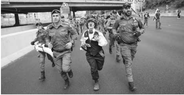
An Israeli activist dressed as a clown runs with border police as Israelis protest against plans by 'Netanyahu' in Tel Aviv, Israel on Thursday.

Jerusalem (AP): Israel's attorney general on Friday warned Prime Minister Benjamin Netanyahu that he has violated the Supreme Court's conflict of interest ruling, which barred him from direct involvement in his government's divisive plans for a judicial overhaul. Netanyahu's far-right government has barreled ahead with plans to weaken the Supreme Court and grant politicians less judicial oversight in their policymaking despite massive protests from across Israeli society — including an uproar among business leaders, top legal officials and military reservists. On Thursday, just hours after his coalition passed a law that would protect the Israeli leader from being