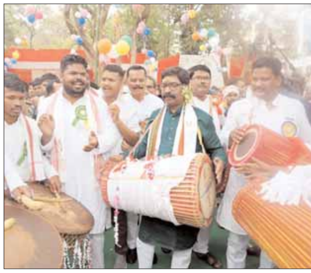
Chief Minister Hemant Soren beats a traditional Mandar to celebrate Sarhul festival in Ranchi on Friday.

The CM said that Sarhul festival on one hand connects us with nature and on the other hand gives us a pleasant feeling of our rich tradition