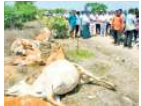
Carcasses of cows died in a road accident in Nalgonda district on Tuesday

The police registered a case and the investigation is on.