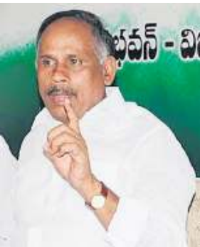
Gautam Adani and the financial scams involving Adani.

Rahul Gandhi questioned Prime Minister Narendra Modi during 'Bharat Jodo Yatra' about the links between Modi and