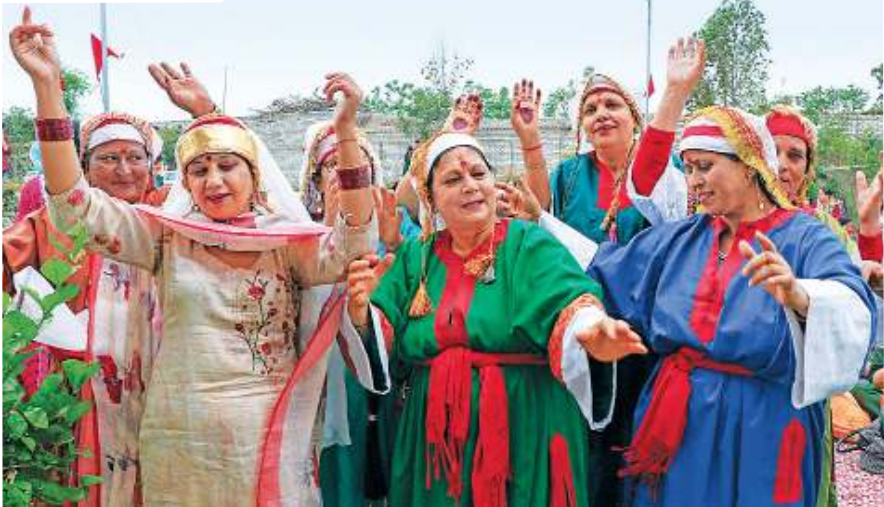
Women in traditional dresses celebrate Zangtri as part of three-day Navreh (Kashmiri New Year) festival