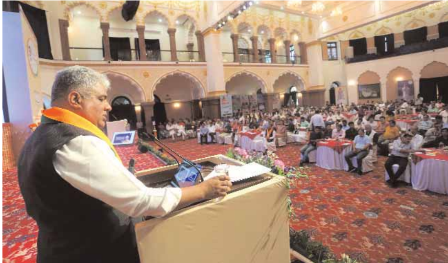
Union Minister for Environment, Forest and Climate Change Bhupendra Yadav addresses a media interaction programme over the Union Government's achievement in the past 9 years, at Kushabhau Thackeray Convention Center in Bhopal.

ment coordinators, played a crucial role in making the Internship Fair successful. The AI and Android Training Division Soft Skill, Coding, and Aptitude Training team was also present to understand the current trends and demands in the corporate world and engaged themselves in discussions with HR heads and CEOs/founders of companies.