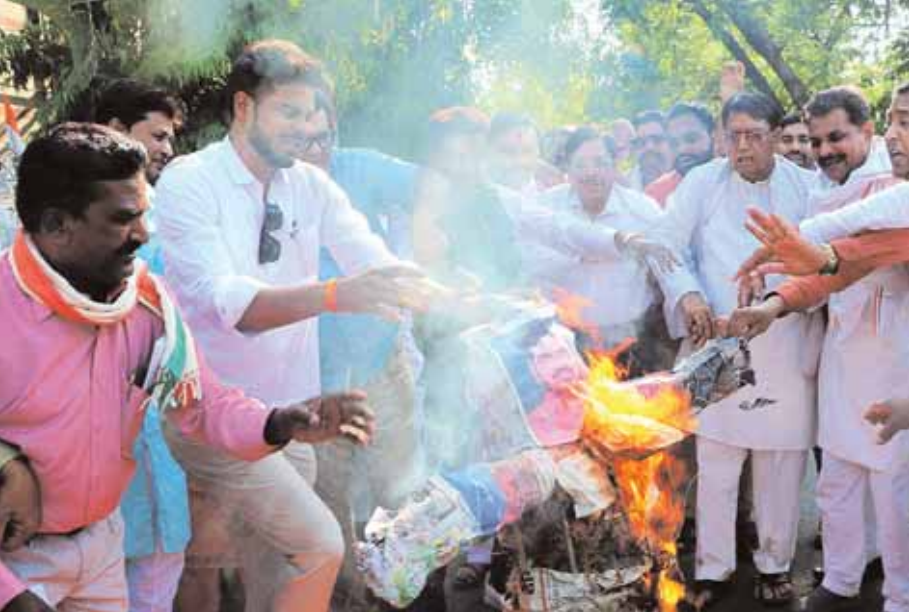
Congress party workers burn an effigy of the outgoing President of Wrestling Federation of India and BJP MP Brij Bhushan Sharan Singh, at PCC headquarters in Bhopal on Monday. The Congress party activists were protesting against the action of police on top wrestlers who were agitating against the BJP MP Brij Bhushan Singh.