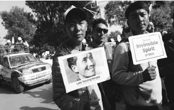
People from the mountaineering community, Sherpa guides and officials participate in a rally to mark the 70 anniversary of the first ascent of Mount Everest in Kathmandu, Nepal on Monday