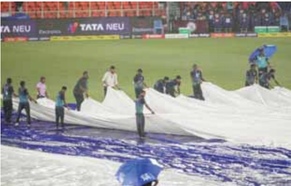
Groundsmen cover the pitch as it rains during the IPL 2023 cricket match between Gujarat Titans and Chennai Super Kings, at the Narendra Modi Stadium in Ahmedabad, on Monday

B Sai Sudharsan struck a 47-ball 96 and missed his maiden IPL century, but did a fine job to take his team to a daunting total with Shubman Gill (39), Wriddhiman Saha (54) and Hardik Pandya (21 not out) chipping in with vital contributions. It began with the