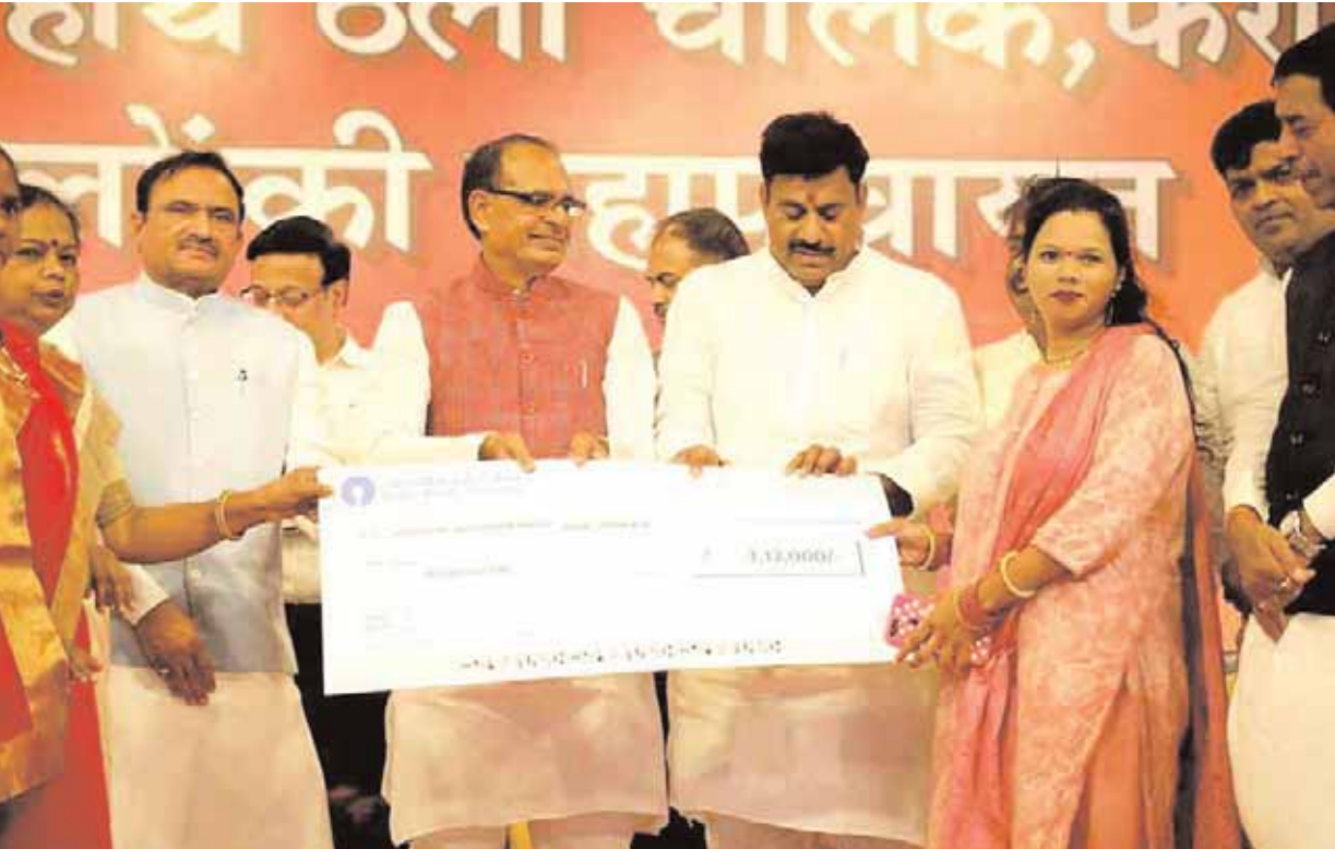
Madhya Pradesh Chief Minister Shivraj Singh Chouhan during a hand-cart hawkers and street vendors Panchayat at his residence in Bhopal on Monday.