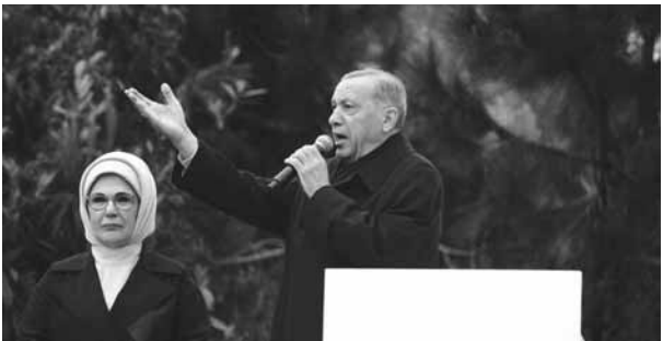
President Recep Tayyip Erdogan delivers a speech to supporters outside his residence in Istanbul

Turkish President Recep Tayyip Erdogan turned away a challenger who sought to reverse his authoritarian-leaning changes, securing five more years to oversee the country at the crossroads of Europe and Asia that plays a key role in NATO. Erdogan prevailed by winning more than 52% of the vote in Sunday's presidential runoff, which came two weeks after he fell short of scoring an outright victory in the first round. A majority of Turkish voters in the second round chose him over challenger Kemal Kilicdaroglu, showing their support for a man who they see as a strong, proven leader. Voters were divided between loyalty to Erdogan, who has ruled for two decades, and hopes for the opposition candidate, who promised to return to democratic norms, adopt more conventional economic policies and improve ties with the West. With his immediate political future secure, Erdogan must now confront skyrocketing