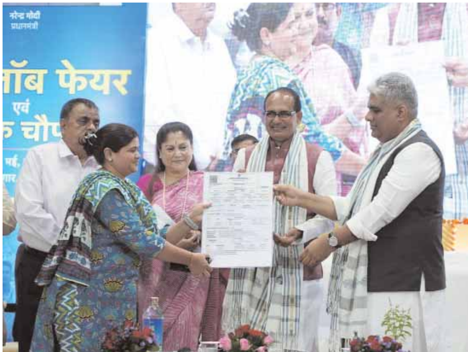
Union Minister for Labour and Employment, Forest and Climate Change Bhupendra Yadav and Chief Minister Shivraj Singh Chouhan attended a mega job fair programme in Bhopal for youths.

being upgraded in Bhopal, Jabalpur, Nagda. He has also assured to start a medical college in Dhar under the Ministry of Labour. The Chief Minister said that 9 successful years of Prime Minister Modi have been completed. In these years, the fate of the people and the picture of the country have changed. He has bestowed a big gift to give Madhya Pradesh the identity of Cheetah State. Madhya Pradesh was earlier a Tiger, Leopard and Gharial state. Now it has also become a Cheetah State. Union Minister Yadav has said today that you should not worry. When cheetahs come from other areas, they take time to adjust to the new environment. The Chief Minister said that he was very worried about the untimely death of 3 cheetah cubs.