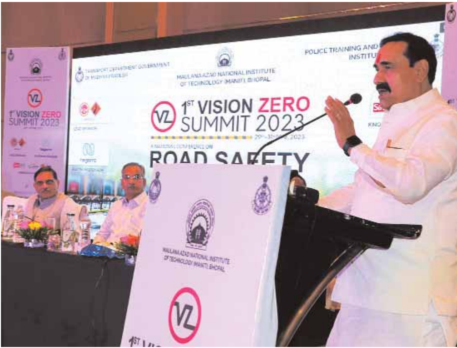
Minister for Home Affairs Narottam Mishra addresses a national conference on Road Safety 1st vision zero summit-2023, in Bhopal on Monday.

Urban Development and Housing Minister Bhupendra Singh said that hawkers zones should be made in cities for hand cart pushers and street vendors. They should get the benefits of all the public welfare schemes of the government. He said that Chief Minister Chouhan constantly worried about the street vendors during the Corona period. Prime Minister Narendra Modi gave huge relief to the street vendors during the Corona period by implementing the PM Swa-nidhi Yojana. In this scheme, Madhya Pradesh is number-1 in the country.