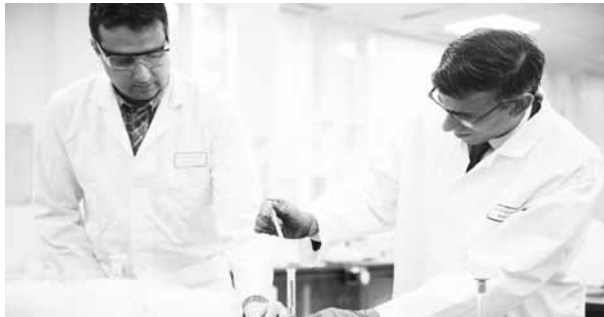
Britain's Prime Minister Rishi Sunak, right, visits a lab testing vaping products at Kent Scientific Services in West Malling, England on Tuesday.