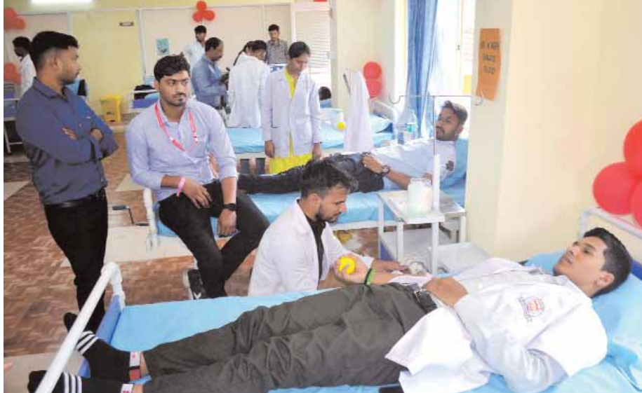
A blood donation camp organised at Mansarovar Dental College in Bhopal on Tuesday.