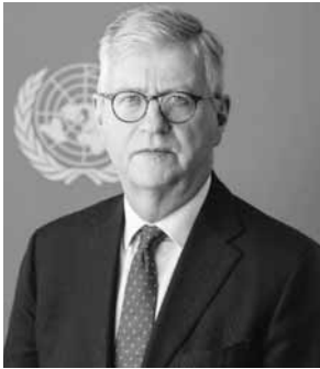
UN Under-Secretary-General for Peace Operations, Jean-Pierre Lacroix

India is currently the third largest contributor of uniformed personnel to UN Peacekeeping, with over 6,000 military and police personnel deployed to Abyei, the Central African Republic, Cyprus, the Democratic Republic of the Congo, Lebanon, the Middle