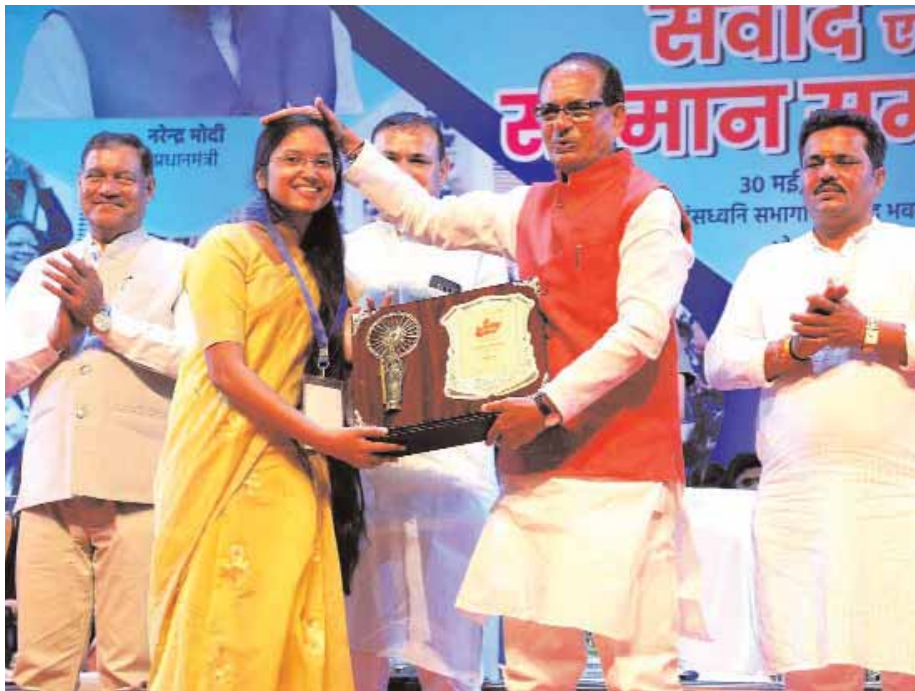
Chief Minister Shivraj Singh Chouhan felicitates students during an interaction and felicitation programme with meritorious students of high school and higher secondary and qualified aspirants of UPSC examination at Ravindra Bhawan.

400/220 KV sub-stations located in the power houses of MP Power Generating Company Limited from the Power System Development Fund set up for the strengthening of the transmission system, with a total cost of 85 crores 35 lakh rupees, which was approved by the Cabinet. For this work, the State Council of Ministers has decided to give approval to provide Rs. 6 crore 54 lakh as share capital, Rs. 58 crore 86 lakh as grant from Power System Development Fund and Rs. 19 crore 95 lakh by MP Power Generating Company. The Cabinet authorized the continuation of 6 thousand 474 temporary posts of the Narmada Valley Development Department till March 31, 2026, and authorized the Narmada Valley Development