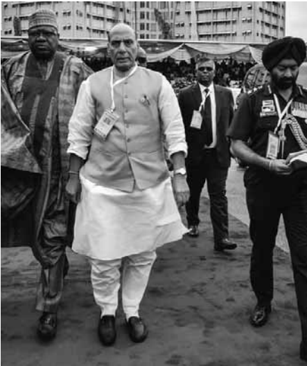
Defence Minister Rajnath Singh attends the swearing-in ceremony of Nigerian President-elect Bola Ahmed Tinubu, in Abuja on Monday

He also interacted with the senior Nigerian