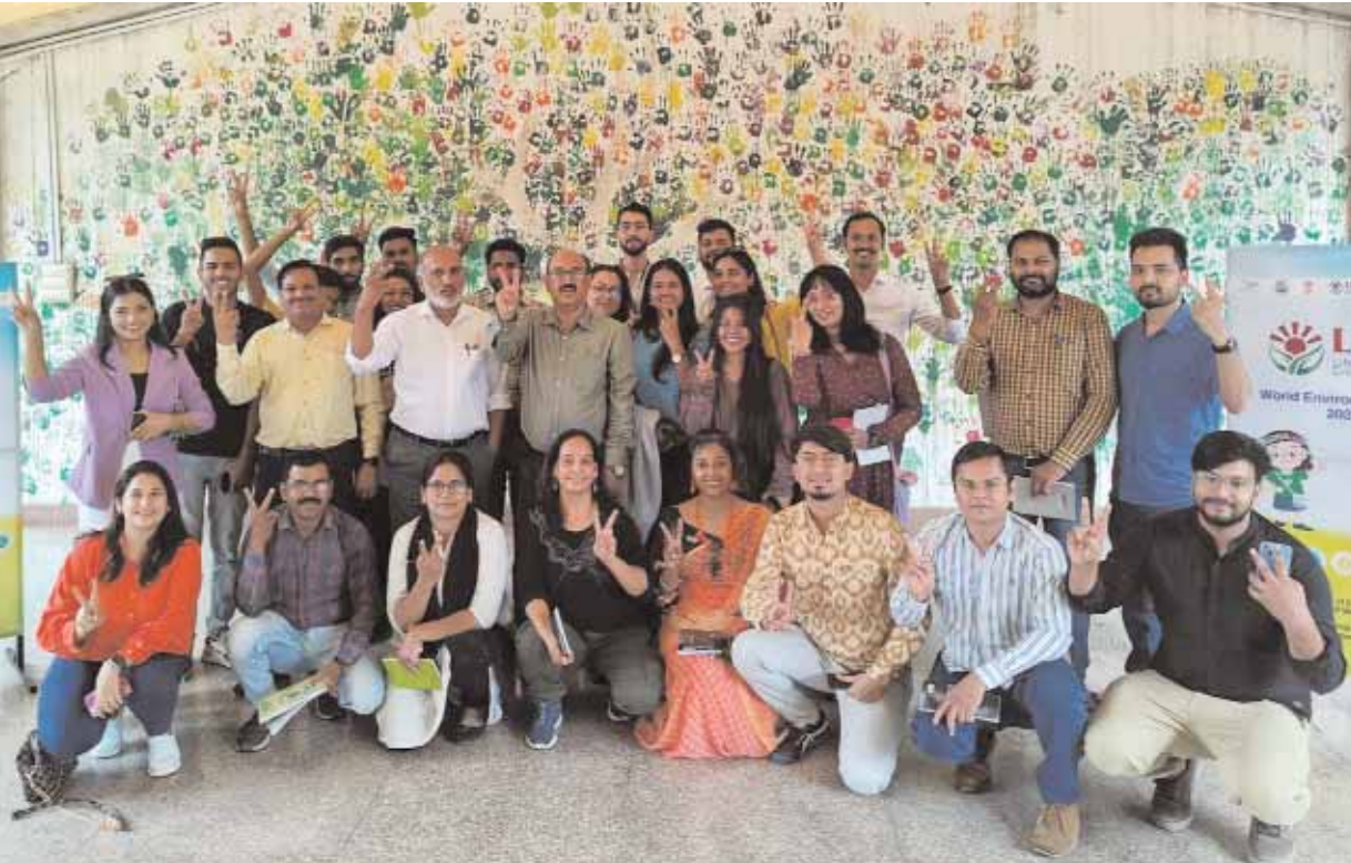
Participants at Social Media meet organised by EPCO and UNICEF pose for a photograph in Bhopal on Monday.