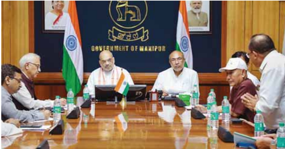
Union Home Minister Amit Shah with Manipur Chief Minister N. Biren Singh chairs a meeting with a delegation of leaders from various political parties, in Imphal, on Tuesday