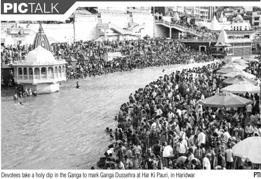
Devotees take a holy dip in the Ganga to mark Ganga Dussehra at Har Ki Pauri, in Haridwar

part, had been denouncing the Gehlot Government over inaction on alleged corruption during the previous BJP government under Vasundhara Raje. The big question is: would Gehlot and Pilot be willing to bury the hatchet? It is not just the GOP leadership but the entire Opposition would like them to, for if that happens, not only the Congress would be in a stronger position to take on the Bharatiya Janata Party in the forthcoming State polls but also in the 2024 general election. Further, as an upshot, the entire Opposition would gain strength. Many Opposition leaders are trying to forge an alliance against the Bharatiya Janata Party. Bihar Chief Minister Nitish Kumar will be holding a meeting in Patna in a few days; Nationalist Congress Party leader Sharad Pawar is working towards that end. All these attempts, along with the Congress' newfound confidence, can make arithmetic favourable for the Opposition, but that may not be enough. As we mentioned earlier, Prime Minister Narendra Modi is not the BJP's solitary trump card; the saffron party has also been able to entrench its narrative in political debate—the narrative of muscular nationalism, Hindutva, and unprecedented infrastructure development. The Opposition doesn't have a viable alternative to that.