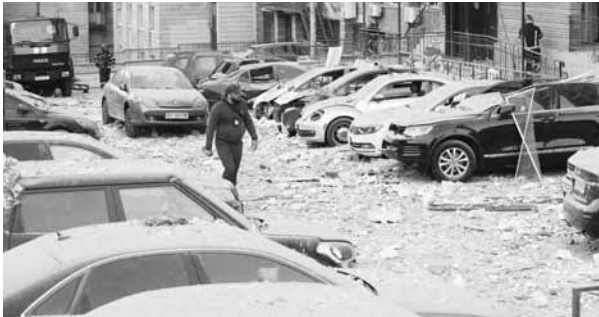
A police officer walks through a parking lot with damaged cars in front of a multi-story apartment building which was damaged during Russian attack in Kyiv, Ukraine, Tuesday