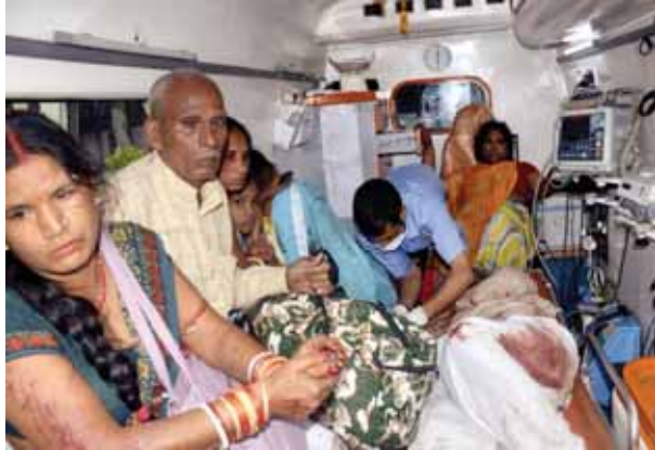
Passengers injured after a bus met with an accident in Jhajjar Kotli area, being shifted to GMC Hospital, in Jammu district, on Tuesday.

"The accident took place at Jhajjar Kotli bridge. Ten people have died. Rescue operation is almost complete," Jammu Senior Superintendent of Police