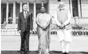
President Droupadi Murmu with Prime Minister Narendra Modi attends the ceremonial reception of the Cambodian King Norodom Sihamoni at Rashtrapati Bhavan, in New Delhi on Tuesday

Modi later tweeted, saying, “Delighted to welcome King HM Norodom Sihamoni of Cambodia. Our nations share deep historical and cultural ties, and we look forward to strengthening our friendship and cooperation even further. May his visit mark a new chap-