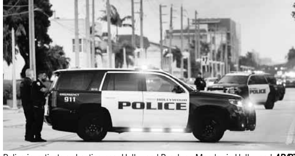
Police investigate a shooting near Hollywood Beach on Monday in Hollywood.

HOLLYWOOD (US): Nine people were injured Monday evening when gunfire erupted along a beach boardwalk in Hollywood, Florida, sending people frantically running for cover along the crowded beach on Memorial Day. Several of the victims were taken to a children’s hospital, police spokesperson Deanna Bettineschi said. However, authorities have not yet released the ages of the victims. The nine victims included six adults and three children, according to Yanet Obarrio Sanchez, a spokesperson for Memorial Healthcare System. All of the victims were in stable condition, she said. A preliminary investigation shows that an altercation between two groups resulted in gunfire, police said. One person has been detained and another suspect is being still being sought. The shooting happened about 6:30 p.m. on the boardwalk near a convenience store, a Ben & Jerry’s ice cream store and a Subway sandwich shop. Alvie Carlton Scott III said he was on the beach when all of a sudden he heard numerous gunshots go off. He said he hid behind a tree and then fled the area after a police officer told people to run. Jamie Ward, who was also on the boardwalk, said several young men were fighting in front of the stores when one pulled a gun and started shooting. Videos posted on Twitter on Monday evening showed emergency medical crews responding and providing aid to multiple injured people.