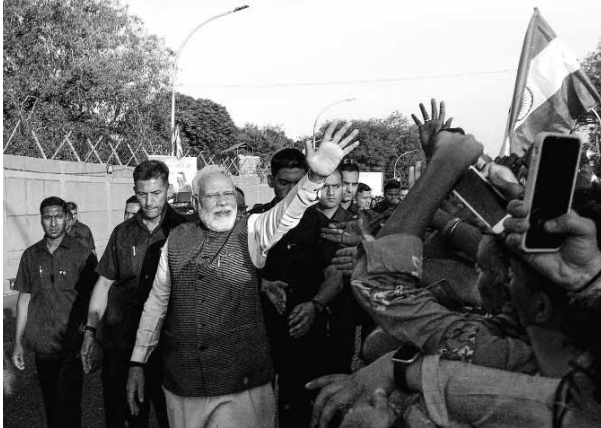
Prime Minister Narendra Modi being welcomed by supporters gathered at the airport upon his arrival following a three-nation visit to Japan, Papua New Guinea and Australia, in New Delhi on Thursday

Modi said he speaks confidently of India and its people’s strengths abroad and the world