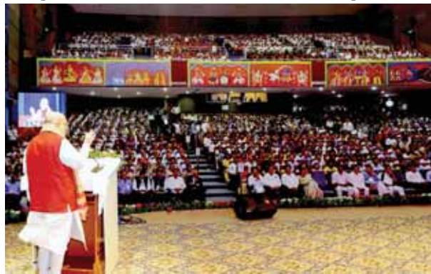
Union Minister for Home Affairs and Cooperation Amit Shah addresses the gathering at the laying foundation ceremony of National Forensic Sciences University (NFSU), in Guwahati on Thursday

"I will go to Manipur soon and stay there for three days but before that, both groups should remove mistrust and suspicion among themselves and ensure that peace is