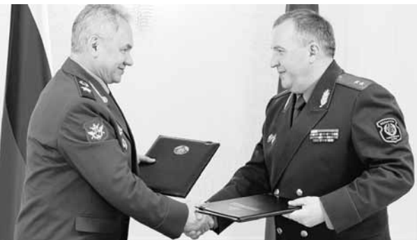
Russian Defense Minister Sergei Shoigu, left, and Belarusian Defense Minister Viktor Khrenin exchange documents on Thursday

Putin previously announced in March that his country planned to deploy tactical, comparatively short-range and small-yield nuclear weapons in Belarus. The inking of the deal comes as Russia braces for Ukraine's much-anticipated counteroffensive. Both Russian and Belarusian officials framed the step as driven by hostility from the West. "Deployment of nonstrategic nuclear weapons is an effective response to the aggressive policy of countries unfriendly to us," Belarusian Defence