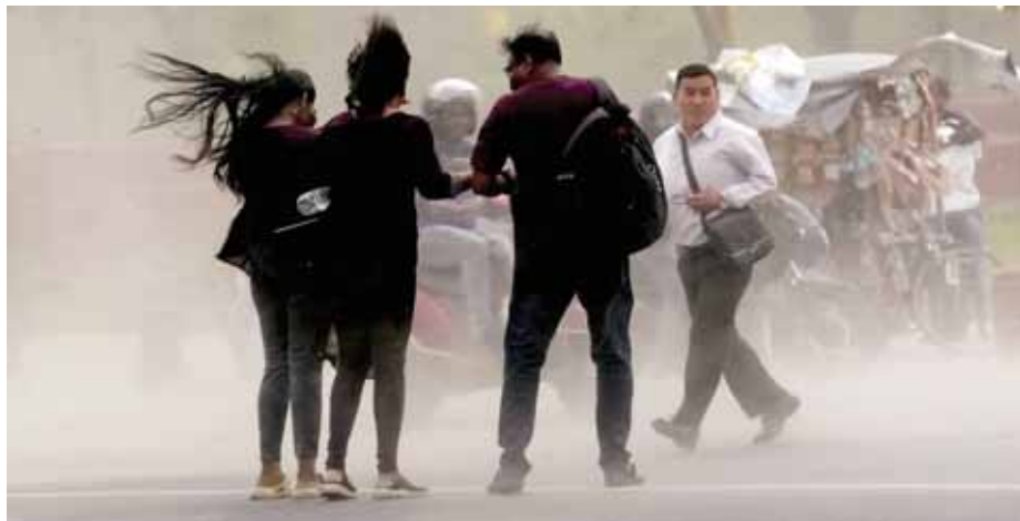
Light rain and strong dust-raising winds hit parts of Delhi-NCR on Thursday, lowering the maximum temperature. Similar conditions are expected to prevail in the national Capital and NCR over the next two to three days and no heatwave is predicted until May 30, the India Meteorological Department said PTI

The MiG-29K jet is part of INS Vikrant's fighter fleet. The supersonic fighter jet has a top speed of Mach 2 (two times the speed of sound) and can pull up to 8G (eight times the force of gravity) and can climb to an altitude of over 65,000 feet.