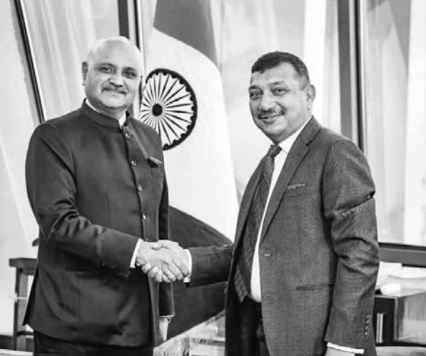
New CBI Director Praveen Sood (L) with outgoing CBI Director Subodh Jaiswal, in New Delhi on Thursday

He also holds post graduate degrees from the Indian Institute of Management, Bengaluru and the Maxwell