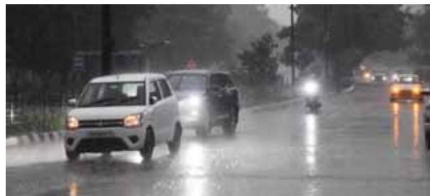
Regional Office of the India Meteorological Department here.

Thunderstorms also lashed Cuttack and other areas in the State. Heavy rainfall lashed the districts of Puri, Jagatsinghpur, Jajpur, Nayagarh, Dhenkanal, Khordha and Cuttack, said the