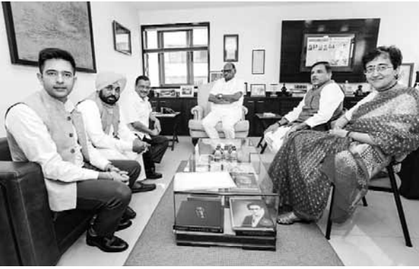
NCP Chief Sharad Pawar in a meeting with Delhi Chief Minister and AAP Convener Arvind Kejriwal, Punjab Chief Minister Bhagwant Mann and AAP leaders Sanjay Singh, Raghu Chadha and Atishi Marlena, in Mumbai, on Thursday

Pawar said that he would talk to the leaders of other non-BJP parties to muster support for Kejriwal in his fight against the ordinance. "There is a serious threat to democracy in the country. The Modi government is making all-out efforts to deprive the rights of governments elected by the people