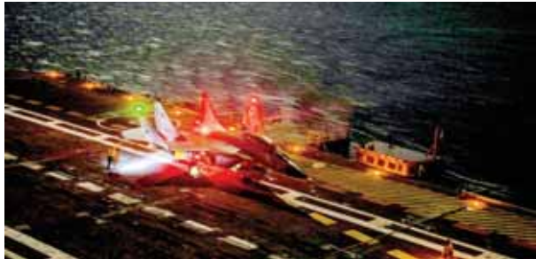
MiG-29K aircraft makes a maiden night landing on INS Vikrant

Defence Minister Rajnath Singh congratulated the Navy for undertaking a successful night landing and said, "This