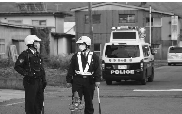
Police officers stand guard on a street leading to a building where a man is holed up in Nakano, central Japan on Thursday.

The three victims were taken to a nearby hospital, where the woman was later pronounced dead, police said. The two police officers also died, according to NHK. A fourth person who was injured could not be rescued because he was near the suspect, Kyodo News agency reported. Video on NHK