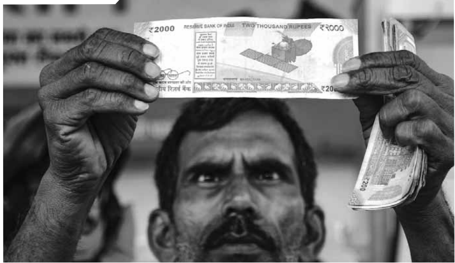
An employee checks Rs 2000 currency notes given by customers at a petrol pump in Gurugram