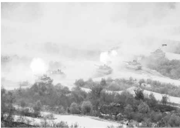
The South Korean army’s K-2 tanks fire during South Korea-US joint military drills at Seungjin Fire Training Field in Pocheon, South Korea on Thursday.

The drills simulated artillery and aerial strikes on front-line North Korean military facilities in response to an attack. The troops later practiced precision-guided attacks on simulated targets in the rear areas to “completely annihilate” North Korean military threats, according to a ministry statement.