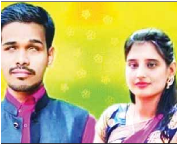
Bhubaneswar and Ravenshaw College. She was hired as a primary school teacher by the

JAJPUR A blind girl and a blind boy, who have been in a love relationship since their schooldays and are now teachers, have tied the nuptial knot at the Biraja temple in Jajpur.