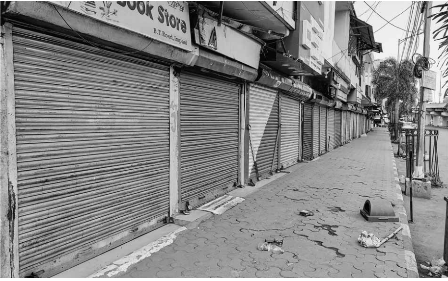
Closed shops at a market in Imphal on Thursday. Prices of essential commodities such as rice, potato, onion and egg besides LPG cylinders and petrol have skyrocketed after clashes broke out in Manipur after a 'Tribal Solidarity March' was organised in the hill districts