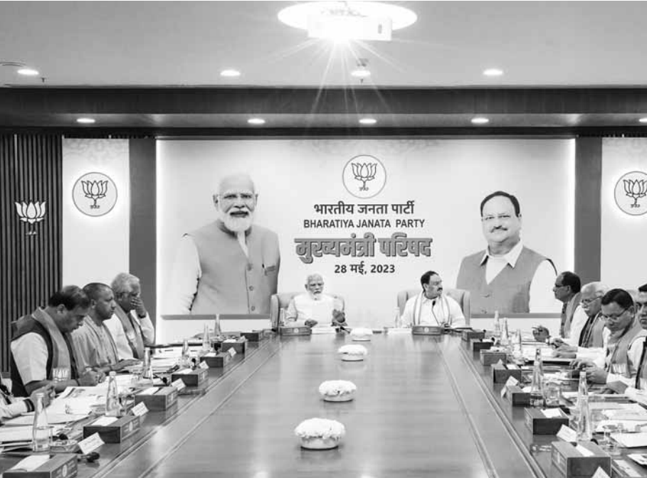
Prime Minister Narendra Modi with BJP National president JP Nadda and others dignitaries during 'Mukhyamantri Parishad' meeting, at BJP headquarters in New Delhi on Sunday