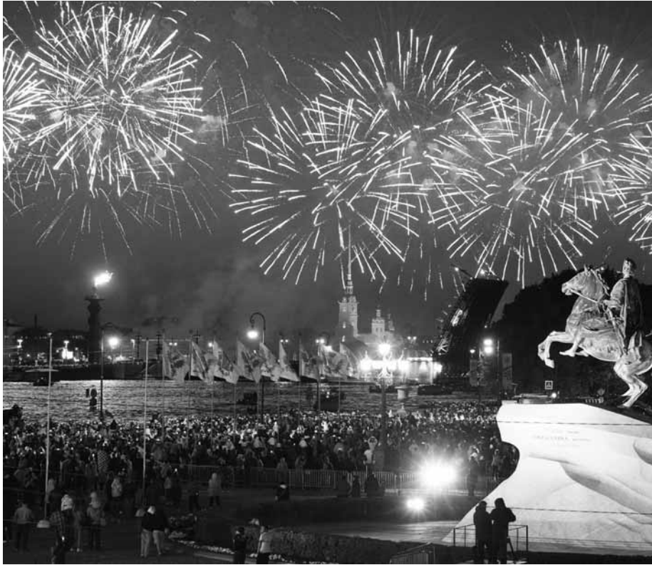
Fireworks explode over the Neva River during celebrations for the 320th anniversary of St. Petersburg, in St. Petersburg, Russia on Sunday. At right is the city’s landmark, the equestrian statue of Russian Tsar Peter the Great, known as the Bronze Horseman.

Kathmandu (PTI): Nepal President Ramchandra Poudel on Sunday pardoned 501 convicts including Tharuhat leader and Nagarik Unmukti Party chief Resham Chaudhary who is serving life imprisonment. Earlier in the morning, a meeting of the Council of Ministers decided to recommend a presidential pardon for 501 jail inmates, including 19 political prisoners, according to the President’s Office. Chaudhary has been serving life imprisonment for brutally killing nine people, including eight policemen, during a riot linked to the Tharuhat movement in the Tikapur area of the Kailali district in 2015. On Friday, President Poudel refused to waive the life sentence of Chaudhary as recommended by the government. Former bureaucrats have expressed concern over the government’s latest move.