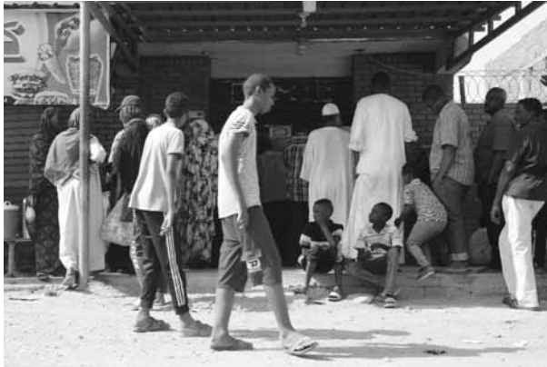
People line up in front of a bakery during a cease-fire in Khartoum, Sudan on Saturday.

In a joint statement early Sunday, the US and Saudi Arabia called for an extension of the current truce which expires at 9.45 pm local time Monday. “While imperfect, an extension nonetheless will facilitate the delivery of urgently needed humanitarian assistance to the Sudanese people,”