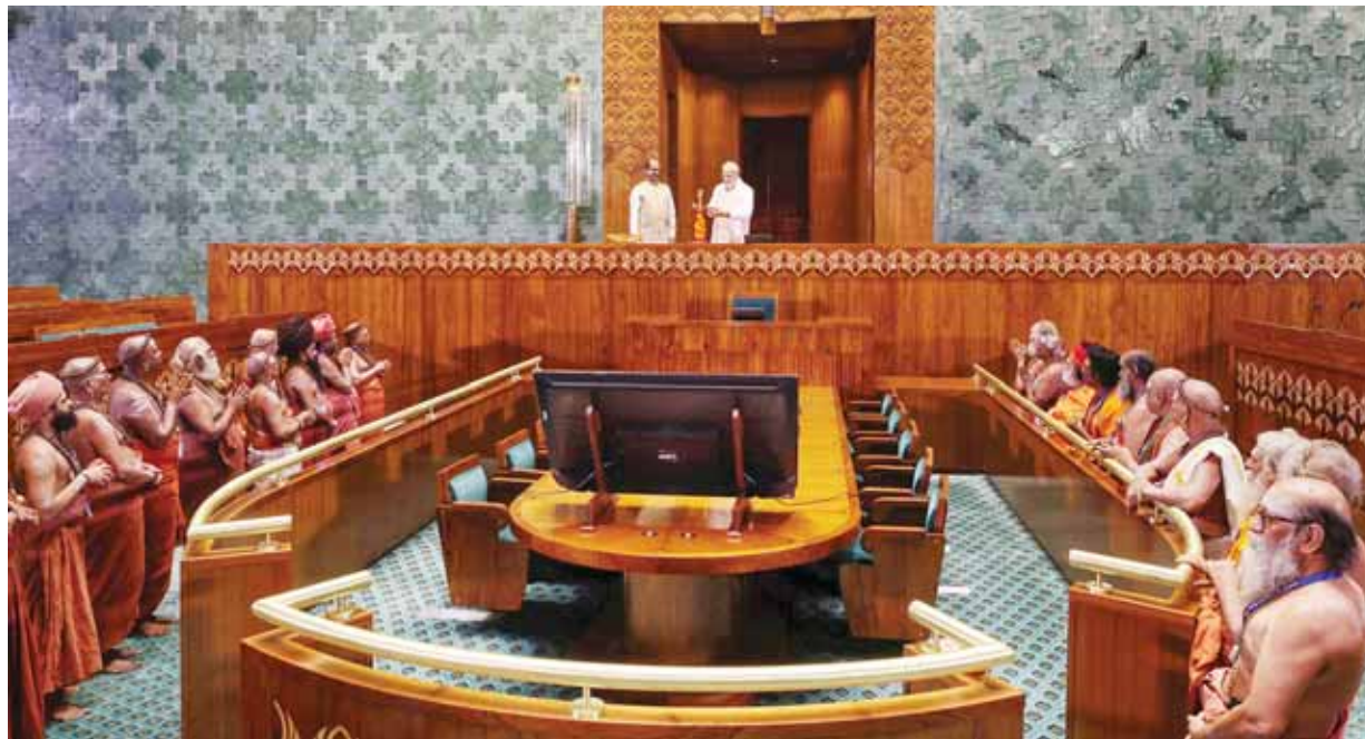
Prime Minister Narendra Modi with Lok Sabha Speaker Om Birla lights a lamp at the inauguration of the new Parliament building, in New Delhi, Sunday

"The new building will become a means of realising the dreams of our freedom fighters and will witness the sunrise of self-reliant India. This new building will see the fulfilment of the resolutions of a developed India", Modi