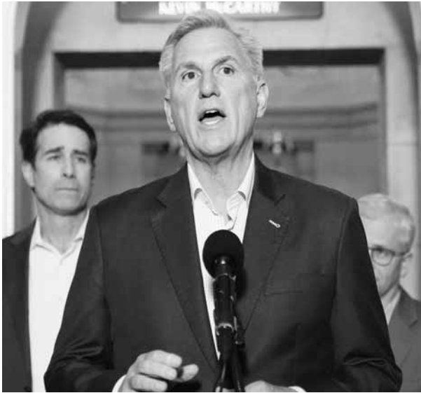
House Speaker Kevin McCarthy of California speaks during a news conference after President Joe Biden and McCarthy reached an “agreement in principle” to resolve the looming debt crisis on Saturday on Capitol Hill in Washington. Rep. Patrick McHenry, R-NC, right, and Rep Garret Graves, R-La., left listen

Biden said the deal was “good news for the American people because it prevents what could have been a catastrophic default and would have led