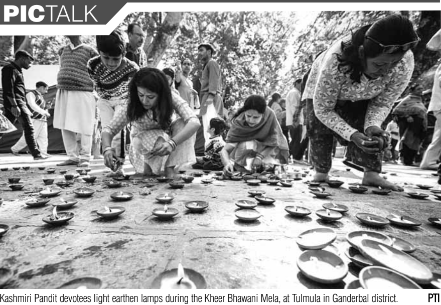
Kashmiri Pandit devotees light earthen lamps during the Kheer Bhawani Mela, at Tulmula in Ganderbal district.

"This is a temple of our democracy that gives a message of India's resolution to the world," he said. "This new Parliament building connects planning to reality, policy to realisation, willpower to execution, and sankalp to siddhi," he added. He went on to say, "India is not only a democratic nation but also the mother of democracy." For, he asserted, democracy is not just a system that is practiced in India but it is a culture, thought and tradition. The roots of democracy in our country, he correctly said, go back to the Vedas and Vaishali in modern Bihar. Parliament has been called the temple of democracy by many people, both from the Government and the Opposition. So, it is the duty of all political parties and leaders to ensure that the sanctity of this temple is upheld by everyone in every circumstance all the time. This temple should not suffer any desecration. It means that business is conducted in both Houses in the best traditions of democracy. Senior leaders should ensure that when an opponent is speaking, he or she is allowed to say whatever they want to, that they are not shouted down. Also, all parliamentarians should respect the chair, speak within the timeframe that is provided to them, and so on. This will strengthen our democracy.