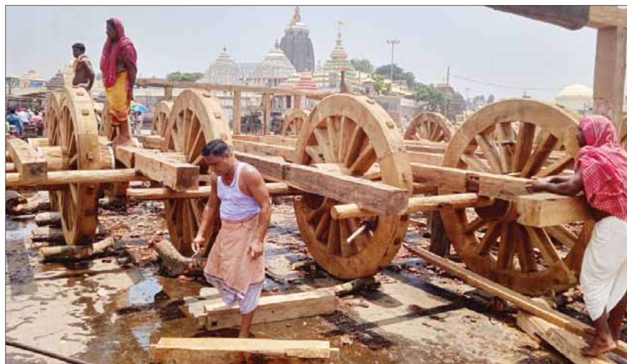
Carpenters are busy constructing the three chariots of Lord Jagannath, Lord Balabhadra and Devi Subhadra for the June 20 Rath Yatra at the Grand Road in Puri on Sunday.

New Delhi: With the new Parliament building inaugurated, the focus now shifts to the construction of the Vice-President Enclave, Common Central Secretariat buildings, Defence Enclave, MPs' chambers, and the Prime Minister's new residence and office. Infrastructure firm Larsen & Toubro Ltd is constructing the Executive Enclave housing the PMO, Cabinet Secretariat, India House and the National Security Council Secretariat at an estimated cost of Rs 1,189 crore.