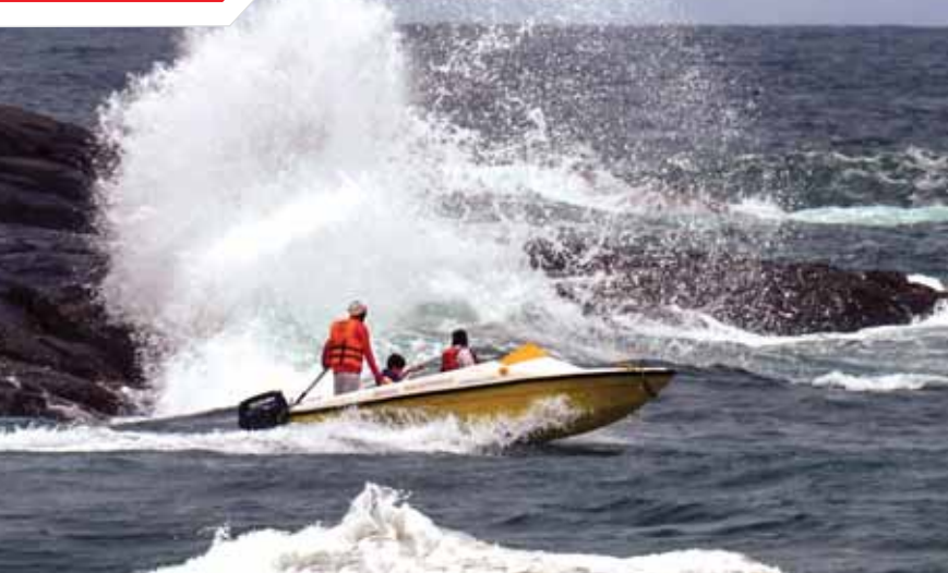
A tourist boat caught in high waves at Eedakkal, in Thiruvananthapuram