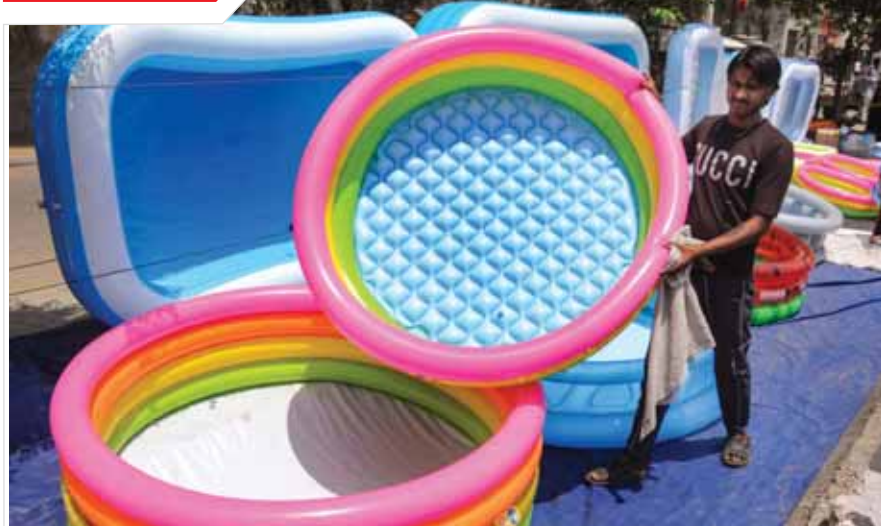
Vendors sell inflatable water pools on a roadside during a hot summer day, in Amritsar.