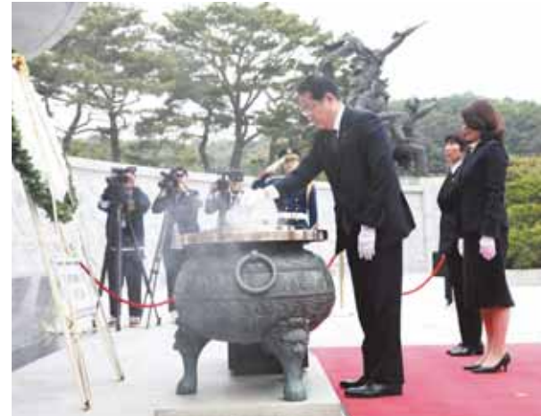
Japanese Prime Minister Fumio Kishida burns incense as his wife Yuko, right, stands during a visit to National Cemetery in Seoul, South Korea on Sunday.

Yoon has faced domestic criticism that he had preemptively made concessions to Tokyo without getting corresponding steps in return. Kishida's statement, which avoided a new, direct apology over the colonization but still sympathised with the Korean victims, suggests he felt pressure to say something to maintain momentum for improved ties.