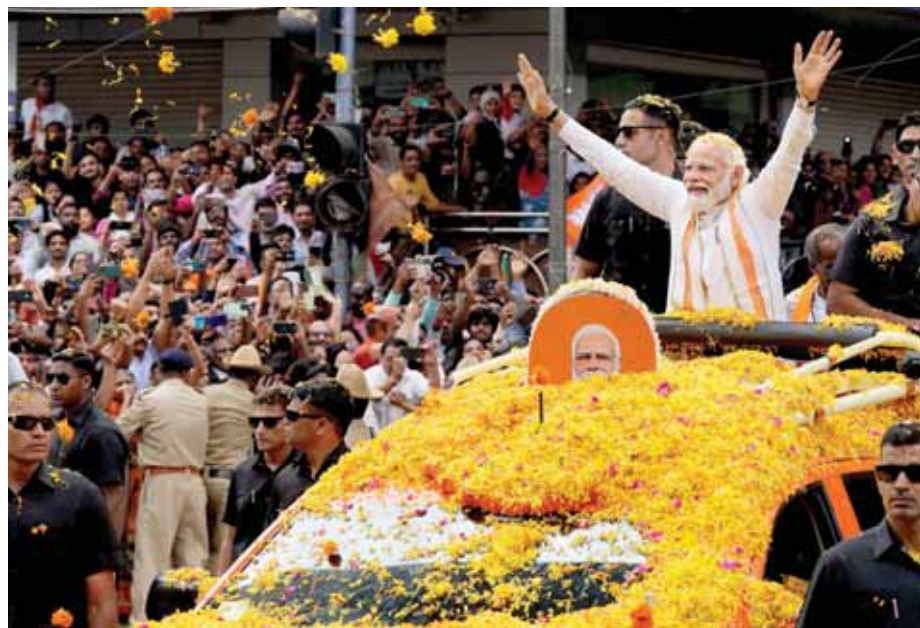
Prime Minister and senior BJP leader Narendra Modi waves at supporters during a roadshow ahead of Karnataka Assembly elections, in Bengaluru, on Sunday

"This election is about creating a new history. This election is about making Karnataka the number one State in the