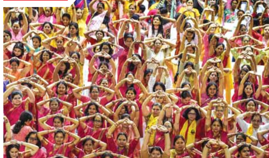
Women perform during 'Yoga Conclave', organised by Patanjali University and Bharat Swabhimani, in New Delhi