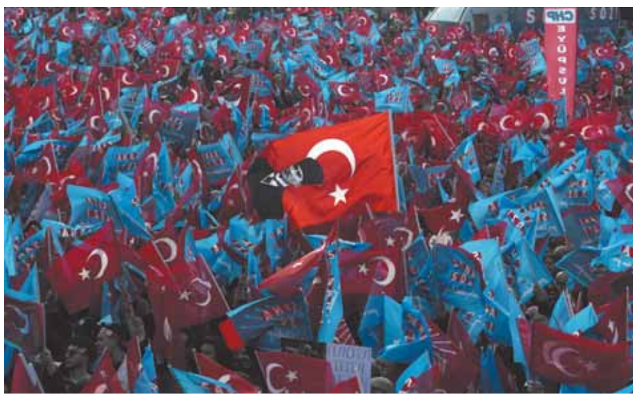
Supporters wave Turkish and CHP party flags during an election campaign rally of the leader and Nation Alliance's presidential candidate Kemal Kilicdaroglu, in Istanbul, Turkey

In their summit in March, Yoon and Kishida agreed to resume leadership-level visits and other talks. In recent weeks, the two countries have also withdrawn the economic retaliatory steps they had earlier taken against each other in previous years when their history row rekindled. Ties between Seoul and Tokyo have long suffered on-again, off-again setbacks over issues stemming from Japan's 1910-45 colonial rule of the Korean Peninsula. The most recent sticking point in their ties was 2018 court rulings in South Korea that ordered two Japanese companies to financially compensate some of their aging former Korean employees for colonial-era forced labour.