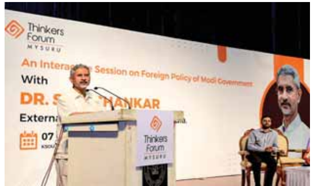
External Affairs Minister S. Jaishankar speaks during an interactive session on 'Foreign Policy of Modi Government', in Mysuru, on Sunday