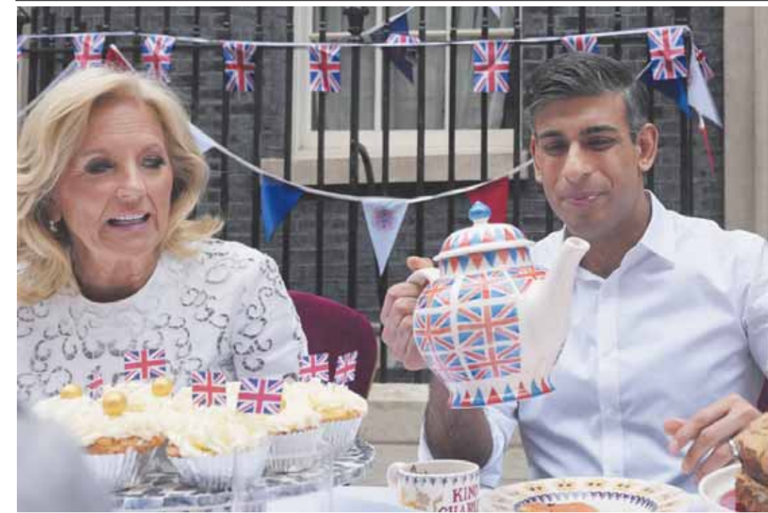
Prime Minister Rishi Sunak holds an oversized tea pot as he goes to pour a cup as he sits next to US First Lady Jill Biden as they attend the Big Lunch party at Downing Street in London on Sunday. The Big Lunch is part of the weekend of celebrations for the coronation of King Charles III. Guests at the big lunch include community heroes and Ukrainians displaced by the war, and youth groups.