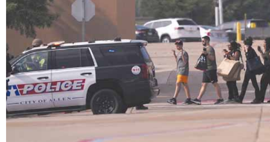
People raise their hands as they leave a shopping center after a shooting on Saturday in Allen, Texas.