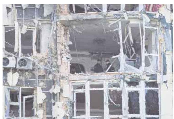
Police inspect an apartment building damaged by a drone, that was shot down during a Russian overnight strike, in Kyiv, Ukraine on Monday. Russian overnight strike, in Kyiv, Ukraine on Monday

ing services have been temporarily barred from the city centre — drivers will not be able to start or finish rides there - amid preparations for the traditional Red Square parade. Initially, only one foreign leader was expected to attend this