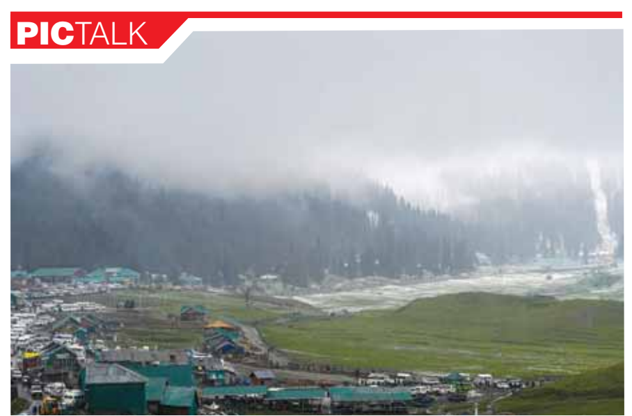
Inseasonal snowfall brought back the winter-like conditions in Kashmir valley

uation seems somewhat incongruous: here is a regime which is committed to fiscal discipline (even the debilitating pandemic and the resultant disruptions didn't result in profligacy), capital expenditure, and lately reforms; and yet it is not able to attract FDI. Perhaps, it was because in its first term the Modi Government was focused on welfare schemes, not bothering too much about augmenting the scale and scope of liberalisation. An illustration: it took the Government more than seven years to privatise Air India which was beyond redemption as a public sector undertaking (PSU). In the last few years, however, the Government has shown a greater inclination to expedite economic reforms, the boldest manifestation of which is privatisation. It not only sold off Air India but also tried to exit big PSUs like BPCL and Shipping Corporation; it has not been able to do so, but that is primarily because of the lack of buyers. Similarly, the Government never fell prey to the pernicious counsel of many people, including economists, to go on a spending spree on this pretext or the other. And then there is the massive spending on infrastructure. All this seems to have impressed global business, investors and financiers that India is a good place to put their money. Hence Apple's newfound interest in the country, and General Atlantic's announcement.