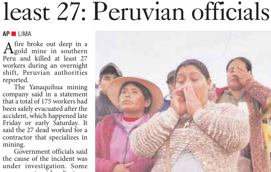
Relatives of trapped miners wait outside the SERMIGOLD mine in Arequipa. Peru. on

sad we are, to lose a husband, leaving two abandoned children," she said. The Public Ministry of Arequipa's Fiscal District said investigators were working to clarify what happened. "During the investigation, the Prosecutor's Office will determine the cause of the