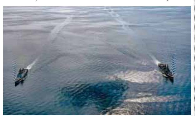
PIONEER NEWS SERVICE NEW DELHI

Move seen as bid to disturb naval drill which India is part of, escalate tension in the region