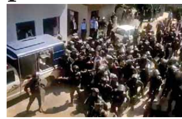
Pakistan's former prime minister and Pakistan Tehreek-e-Insaf chief Imran Khan being arrested by paramilitary Rangers from the Islamabad High Court, where he was present for a hearing of a corruption case, in Islamabad on Tuesday. PTI

Supporters storm Army HQ; HC CJ summons top officials to explain arrest PTI ■ ISLAMABAD/LAHORE