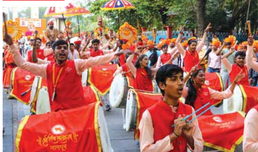
Karni Sena members take part in a procession to celebrate Maharana Pratap Jayanti, in Nagpur