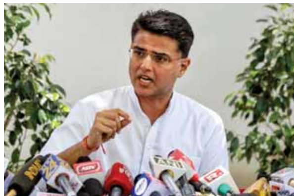
Congress leader Sachin Pilot addresses a press conference at his residence in Jaipur on Tuesday.

Gehlot's leader Raje, not Sonia: Raj ex-Dy CM PNS ■ JAIPUR/NEW DELHI