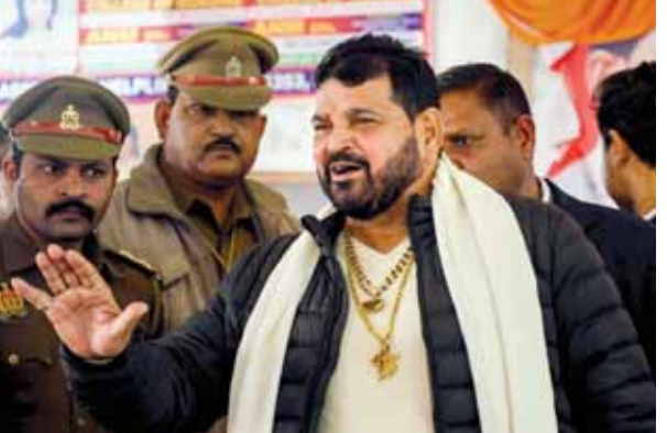
Delhi court on Wednesday sought a status report from the city police by May 12 on the action taken on the FIRs registered against Wrestling Federation of India (WFI) chief and BJP MP Brij Bhushan Sharan Singh over sexual harassment allegations.

The application claimed police have done nothing after registering the FIRs on April 28. "Police are not ready to conduct any inquiry. Not even the statements of the victims have been recorded before the court by the police," said the petitioner. The copies of two FIRs against Singh were also produced in the court in a sealed cover. While one FIR was registered under the POCSO Act for alleged sexual harassment of a minor girl, another was lodged for claimed sexual harassment of the other