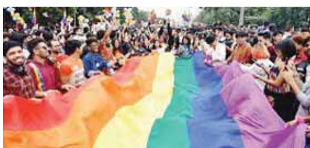
that we have written letters to the State Governments. There are seven responses, I am not reading them, from Manipur, Andhra Pradesh, Uttar Pradesh, Maharashtra, Assam, Sikkim and Rajasthan. I am placing them on record," Mehta told the bench, which also comprised Justices S K Kaul, SR Bhat, Hima Kohli and PS Narasimha, on Wednesday.

"We have examined it and we are opposed to the position the petitioners are taking," the Rajasthan Government said, adding some States oppose that the issue needed a "very intense debate, so they would not be able to respond immediately."