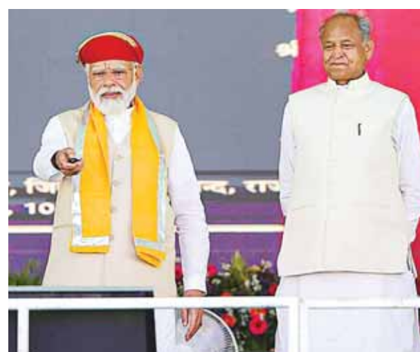
Prime Minister Narendra Modi with Rajasthan Chief Minister Ashok Gehlot during the inauguration and foundation stone laying of various projects, in Nathdwara on Wednesday

"Rajasthan has suffered a lot due to the lack of a futuristic vision for infrastructure in