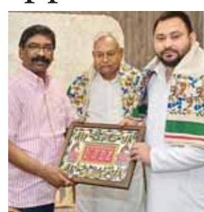
Jharkhand Chief Minister Hemant Soren with Bihar Chief Minister Nitish Kumar and Bihar Deputy Chief Minister Tejashwi Yadav during a meeting, in Ranchi on Wednesday

Nitish, along with his deputy Tejashwi Yadav, held a discussion with Soren for around one hour at the latter's residence. "Our talks centred around forming a united Opposition and the result of the discussion will be visible in the upcoming 2024 Lok Sabha elections," Kumar told reporters