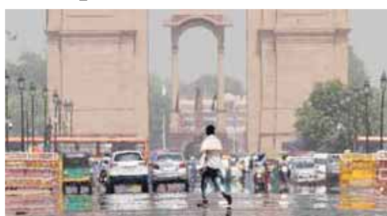
three notches below normal.

Delhi recorded a minimum temperature of 20.9 degrees Celsius on Wednesday and the maximum temperature settled at 36.7 degrees Celsius,