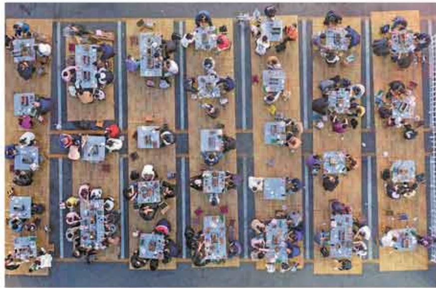
An aerial photo shows customers enjoying barbecue in a market in Zibo, east China's Shandong.