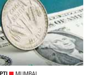
The rupee consolidated in a narrow range and settled for the day higher by 6 paise at 82.00 (provisional) against the US dollar on Wednesday, as investors remained on the sidelines ahead of the crucial US inflation data.

Forex traders said significant foreign fund inflows, a firm trend in domestic equities and easing crude oil prices also supported the local unit.