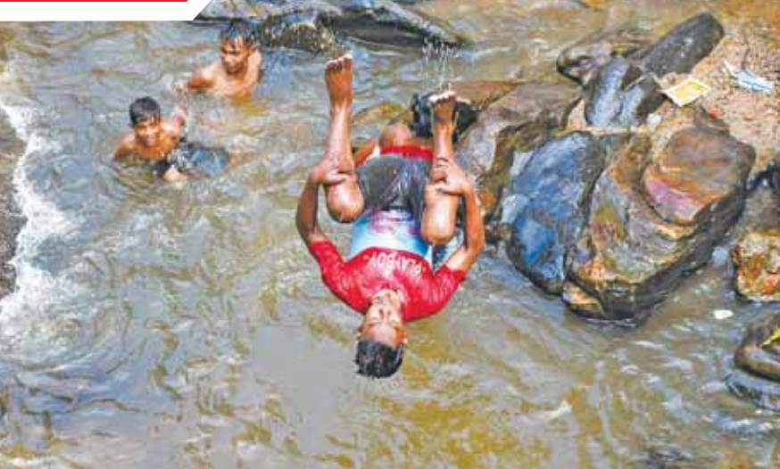
Young men bathe in a water body to beat the heat during a hot summer day, in Guwahati