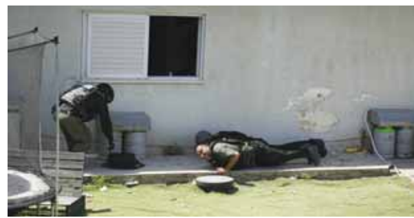
Israeli security forces take cover during an air raid in southern Israel, near the Gaza border, on Wednesday.

Earlier on Wednesday, Israeli aircraft struck targets in Gaza a second straight day on Wednesday, killing at least one Palestinian and pushing the region closer toward a new round of heavy fighting.