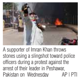
A supporter of Imran Khan throws stones using a slingshot toward police officers during a protest against the arrest of their leader in Peshawar, Pakistan on Wednesday