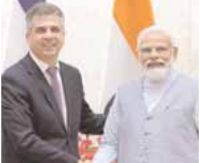
view of Tel Aviv's operation against a militant group in the Gaza Strip. He held bilateral meetings with External Affairs Minister S Jaishankar, Defence Minister Rajnath Singh,

Given the growing ties between the two countries, Prime Minister Narendra Modi on Wednesday said he discussed with visiting Israeli Foreign Minister Eli Cohen ways to further deepen bilateral cooperation in priority areas of agriculture, water, innovation and people-to-people ties. Cohen called on the Prime Minister on Tuesday evening. The Israeli minister arrived Tuesday morning on a three-day visit but announced his decision to cut short the trip in