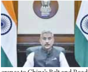
menting connectivity projects came amid growing global concerns over China's BRI.

The call by India and the EU on the need for respecting sovereignty and territorial integrity of countries in imple-