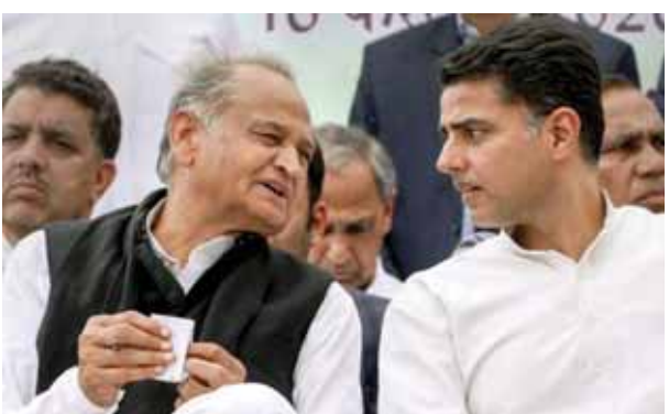
Pilot said, "There is an in-charge for every state in every party and he will take a decision accordingly." To further questions, he said the Rajasthan in-charge of the Congress

On whether there would be any action against Pilot, he