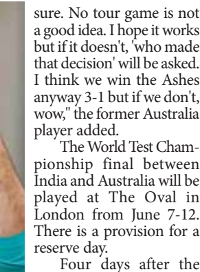
sure. No tour game is not a good idea. I hope it works but if it doesn't, 'who made that decision' will be asked. I think we win the Ashes anyway 3-1 but if we don't, wow," the former Australia player added. The World Test Championship final between India and Australia will be played at The Oval in London from June 7-12. There is a provision for a reserve day. Four days after the WTC final, the first Ashes Test will be played at Edgbaston from June 16. Traditionally, teams touring England play county sides but of late, tour matches are being given a short shrift as cricket schedules around the world get tighter due to the proliferation of T20 leagues. Australia played an internal two-day game before the first Test in 2019, while in 2015 and 2013, the touring side played two four-day games ahead of the Ashes.

PTI ■ SYDNEY Former Australia coach Darren Lehmann has expressed serious reservations over his country not playing tour matches ahead of the World Test Championship final against India and the gruelling Ashes, saying the decision was fraught with risks. Australia did not also play a single tour game in India ahead of the Border-Gavaskar series in February-March, primarily because their board felt that playing practice games on green tops and actual matches on spinning tracks did not serve any purpose. However, Lehmann felt that not playing tour games in foreign conditions is a risky proposition. "You need games to acclimatise first and foremost," Lehmann, who served as Australia coach from 2013 to 2018, told 'SEN Radio'. "To get used to the ball and wickets and pres-