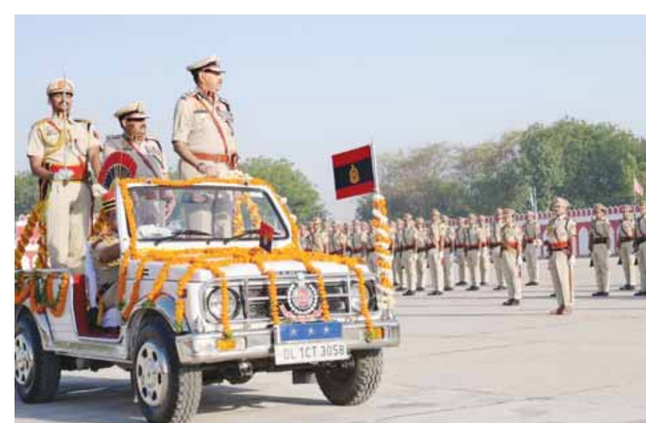
The Delhi Police Commissioner at the Passing Out Parade of 22nd batch of DANIPS at the Parade Ground, Delhi Police Academy, in Jharoda Kalan, New Delhi on Wednesday

Speaking about the government's endeavours, Dr Shelly Oberoi stated that the AAP government remains steadfast in its commitment to transforming Delhi into a garbage-free city. "The increase in the Tehkhand Waste to Energy Plant's capacity exemplifies our dedication to harnessing sustainable practices and converting waste into a valuable resource," she said.