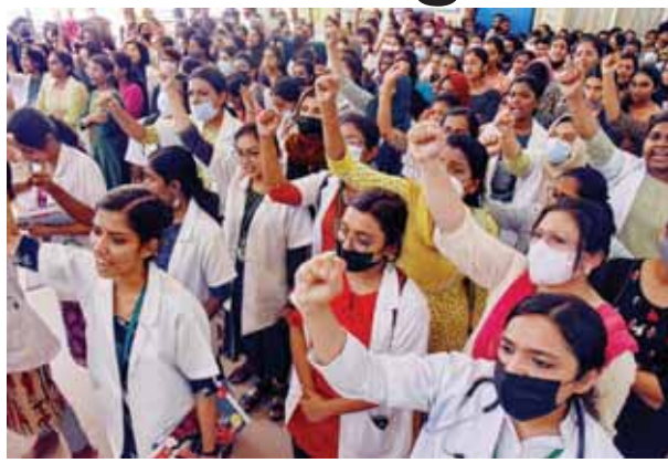
Doctors and medical students raise slogans during their protest against the killing of a female surgeon, at Government Medical College Hospital in Kochi, on Wednesday. The young medic was stabbed to death by a patient at Kottarakkara taluk hospital.