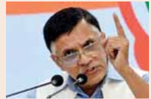
accused for a further period is unavoidable for a thorough probe.

Congress' attack came a day after a special court in Pune extended till May 15 the police custody of Kurulkar after observing that the charges against him were serious and custodial interrogation of the