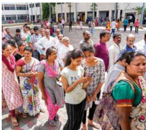
Voters wait their turn at a polling station in Bengaluru on Wednesday

Five out of the seven major exit polls have given a slight edge to the Congress, whereas, two of them have predicted the BJP to emerge as the single-largest party. The aggregate of