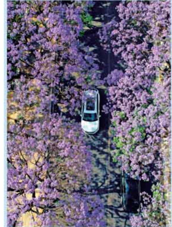
In early May, the jacaranda trees on Jiaochang Middle Road of Kunming, Yunnan are in full bloom. A 1.4-kilometer-long section of the road is lined with 551 blooming jacaranda trees. The blue flowers are like wind-bells swaying gently in the pleasantly warm breeze, attracting both locals and tourists to pose for photos under the trees. (Yunnan Daily)

On May 19, the launch ceremony for China Tourism Day will be held in Heshun ancient town in Tengchong. A series of activities will take place from May 19 to 21 including a tourism product exhibition, a Baoshan intangible cultural heritage tourism exhibition and a tourism high-quality development forum. (China Daily)