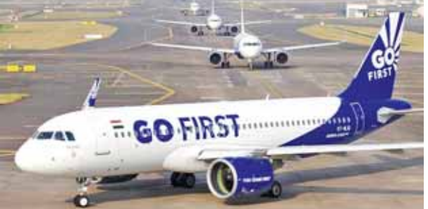
Following this moratorium, Go First is now protected from all suits or continuation of pending suits or proceedings against it, including the execution of any judgment, decree or order in any court of law, tribunal, or arbitration panel till the completion of the insolvency proceedings.

NCLT has also provided protection to the debt-ridden carrier by declaring a moratorium as per the provisions of IBC.