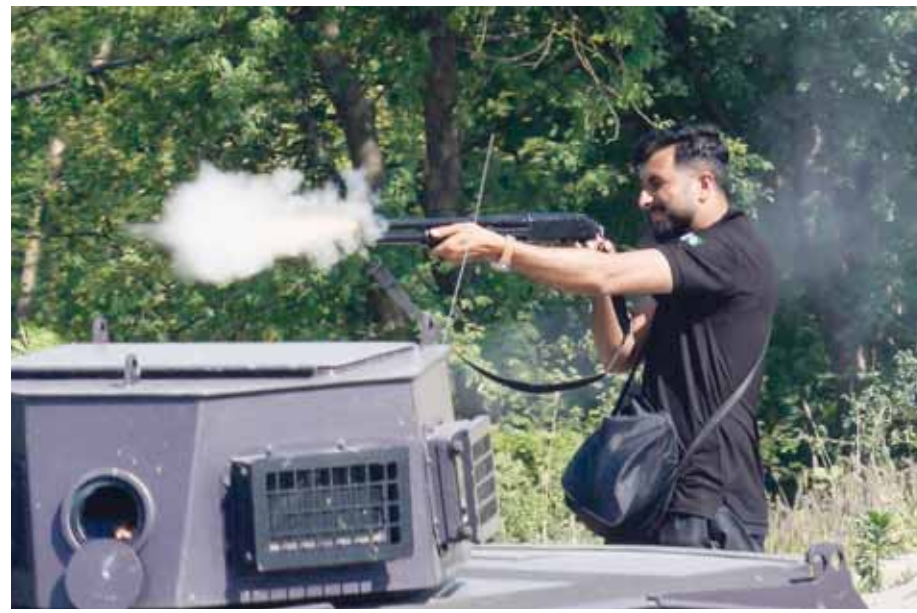
A Police officer fires a repeater rifle during clashes with supporters of Pakistan's former Prime Minister Imran Khan, in Islamabad, Pakistan on Wednesday.

The decision was taken by the interior ministry at the request of the Punjab government, according to a notification issued by the federal government. "The exact numbers of troops/assets, date and area of deployment will be worked out by the provincial government in consultation" with the army headquarters, according to the notification.