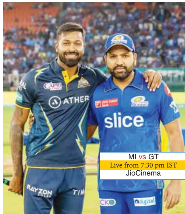
MI vs GT Live from 7:30 pm IST JioCinema

MI's bowling did well against RCB to stop their charge in the middle-overs, but GT are not grappling with the issue of not having in-form batters lower