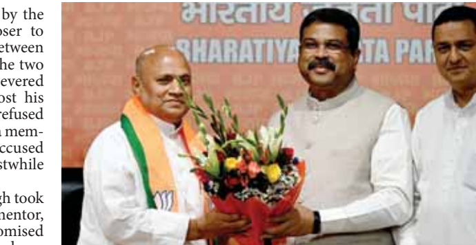
Former JD(U) leader Ramchandra Prasad joins Bharatiya Janata Party (BJP) in the presence of Union Minister Dharmendra Pradhan at the BJP HQ in New Delhi on Thursday

Singh who was a JDU's nominee in the Modi-cabinet had a fallout with Kumar last year after he was seen by the JD(U) to be moving closer to the BJP as differences between the two parties grew. The two outfits subsequently severed their alliance. Singh lost his portfolio after the JDU refused to renew his Rajya Sabha membership and was later accused of corruption by his erstwhile party.