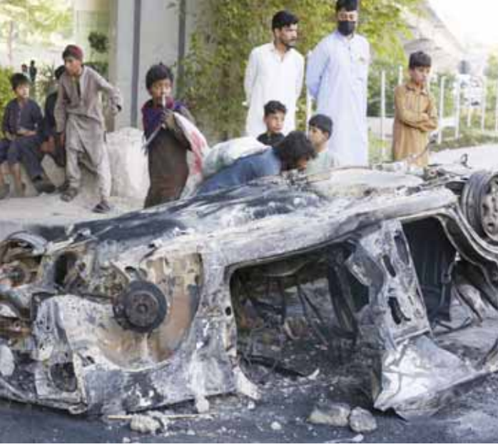
People look at a car burnt in Wednesday's clashes between police and the supporters of Pakistan's former Prime Minister Imran Khan, at a road, in Peshawar, Pakistan on Thursday.

country's capital Islamabad, as well as in Punjab, Khyber Pakhtunkhwa and Balochistan provinces to maintain law and order. According to reports, Lahore and Peshawar faced the worst situation with incidents of arson and firings. "The loss of human lives as an aftermath is heart-wrenching, regrettable, unfortunate & highly condemnable," Alvi's tweet read. Acknowledging protests to be every citizen's constitutional right, he said that it should "always remain within the bounds of the law." "The way some miscreants have damaged public property, particularly government and military buildings, is condemnable. We must re-think & look for political solutions, rather than coercion & arrests. I have conveyed my concerns to the political & military leadership & am hopeful that the situation can improve," the tweet added. "I strongly appeal to all citizens of the country to remain peaceful," the tweet concluded. Pakistan's former foreign minister Shah Mehmood Qureshi, a close aide of ousted prime minister Imran Khan was also arrested on Thursday.