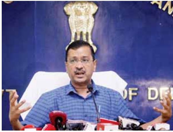
Delhi Chief Minister Arvind Kejriwal addresses the media at the Delhi Secretariat after the Supreme Court's ruling on the regulation of services matter in New Delhi on Thursday

Frustrated with his government's lack of control over the civil services, Chief Minister