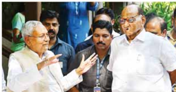
Bihar Chief Minister Nitish Kumar meets NCP chief Sharad Pawar in Mumbai, on Thursday.

Bihar Chief Minister Nitish Kumar and JD (U) President Nitish Kumar said here Thursday that he would be more than delighted if NCP chief Sharad Pawar became the main face of the grand Opposition alliance to take on the ruling BJP in the 2024 Lok Sabha polls. On a day when Nitish-accompanied by his deputy and Rashtriya Janata Dal founder Lalu Prasad Yadav's son Tejashwi Yadav - called on the NCP chief and Maharashtra's former Chief Minister and Shiv Sena (UBT) president Uddhav Thackeray, Nitish threw his weight behind Pawar over the choice of the Opposition's grand alliance's face for the 2024 Lok Sabha polls. Queried if he saw the Opposition alliance's face in