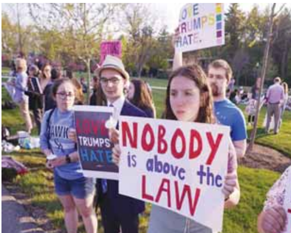
People protest outside a building on the campus of Saint Anselm College where a CNN televised town hall gathering with former President Donald Trump will be held, Wednesday in Manchester.

expand his appeal among the moderates and independents who soured on him in 2020 and will be crucial to winning the general election. Indeed, Trump on Wednesday repeatedly doubled down on his lies that the 2020 election had been "rigged," even though state and federal election officials, his own campaign and White House aides, and dozens of courts, including Republican judges, have said there is no evidence to support his claims. He also displayed no remorse for what happened on Jan. 6, when a mob of his supporters violently stormed the Capitol in a bid to halt the certification of Biden's win. He excused his delayed response that day — he was silent for