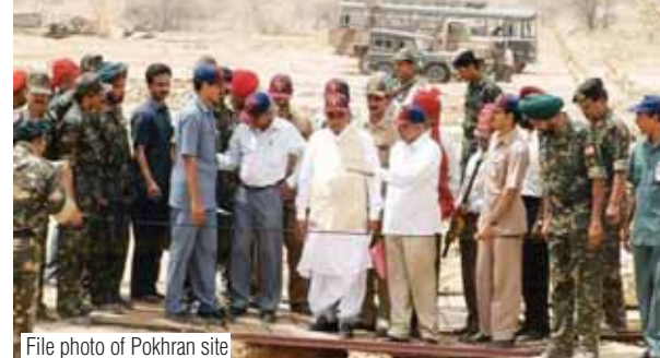
File photo of Pokhran site

Hailing the 1998 nuclear tests on May 11 in Pokhran during the Atal Bihari Vajpayee regime, Prime Minister Narendra Modi on Thursday said it was one of the most glorious days in India's history. He also asserted that technology for the country is not about showing its dominance but a tool to speed up its development. On this occasion, the Prime Minister laid the foundation stone and dedicated to the