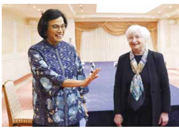
US Treasury Secretary Janet Yellen, right, talks with Indonesia's Finance Minister Sri Mulyani Indrawati during their bilateral talks on the sideline of the G7 Finance Ministers and Central Bank Governors' meeting, in Niigata, Japan, on Thursday

The financial leaders of the Group of Seven wealthy nations meet in Japan beginning Thursday as a standoff over the US debt ceiling and potential default looms as one of the biggest potential threats to the global economy. Treasury Secretary Janet Yellen said one of her priorities in Niigata, a port city on the Japan Sea coast, would be to emphasize the importance of resolving the standoff over the national debt in the world's largest economy. "A default is frankly unthinkable," she told reporters before the broader meetings began. "America should never default. It would rank as a catastrophe," she said. The impasse over spending risks leaving the government unable to pay for teachers in classrooms, medical care for veterans and vital benefits to many Americans, she said. It also is undermining U.S. economic leadership. While in Japan, Yellen also is bound to be seeking to reassure her counterparts over recent bank failures that have