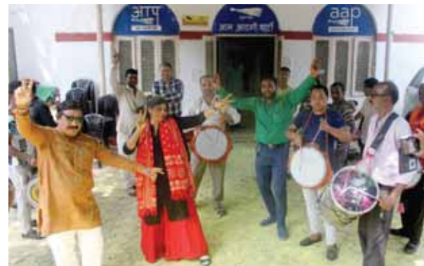
AAP leaders and supporters celebrate outside the Delhi Secretariat after the Supreme Court's ruling on the regulation of services matters in New Delhi on Thursday.