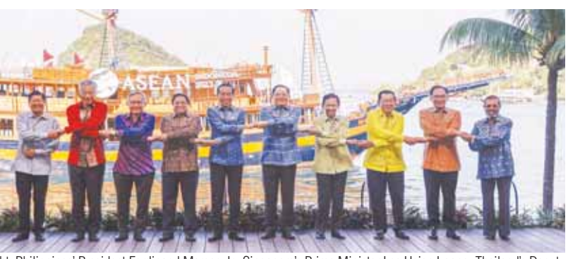
From left to right, Philippines' President Ferdinand Marcos Jr., Singapore's Prime Minister Lee Hsien Loong, Thailand's Deputy Prime Minister and Foreign Minister Don Pramudwinai, Vietnam's Prime Minister Pham Minh Chinh, Indonesia's President Joko Widodo, Laotian Prime Minister Sonexay Siphandone, Brunei's Sultan Hassanali Bolkiah, Cambodia's Prime Minister Hun Sen, Malaysia's Prime Minister Anwar Ibrahim and East Timor's Prime Minister Taur Matan Ruak hold hands for a family photo ahead of the retreat session at the 42nd ASEAN Summit in Labuan Bajo, East Nusa Tenggara province, Indonesia ONThursday.

AP ■ LABUAN BAJO Indonesian President Joko Widodo somberly acknowledged to fellow Southeast Asian leaders on Thursday that no progress has been made to end the civil strife gripping Myanmar and renewed a call for an end to the violence, including a recent airstrike a rights group called an "apparent war crime." "I have to be honest," Widodo told fellow leaders of the Association of Southeast Asian Nations on the final day of their two-day summit in the Indonesian harbour town of Labuan Bajo. "There has been no significant progress in the implementation of the five-point consensus."