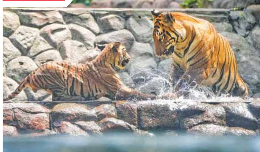
Royal Bengal tigers on the first day of their public viewing at Byculla zoo, in Mumbai