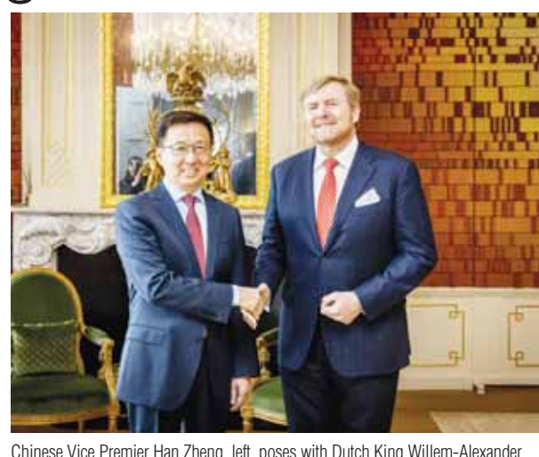
Chinese Vice Premier Han Zheng, left, poses with Dutch King Willem-Alexander prior to a meeting in The Hague, Netherlands on Thursday

China continues its diplomatic push in Europe on Thursday with a high-level visit to the Netherlands where Vice President Han Zheng will be meeting the king and the prime minister — and facing questions about its relations with Russia and the European Union. The 27-nation EU increasingly sees Beijing as a systemic rival on the global stage instead of an ally and economic partner. Dutch King Willem Alexander received Han early on Thursday before Prime Minister Mark Rutte has political talks with the vice president in the afternoon. Chinese Foreign Minister Qin Gang has also travelled through Western Europe this week, meeting with his German and French counterparts. On Wednesday, German Foreign Minister Annalena Baerbock said that Berlin wants to work in partnership with China "everywhere it's possible" but that it would be naive to ignore the risk of end-