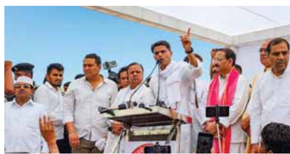
Congress leader Sachin Pilot during his Jan Sangharsh Yatra in Ajmer, on Thursday.