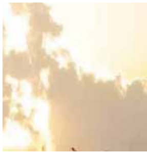
temperatures above 43 degrees on Thursday.

While Patan city was the hottest with the mercury touching 45.4 degrees Celsius, at least 12 other places in the state recorded maximum tem-