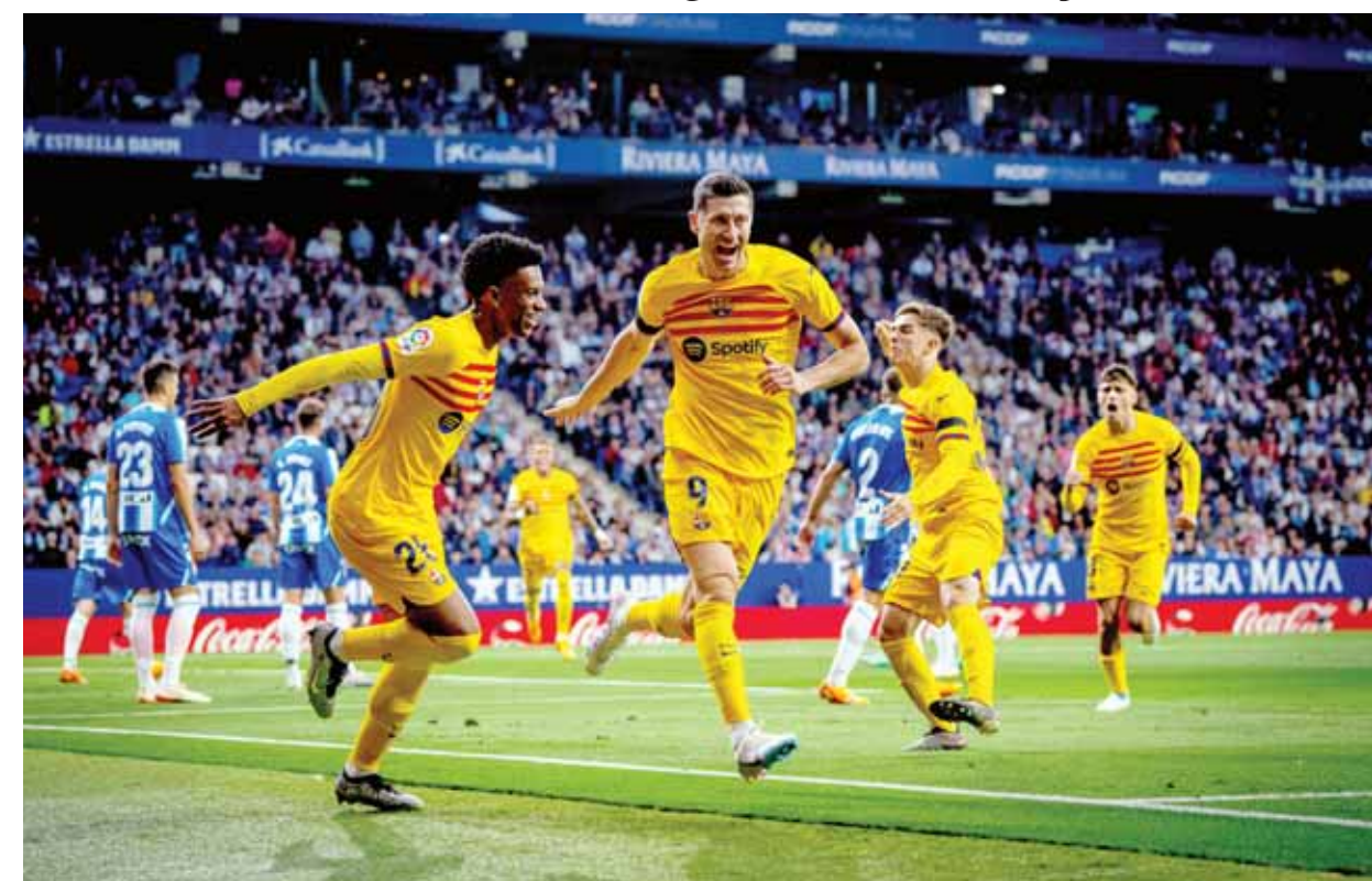
BARCELONA

Barcelona seal first La Liga title in four years with Espanyol rout