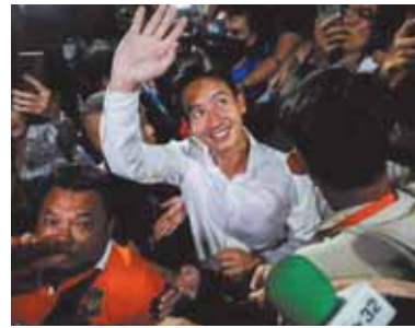
The Move Forward Party leader and prime ministerial candidate, Pita Limjaroenrat, waves to the crowd during the General Election in Bangkok, Thailand, on Saturday.