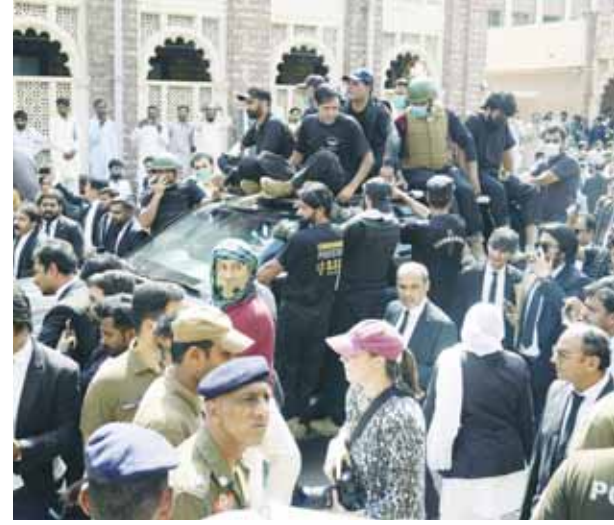
Security escort a vehicle carrying Pakistan's former Prime Minister Imran Khan and his wife Bushra Bibi after their court appearance, in Lahore on Monday.

In a series of tweets in the early hours of Monday, the Pakistan Tehreek-e-Insaf (PTI) chief said: "So now the complete London plan is out. Using the pretext of violence while I was inside the jail, they assumed the role of judge, jury and executioner. The plan now is to humiliate me by