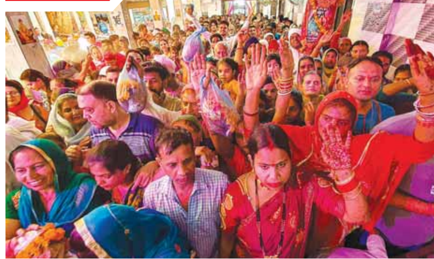
Hindu devotees offer prayers at Bhadrakali temple, in Amritsar