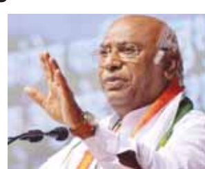
for the elections.

"That the respondent issued an election manifesto before the State of Karnataka