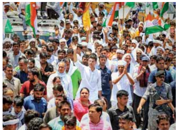
Congress leader Sachin Pilot with supporters during his 'Jan Sangharsh Yatra' in Jaipur on Monday

Flanked by at least 14 other Congress MLAs at a rally here on Monday, the former Deputy CM who has not been on good terms with his party's heavy-weight Gehlot served notice to the CM to either agree to their