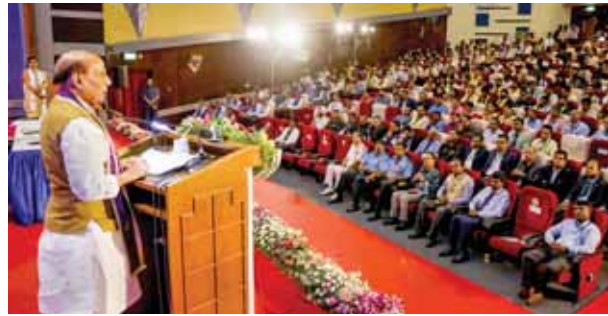
Defence Minister Rajnath Singh speaks during the 12th convocation ceremony of Defence Institute of Advanced Technology (DIAT), in Pune on Monday

"If our adversary possesses more advanced technologies, it can be a cause of concern for us in the future. There is an urgent need to move fast towards technological advancements in line with the changing times. This responsibility lies with our institutions.