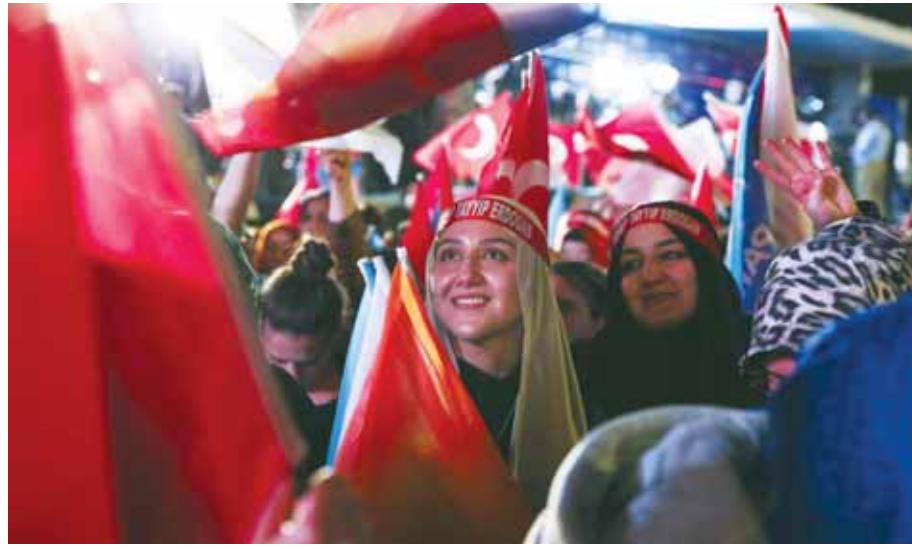
Supporters of Turkish President Recep Tayyip Erdogan wave flags outside the party headquarters in Ankara, Turkey, Sunday. Erdogan, who has ruled his country with an increasingly firm grip for 20 years, was locked in a tight election race Sunday, with a make-or-break runoff against his chief challenger possible as the final votes were counted.

In a bid to woo voters hit hard by inflation, he increased