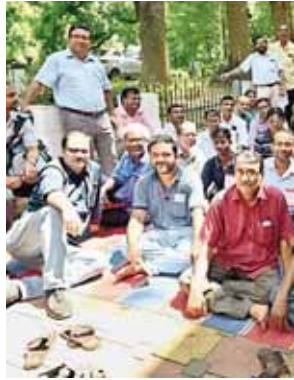
indefinite cease work should their demand of 33 per cent DA hike not be met by the State Government.