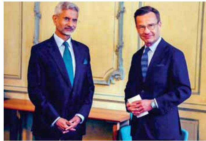
External Affairs Minister S. Jaishankar meets Prime Minister of Sweden Ulf Kristersson, on Monday

From Sweden, Jaishankar will head to Brussels for the first meeting of the India-EU Trade and