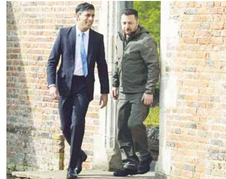
LONDON

British Prime Minister Rishi Sunak on Monday laid out a warm welcome for Ukrainian President Volodymyr Zelenskyy on a surprise visit to the UK and reiterated his support for the war-torn European nation by offering further military support, including air defence missiles and armed drones.