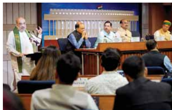
Union Home Minister Amit Shah addresses during the inauguration of a training program on legislative drafting for State and Central Government officials, in New Delhi on Monday. Lok Sabha Speaker Om Birla and Union Ministers Pralhad Joshi and Arjun Ram Meghwal are also seen

Shah said India is not only the biggest democracy, but the idea of democracy also emerged from India. From the