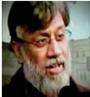
File photo of Pakistani-origin Canadian businessman and 2008 Mumbai terror accused Tahawwur Rana.

PIONEER NEWS SERVICE/AGENCIES ■ NEW DELHI/NEW YORK In a major breakthrough for India to bring perpetrators of the 2008 Mumbai terror attacks to justice, a US court in California has approved the extradition of Pakistani-origin Canadian businessman Tahawwur Rana to India. He is sought for his involvement in the terrorist incident, in which 166 people, including six Americans, were killed. Reacting to the development, Foreign Secretary Vinay Kwatra said here on Thursday, "We are in very regular touch with the US authorities to ensure that there is speedy and early extradition of Tahawwur Rana. We have all seen the judgment that was given by the local US court there. That conversation of ours with the US side is continuing." India had filed a complaint on June 10, 2020, seek-