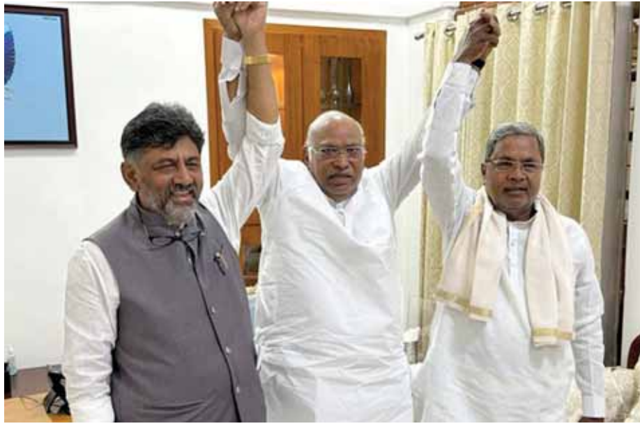
Congress president Mallikarjun Kharge with Karnataka CM-designate Siddaramaiah and Deputy CM-designate DK Shivakumar during a meeting in New Delhi on Thursday.

PNS ■ NEW DELHI/BENGALURU The Congress on Thursday finally announced the name of K Siddaramaiah as the next Chief Minister of Karnataka and State party president DK Shivakumar as his "only" deputy, who along with a few Cabinet members would take oath on Saturday which again is to be orchestrated to exhibit a show of Opposition solidarity. Siddaramaiah met Governor Thawarchand Gehlot to stake claim to form a government shortly after the eight-time MLA was formally elected the leader of the Congress Legislature Party (CLP) in Karnataka at a meeting of the newly elected party MLAs at Indira Gandhi Bhavan in Bengaluru on Thursday night. Announcing the decision taken by Congress president Mallikarjun Kharge after hectic parleys ever since the party emerged victorious last Saturday, AICC general secretary (Organisation) KC Venugopal said the party has chosen Siddaramaiah as the Chief Minister of Karnataka and DK Shivakumar will be the only Deputy Chief Minister. Shivakumar will also continue