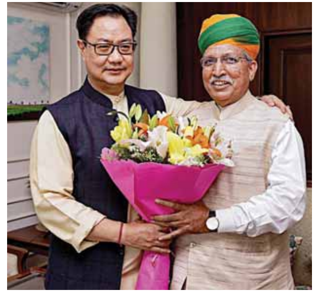
Union Ministers Kiren Rijiju and Arjun Ram Meghwal during a meeting in New Delhi on Thursday.

In a surprise move, Prime Minister Narendra Modi on Thursday shifted Kiren Rijiju from the Law Ministry and assigned him a "low-key" Ministry of Earth Sciences with Arjun Ram Meghwal, the Minister of State for Parliamentary Affairs and Culture, taking over the key Law and Justice Ministry. Several eyebrows were raised on the unexpected reshuffle as Rijiju was, for long, seen to be a Modi-confidant and also one of the Government's high-profile troubleshooters from the North-East — a priority region for the BJP. The change has come after Rijiju had instances of several run-ins with the judiciary with by taking a "confrontist approach" and voicing his apparently contrarian view vis-a-vis those held by the higher judiciary. The major change has