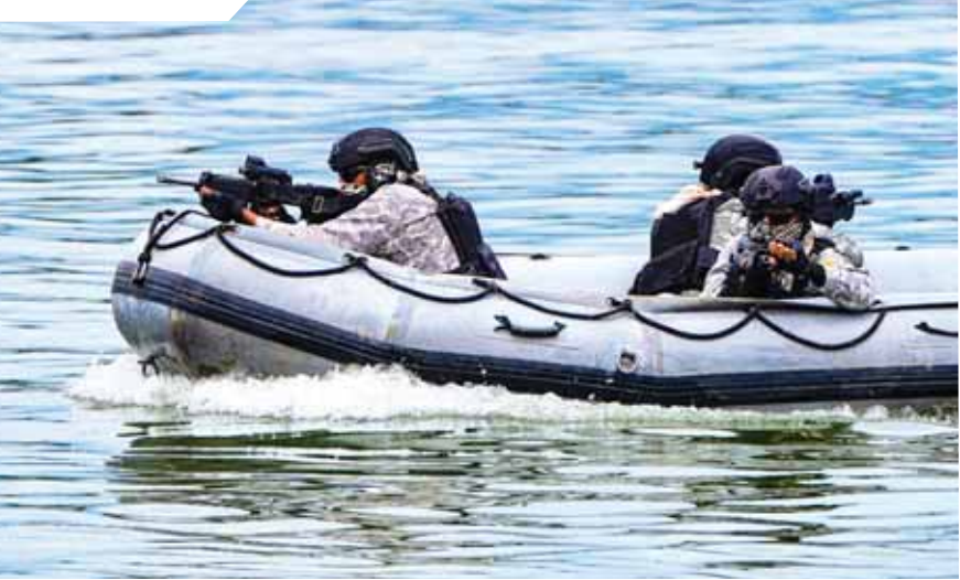
Marine Commandos, the Special Forces unit of the Indian Navy, patrol the Dal Lake, in Srinagar.