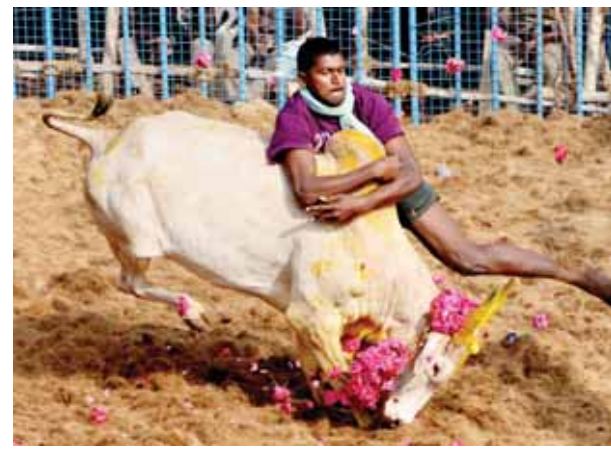
In this Jan 21, 2022, file photo, a participant during the Jallikattu competition, in Coimbatore.