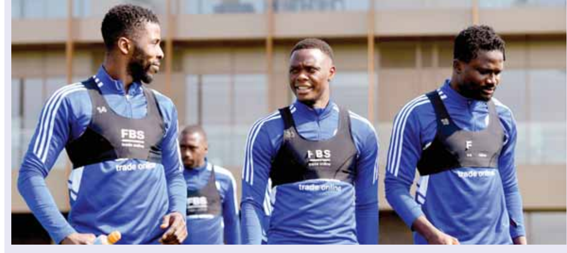
LEICESTER

Seven years ago, Leicester lifted the Premier League trophy. Now they are on the brink of relegation from the top-flight after a miserable season. The Foxes, who drew 0-0 at