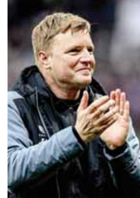
■ NEWCASTLE

Howe, who has been praised for his signings, said there would be no wild spending as he once again looks for astute acquisitions. "I think we've been really, really good in the three transfer windows so far since I've been here," he told reporters. "The challenge gets harder and more difficult because, now we've become a better team, there are fewer players who would make us better, so it's going to be a big window for us. "It won't be huge numbers — I don't think it can be. We don't have the ability to spend the money that people will think we have, so we're going to have to be smart. "It will be a small group of players, but hopefully ones that can make the difference."