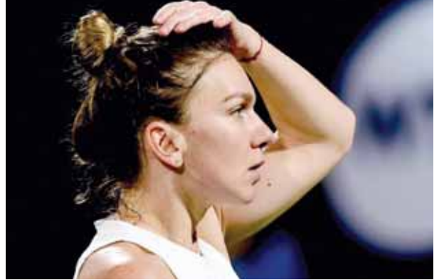
■ LONDON

Former world No. 1 and two-time grand slam winner Serena Williams has accused the International Tennis Integrity Agency (ITIA) of double standards while dealing with the charge of irregularities it has levelled on her in connection with her Athlete Biological Passport (ABP). The 31-year-old Romanian, winner of the French Open and Wimbledon singles titles, has been accused of a second doping offense by the ITIA for alleged discrepancies in her ABP. The latest ITIA charge announced on Friday last is "separate and in addition to" the provisional suspension Halep received last year after failing a drug test during the US Open, the ITIA said. Halep alleged on Monday that while the ITIA was stating on one hand that it wanted to