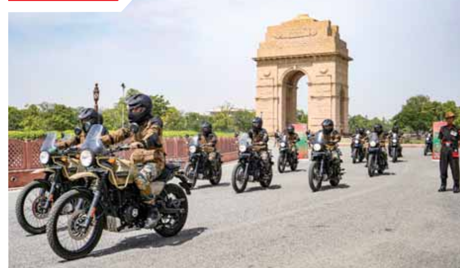
Indian Army regiment Ladakh Scouts' team leaves for the motorcycling expedition 'Vanquish' from New Delhi