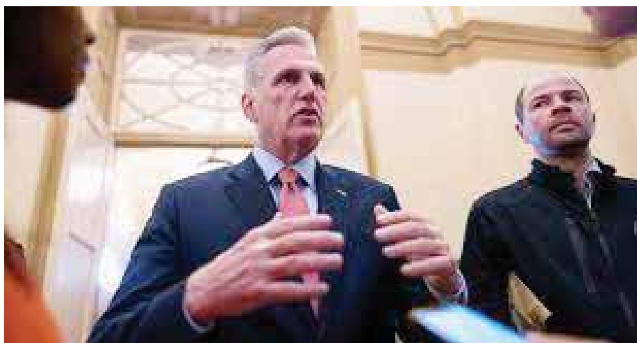
Speaker Kevin McCarthy addressing mediapersons

until Tuesday, just two days from June 1, when Treasury Secretary Janet Yellen has said the US could start running out of cash to pay its bills and face a federal default.