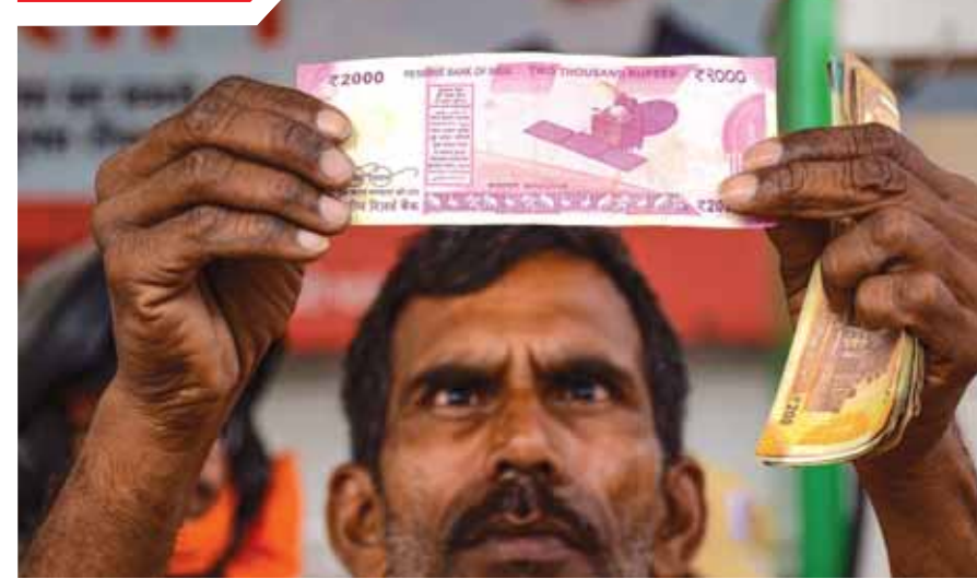
An employee checks Rs 2000 currency notes given by customers at a petrol pump in Gurugram