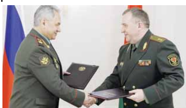
Russian Defense Minister Sergei Shoigu, left, and Belarusian Defense Minister Viktor Khrenin exchange documents on Thursday

Russia and Belarus signed a deal on Thursday formalising the procedure for deploying Russian nuclear weapons on Belarusian territory. Control of the weapons will remain with Moscow.