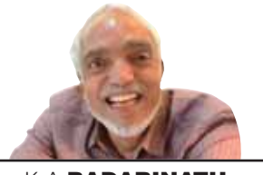
K A BADARINATH

Even if the US revises its debt ceiling of $31.4 trillion, its risk-ridden economy may precipitate a global crisis of a larger magnitude