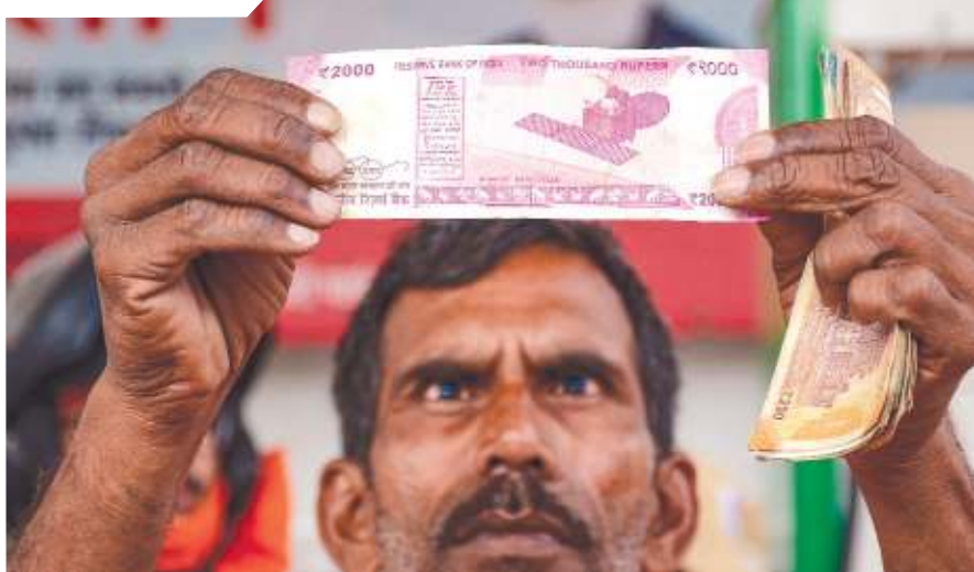
An employee checks Rs 2000 currency notes given by customers at a petrol pump in Gurugram