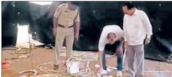
Officials of the Directorate of Revenue Intelligence searching poultry farm where a biggest haul of narcotics was discovered near Vattem village in Nagarkurnool district

Though the poultry farm was located at a stone's throw from the Excise office, the officials failed to bust the racket which was run uninterrupted for six years. The Central Agency, DRI, acting on a credible tip-off, raided the