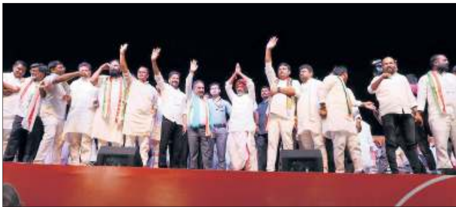
Congress leaders at a public in Jadcherla in Mahabubnagar on Thursday

Sukhvinder Singh Sukhu expressed his solidarity with the government employees