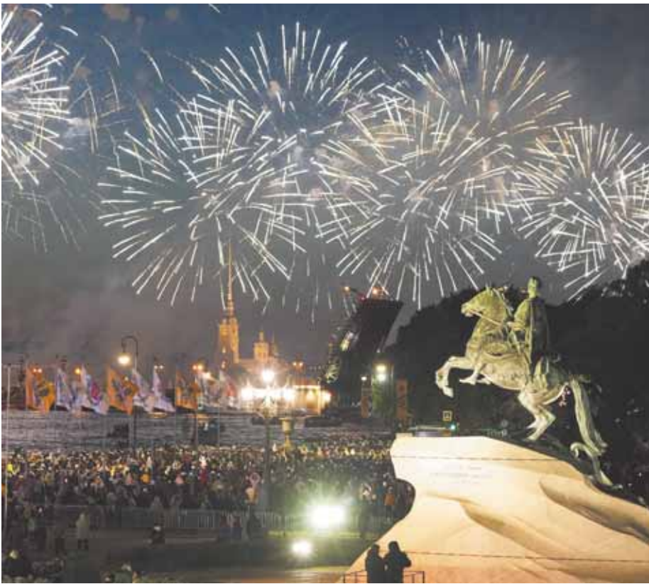
Fireworks explode over the Neva River during celebrations for the 320th anniversary of St. Petersburg, in St. Petersburg, Russia on Sunday. At right is the city's landmark, the equestrian statue of Russian Tsar Peter the Great, known as the Bronze Horseman.

Fighting was also reported in al-Fasher, the provincial capital of North Darfur.