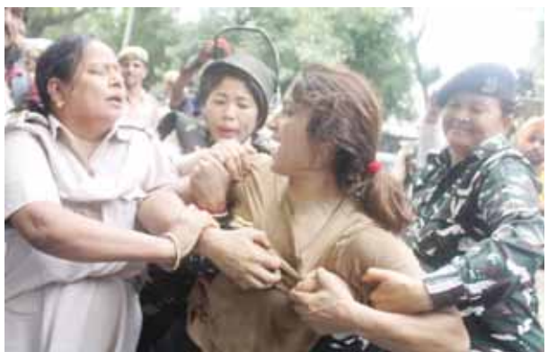
Security personnel detain wrestler Vinesh Phogat during wrestlers' protest march towards new Parliament building, in New Delhi on Sunday.

Later in the evening, the Delhi Police booked the organisers of the wrestlers' protest at Jantar Mantar and their supporters on charges of rioting and obstructing public servant in discharge of duty. The police said 700 people were detained across Delhi, including 109 protesters at Jantar Mantar. According to a senior police officer, the FIR has been registered under Sections 188 (disobedience to order duly