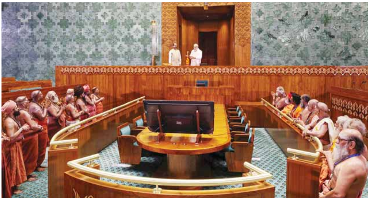
Prime Minister Narendra Modi with Lok Sabha Speaker Om Birla lights a lamp at the inauguration of the new Parliament building, in New Delhi, Sunday

"The new building will become a means of realising the dreams of our freedom fighters and will witness the sunrise of self-reliant India. This new building will see the fulfilment of the resolutions of a developed India", Modi announced amid