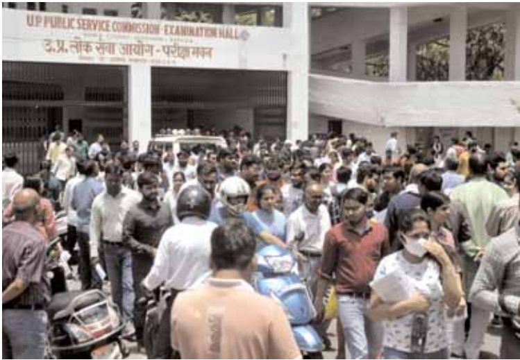
Candidates coming out of UP PSC examination hall after taking prelims on Sunday