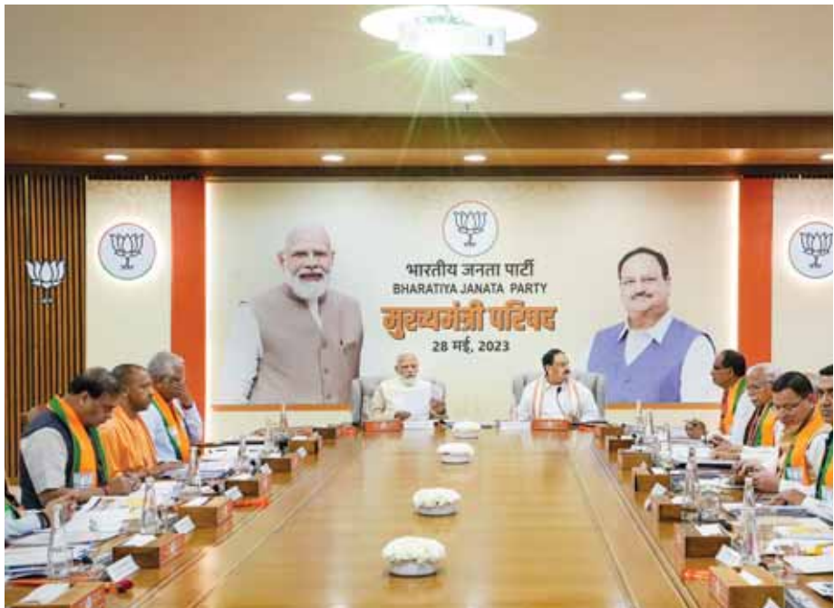
Prime Minister Narendra Modi with BJP National president JP Nadda and others dignitaries during 'Mukhyamantri Parishad' meeting, at BJP headquarters in New Delhi on Sunday