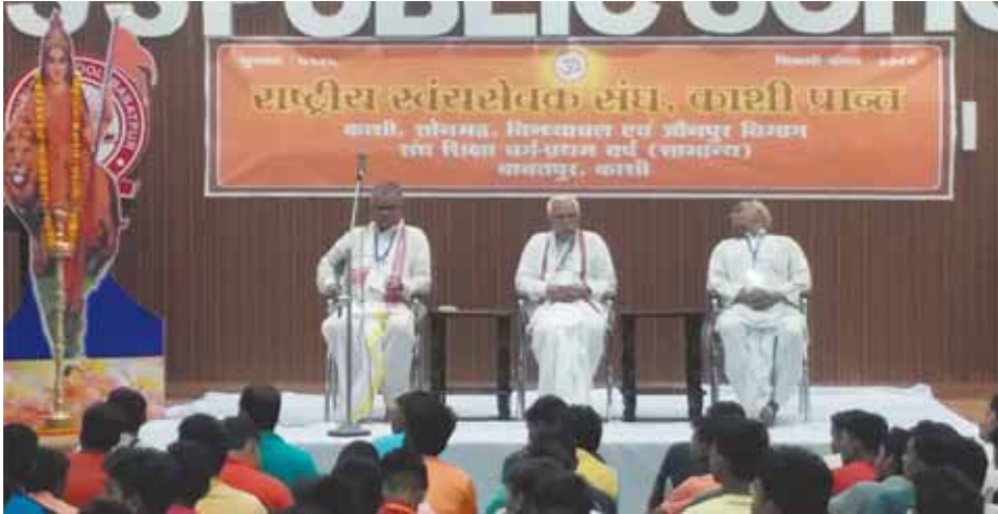
Shiksha Varg training of RSS being held in Varanasi on Saturday.

The RSS leader said that every swayamsevak should come out innocent through training, "This is the main