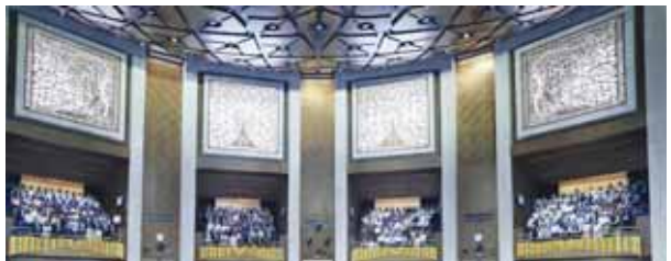
Prime Minister Narendra Modi receives standing ovation as he arrives in the Lok Sabha chamber of the new Parliament building, in New Delhi, on Sunday

The growth of democracy in the country is depicted through a series of exhibits in the Constitution Hall on the new Parliament building, which itself is inspired by the Sri Yantra, used for worship in the Hindu traditions and considered a source of pure energy. The Constitution Hall,