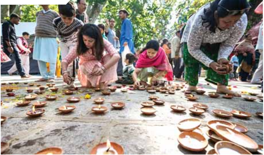
Kashmiri Pandit devotees light earthen lamps during the Kheer Bhawani Mela, at Tulmala in Ganderbal district.