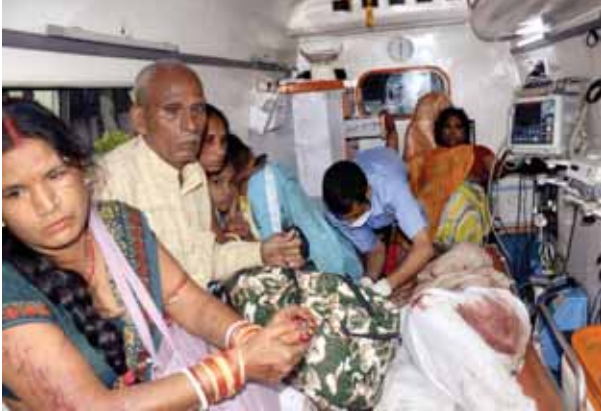
Passengers injured after a bus met with an accident in Jhajjar Kotli area, being shifted to GMC Hospital, in Jammu district, on Tuesday.

"The accident took place at Jhajjar Kotli bridge. Ten people have died. Rescue operation is almost complete," Jammu Senior Superintendent of Police