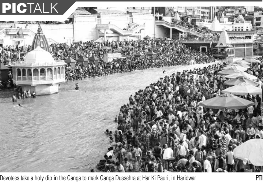
Devotees take a holy dip in the Ganga to mark Ganga Dussehra at Har Ki Pauri, in Haridwar

It may not be easy, though, for the Congress. The fight between Gehlot and Pilot was quite intense in which many red lines were crossed. Gehlot had made several uncharitable remarks about Pilot. Pilot, on his part, had been denouncing the Gehlot Government over inaction on alleged corruption during the previous BJP government under Vasundhara Raje. The big question is: would Gehlot and Pilot be willing to bury the hatchet? It is not just the GOP leadership but the entire Opposition would like them to, for if that happens, not only the Congress would be in a stronger position to take on the Bharatiya Janata Party in the forthcoming State polls but also in the 2024 general election. Further, as an upshot, the entire Opposition would gain strength. Many Opposition leaders are trying to forge an alliance against the Bharatiya Janata Party. Bihar Chief Minister Nitish Kumar will be holding a meeting in Patna in a few days; Nationalist Congress Party leader Sharad Pawar is working towards that end. All these attempts, along with the Congress' newfound confidence, can make arithmetic favourable for the Opposition, but that may not be enough. As we mentioned earlier, Prime Minister Narendra Modi is not the BJP's solitary trump card; the saffron party has also been able to entrench its narrative in political debate—the narrative of muscular nationalism, Hindutva, and unprecedented infrastructure development. The Opposition doesn't have a viable alternative to that.