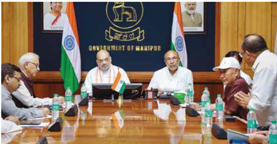
Union Home Minister Amit Shah with Manipur Chief Minister N. Biren Singh chairs a meeting with a delegation of leaders from various political parties, in Imphal, on Tuesday