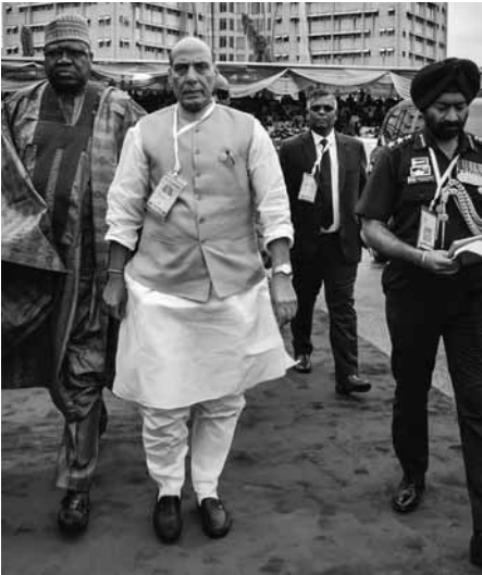
Defence Minister Rajnath Singh attends the swearing-in ceremony of Nigerian President-elect Bola Ahmed Tinubu, in Abuja on Monday

He also interacted with the senior Nigerian