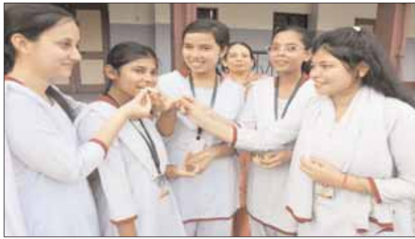
Students celebrate their success after the announcement of 12th class results by Jharkhand Academic Council Examination in Ranchi on Tuesday.

However, toppers giving the result of Ranchi Inter Arts and Commerce have not been able to make a better place in the district. After being equipped with all the facilities and being under the watch of the authorities, the result of capital Ranchi has not been