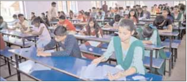
Students appear for the entrance exam for admissions to the CM Schools of Excellence (SoEs) in Jamshedpur on Tuesday.