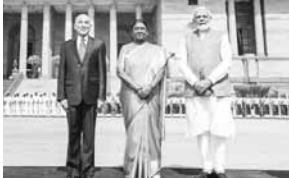
President Droupadi Murmu with Prime Minister Narendra Modi attends the ceremonial reception of the Cambodian King Norodom Sihamoni at Rashtrapati Bhavan, in New Delhi on Tuesday

Modi later tweeted, saying, “Delighted to welcome King HM Norodom Sihamoni of Cambodia. Our nations share deep historical and cultural ties, and we look forward to strengthening our friendship and cooperation even further. May his visit mark a new chap-