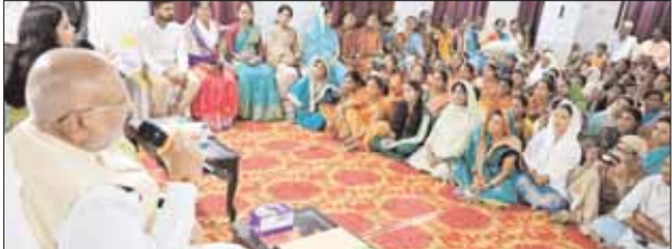
Governor CP Radhakrishnan interacts with villagers during a programme in Ramgarh district on Tuesday.

Encourages women to be self-dependent and contribute to nation building