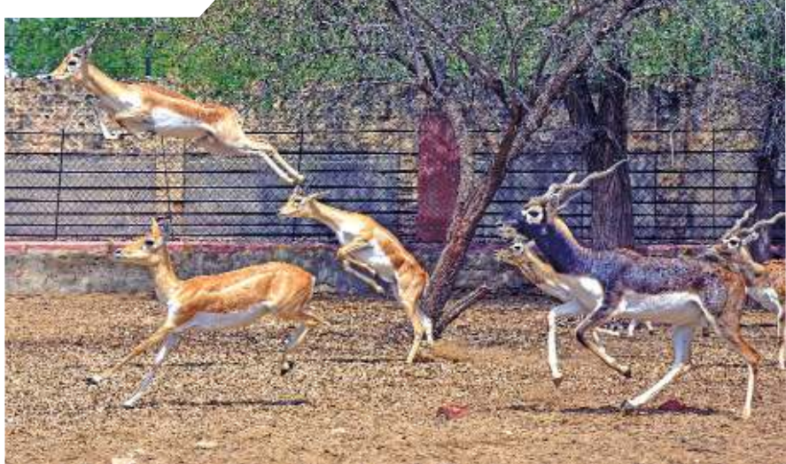
Deer play inside an enclosure at the Bikaner zoo, on Friday.