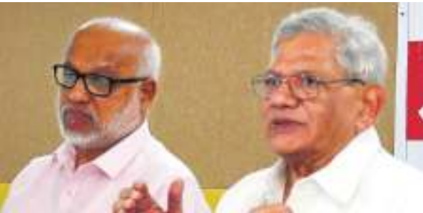
CPM general secretary Sitaram Yechury, addressing a press conference in Vijayawada on Friday.

He alleged that Prime Minister Narendra Modi's disregard for the President of India