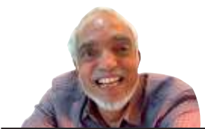
K A BADARINATH

Even if the US revises its debt ceiling of $31.4 trillion, its risk-ridden economy may precipitate a global crisis of a larger magnitude