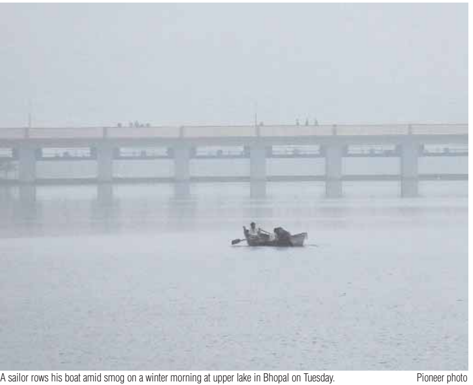
A sailer rows his boat amid smog on a winter morning at upper lake in Bhopal on Tuesday.

years between 2013 and 2023. There was 0.6 mm rainfall in the year 2019 and 0.2 mm rainfall in 2020, whereas this time 8.2 mm rainfall occurred in a few hours. Meteorologist Dr. Singh said that the effect of cold will increase in Bhopal from the first week of December. On November 4, 1977, the day temperature reached 35.3 degrees Celsius. This is the all-time record for such a temperature in November. On November 30, 1941, the night temperature reached 6.1 degrees. In the year 1936, there was 134.1 mm or 5.2 inches of rain in the entire month. The record of highest rainfall in 24 hours is 76.4 mm i.e. 3 inches on November 10, 1969.