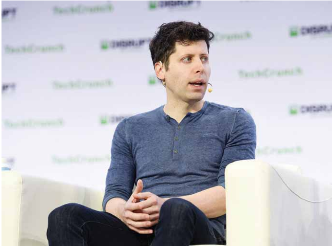
examples of a founder's ousting in history. The ride-sharing giant's rapid ascent was accompanied by numerous controversies, including allegations of workplace harassment and a toxic corporate culture. In this instance, the board's decision to remove Kalanick was driven not just by financial concerns but also by a pressing need to address the company's tarnished reputation. Kalanick's story underscores the importance of accountability in leadership. While founders are often given leeway in the early stages, the moment their actions jeopardise the company's integrity or public perception, boards are compelled to act. This raises questions about the delicate balance between a founder's autonomy and the responsibility they bear to the company and its stakeholders.

The case of Travis Kalanick at Uber is perhaps one of the most infamous