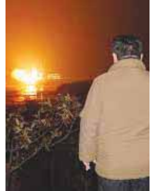
send high-resolution imagery and perform proper military reconnaissance.

North Korea hasn't yet released those satellite photos. Outside experts remain skeptical about whether the North Korean satellite can