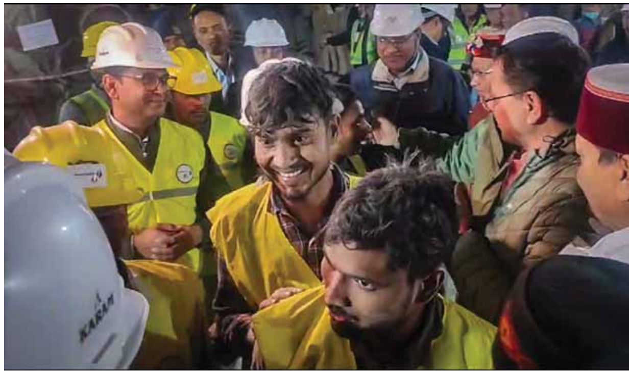
Jubilance as the trapped workers come out of the collapsed Silkyara Tunnel in Uttarkashi on Tuesday. Uttarakhand Chief Minister Pushkar Singh Dhami and Union Minister of State for Road Transport & Highways VK Singh greet them