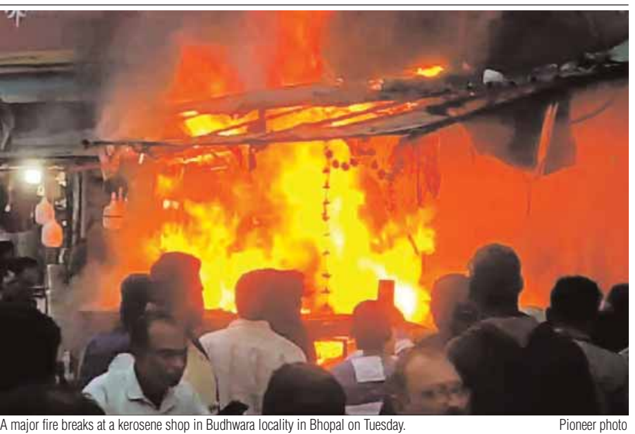
A major fire breaks at a kerosene shop in Budhwara locality in Bhopal on Tuesday.