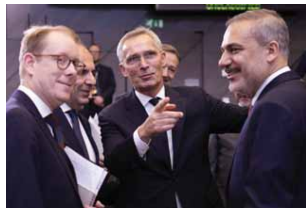
NATO Secretary General Jens Stoltenberg, centre, speaks with Sweden's Foreign Minister Tobias Billstrom, left, and Turkey's Foreign Minister Hakan Fidan, right, during a meeting of NATO foreign ministers in North Atlantic Council session at NATO headquarters in Brussels, on Tuesday

"It is doable," he said. "We can do it if we are calm but