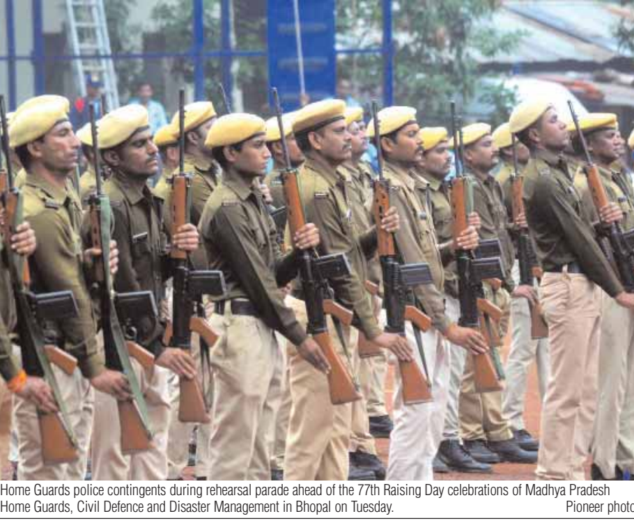
Home Guards police contingents during rehearsal parade ahead of the 77th Raising Day celebrations of Madhya Pradesh Home Guards, Civil Defence and Disaster Management in Bhopal on Tuesday.

effect was issued by the department. The RERA also alleged in its order that such civic authorities as MCD, DDA, NDMC, and Delhi Cantonment Board were sanctioning building plans with additional dwelling units without kitchen, or built with pantry or store. "The builders after sanction of building plans, convert pantries and stores into kitchens and sell units as separate dwelling units, circumventing orders of the Hon'ble Supreme Court," the authority had charged in its order. The Delhi RERA order had stated that as per the Unified Building Bylaws, 2016, and the Supreme Court order of March 14, 2008, the number of dwelling units was fixed to just three in case of plots measuring up to 50 square metre and four in case of plot sizes above 50-250 square metre.