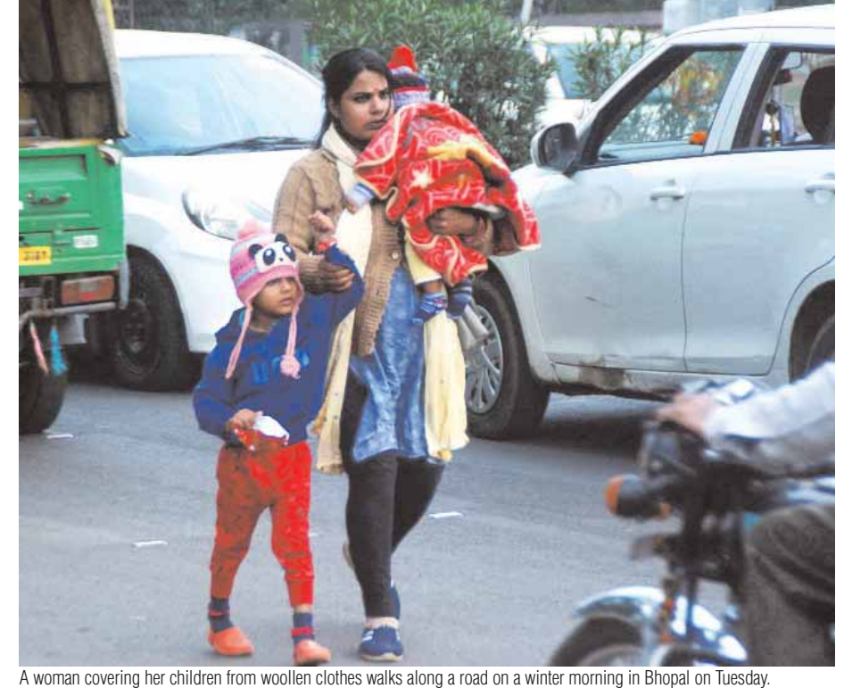
A woman covering her children from woolen clothes walks along a road on a winter morning in Bhopal on Tuesday.